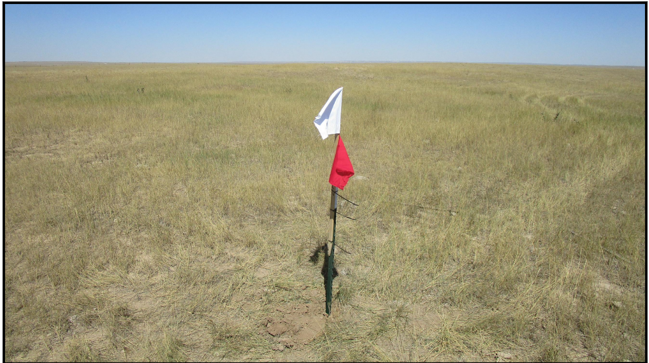
PHOTO: VIEW OF AS-DRILLED LOCATION