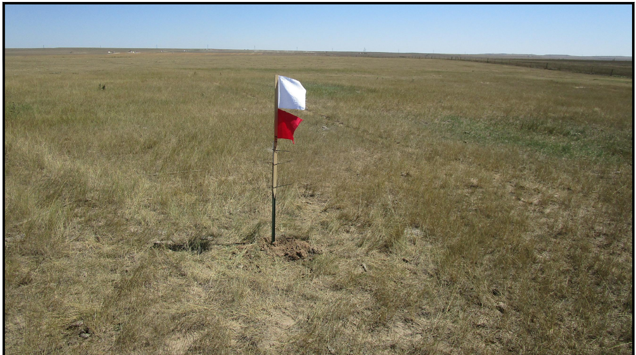
PHOTO: VIEW OF AS-DRILLED LOCATION