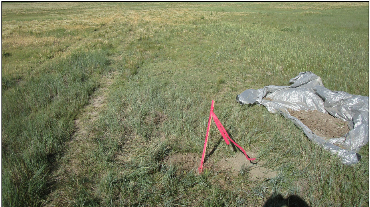
PHOTO: VIEW OF AS-DRILLED LOCATION