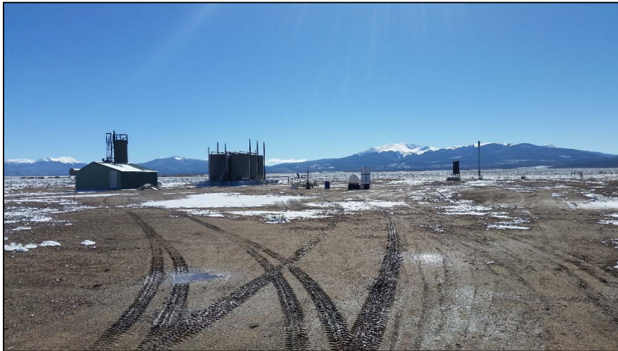
Photo 1. Overview of location taken at entrance facing southeast.