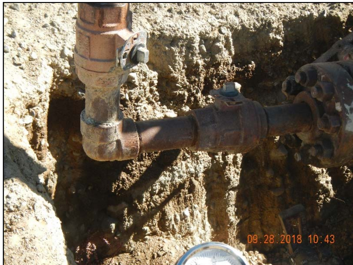
Photo 1. Soil staining from historical spills at wellhead.