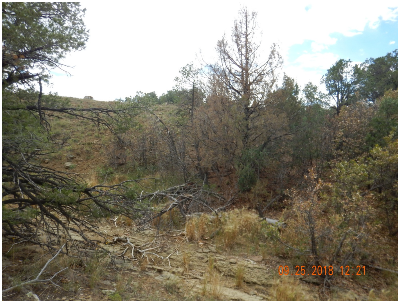
Dead vegetation down gradient from produced water pit.