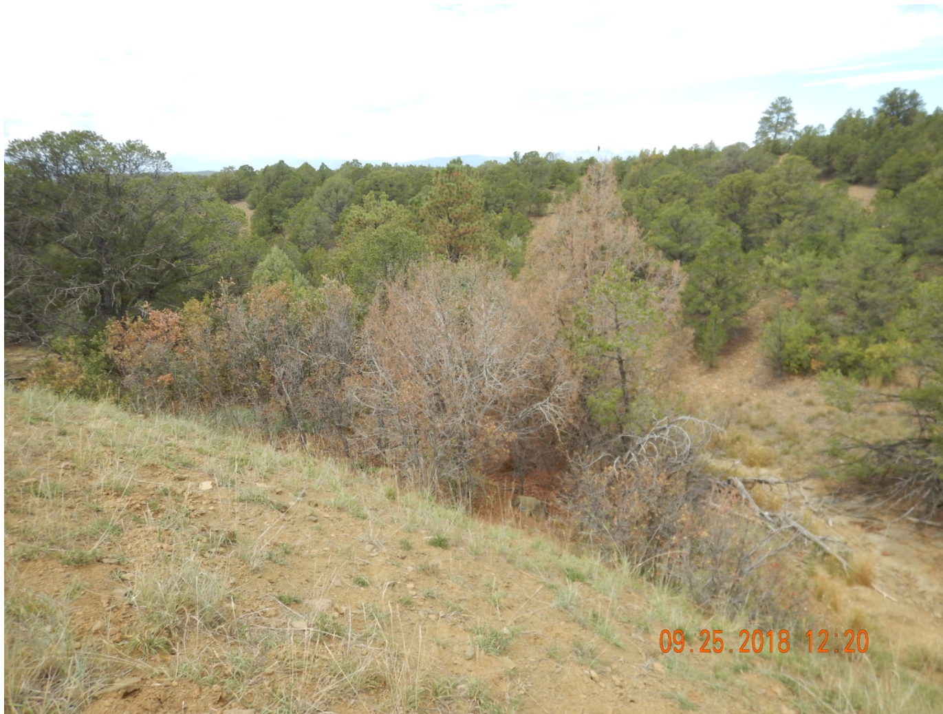
Dead vegetation down gradient from produced water pit.

Location Name: Leah 23-5 wellsite Spill #456896 Inspection Date: 9/25/2018