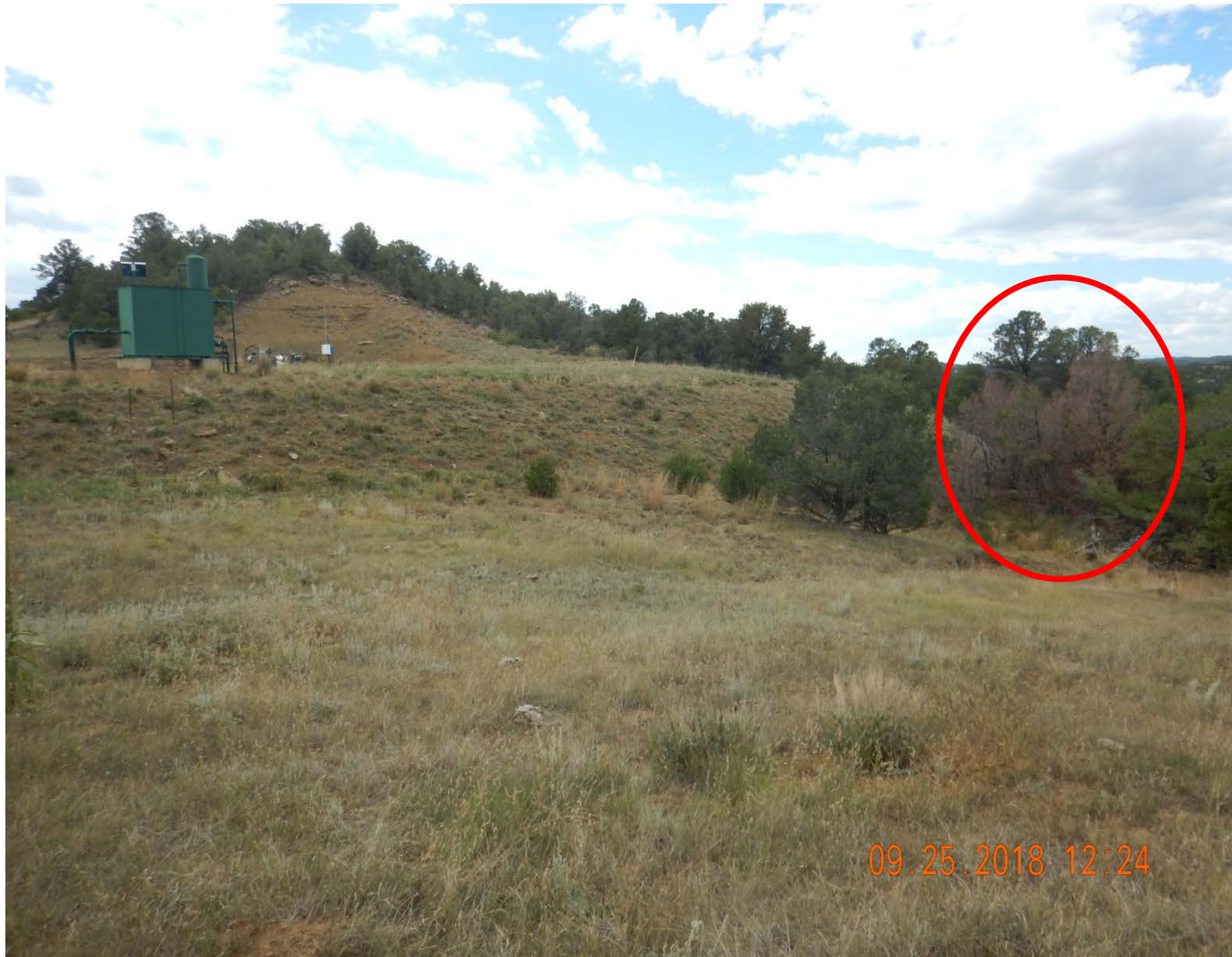
Dead vegetation down gradient from produced water pit.

Location Name: Leah 23-5 wellsite Spill #456896 Inspection Date: 9/25/2018