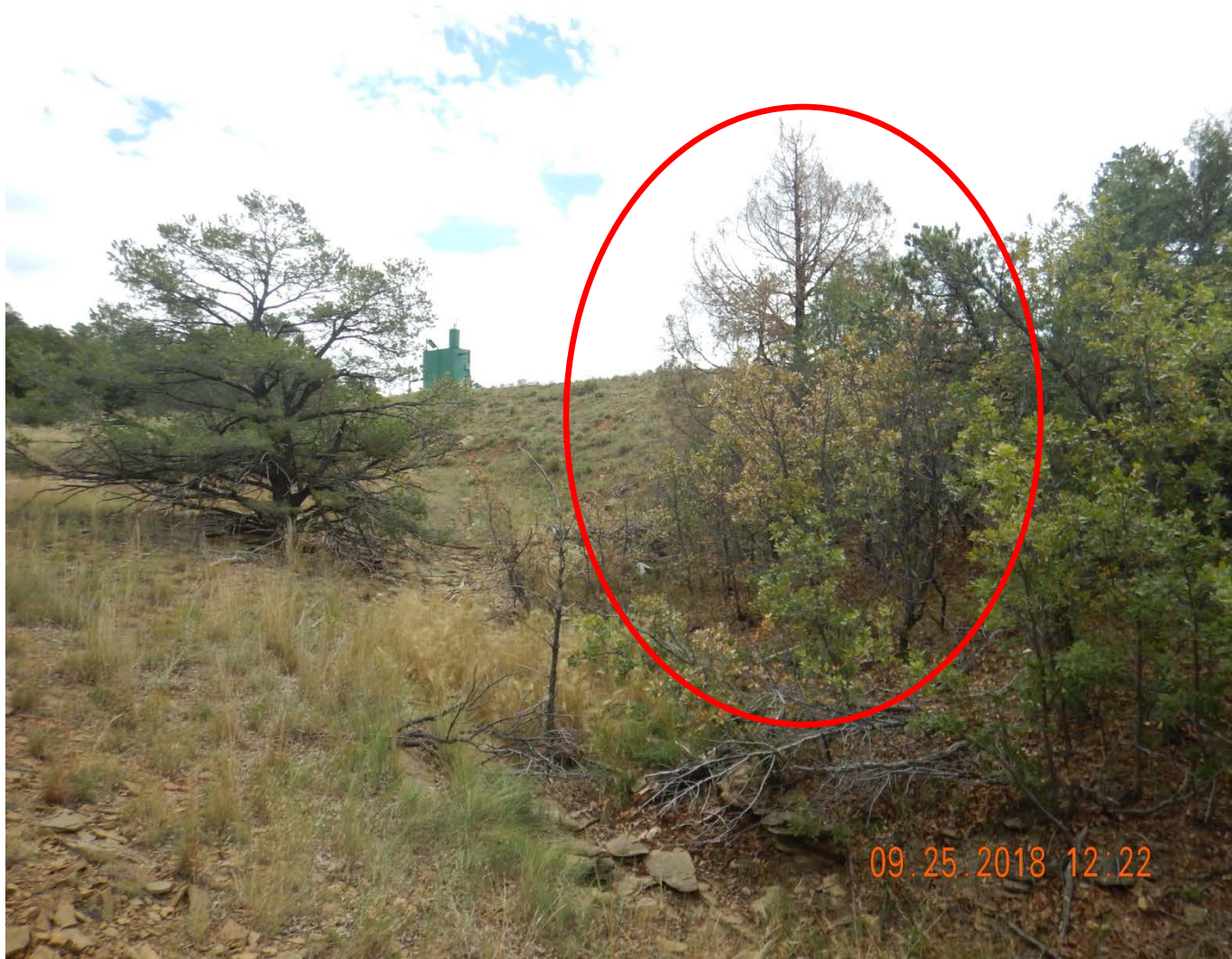
Dead vegetation down gradient from produced water pit.