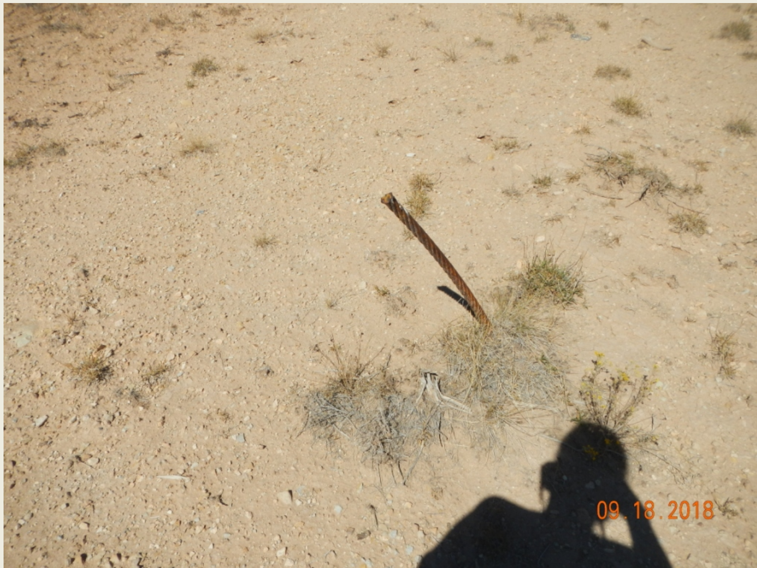
Photo 5. View of anchor cable still in place. Two of these observed within the project area. Others may be present. These need to be removed along with anchors if still in place.