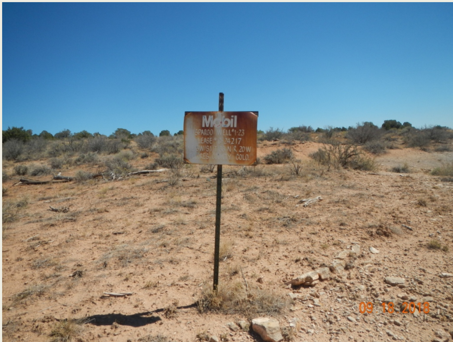
Photo 6. View of sign at the entrance of the well pad needs to be removed.