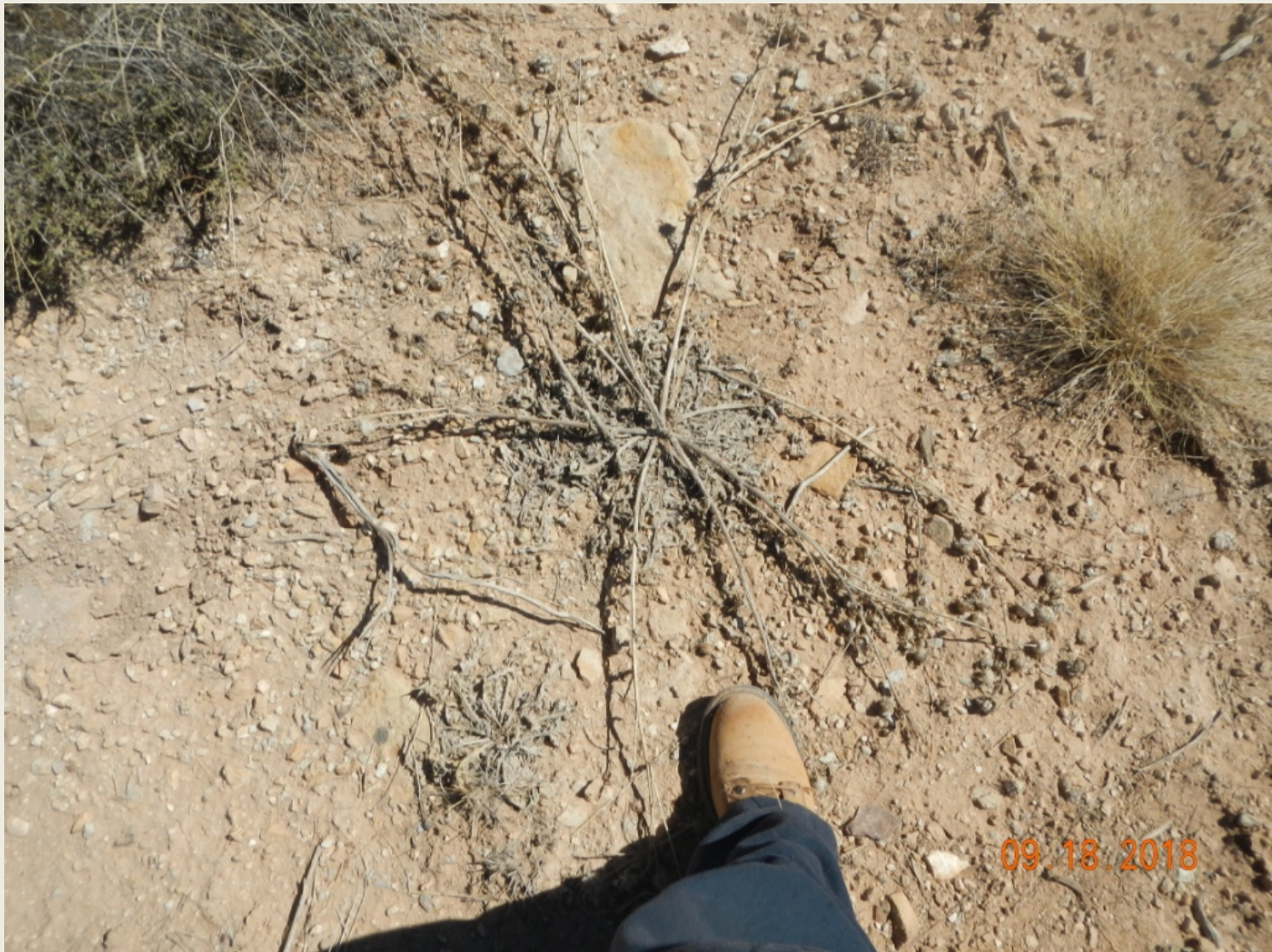
Photo 7. View of what appears to be treated thistle within the project area.