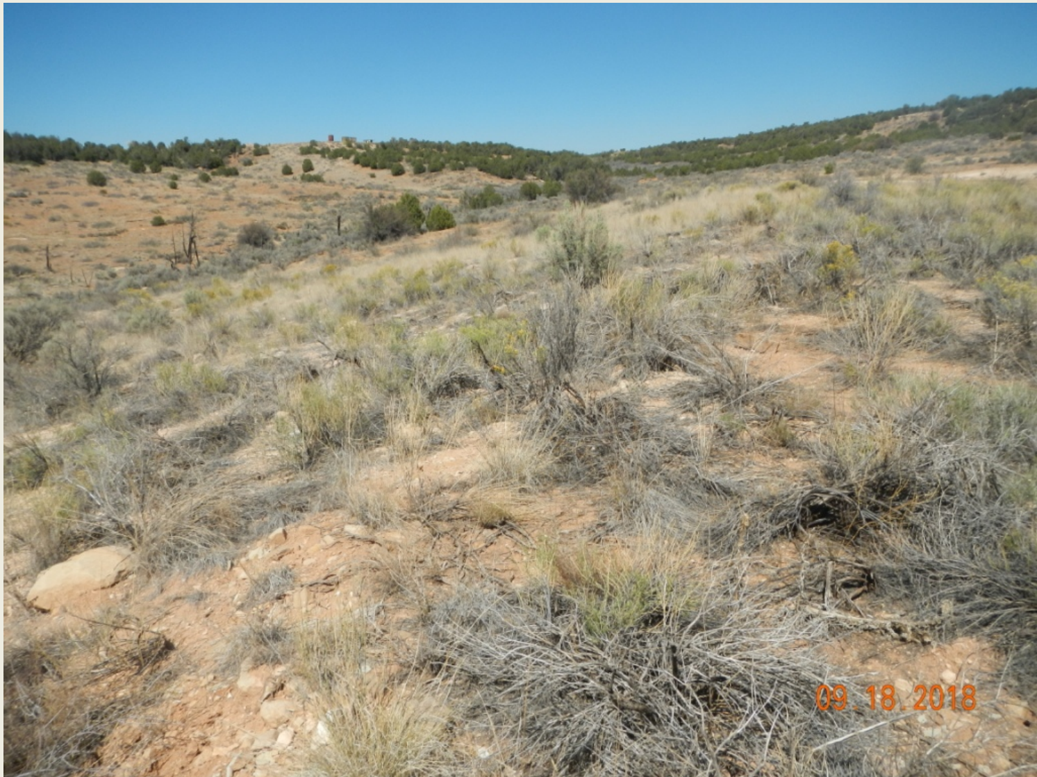
Photo 4. View of the western project area from the southwestern corner facing northward.