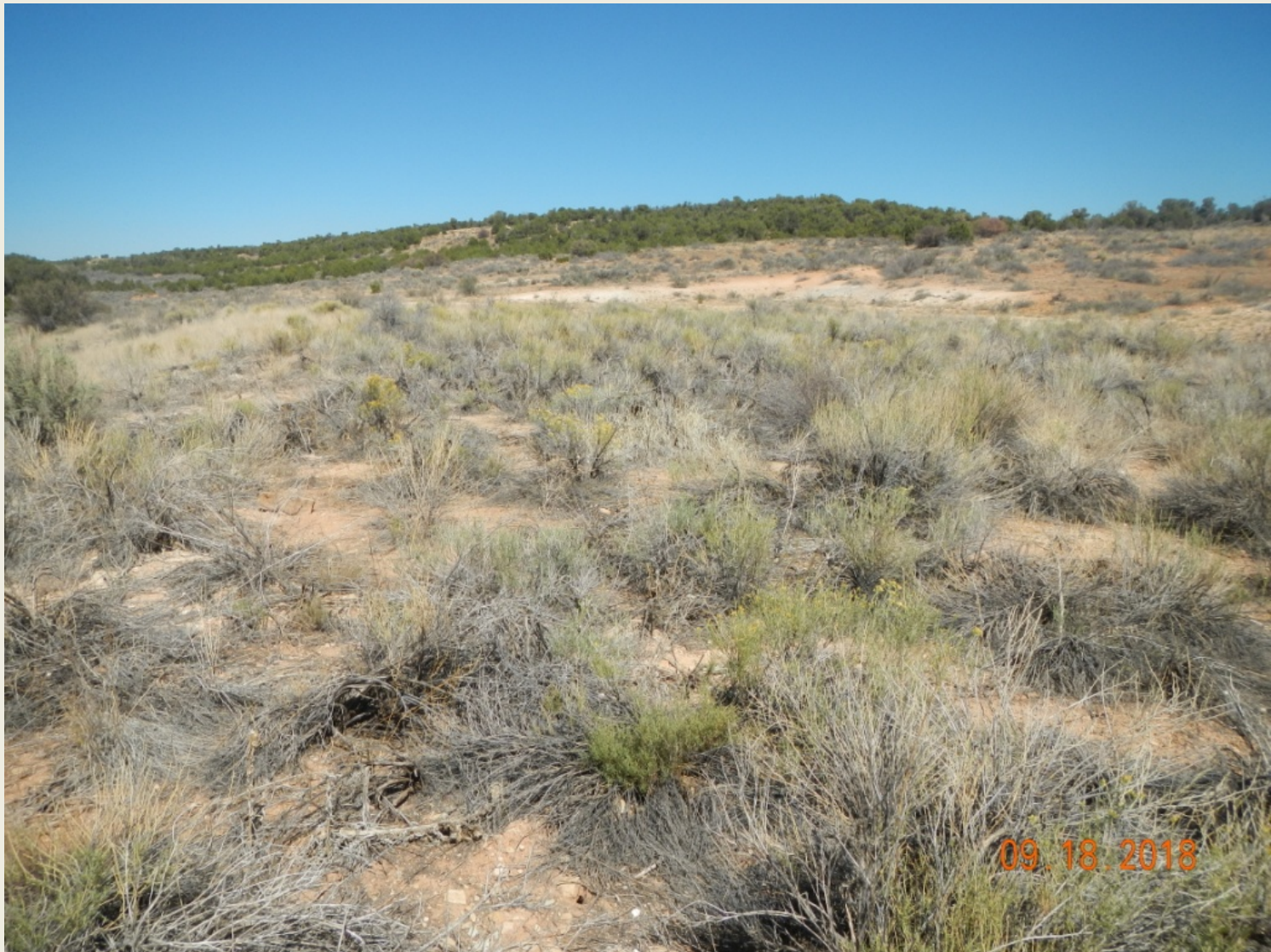
Photo 2. View of the project area from the southwestern corner facing center. Revegetation is progressing with dense rabbitbrush ( Chrysothamnus nauseosus ) and sand dropseed ( Sporobolus cryptandrus ).