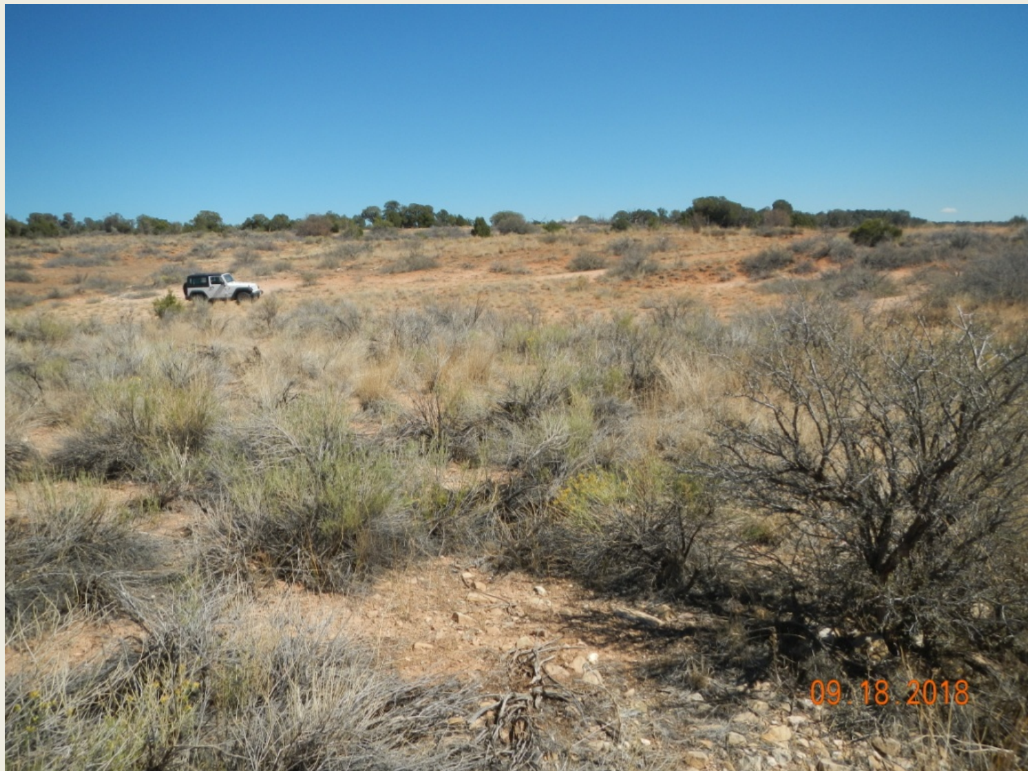
Photo 3. View of the southern project area from the southwestern corner facing eastward.