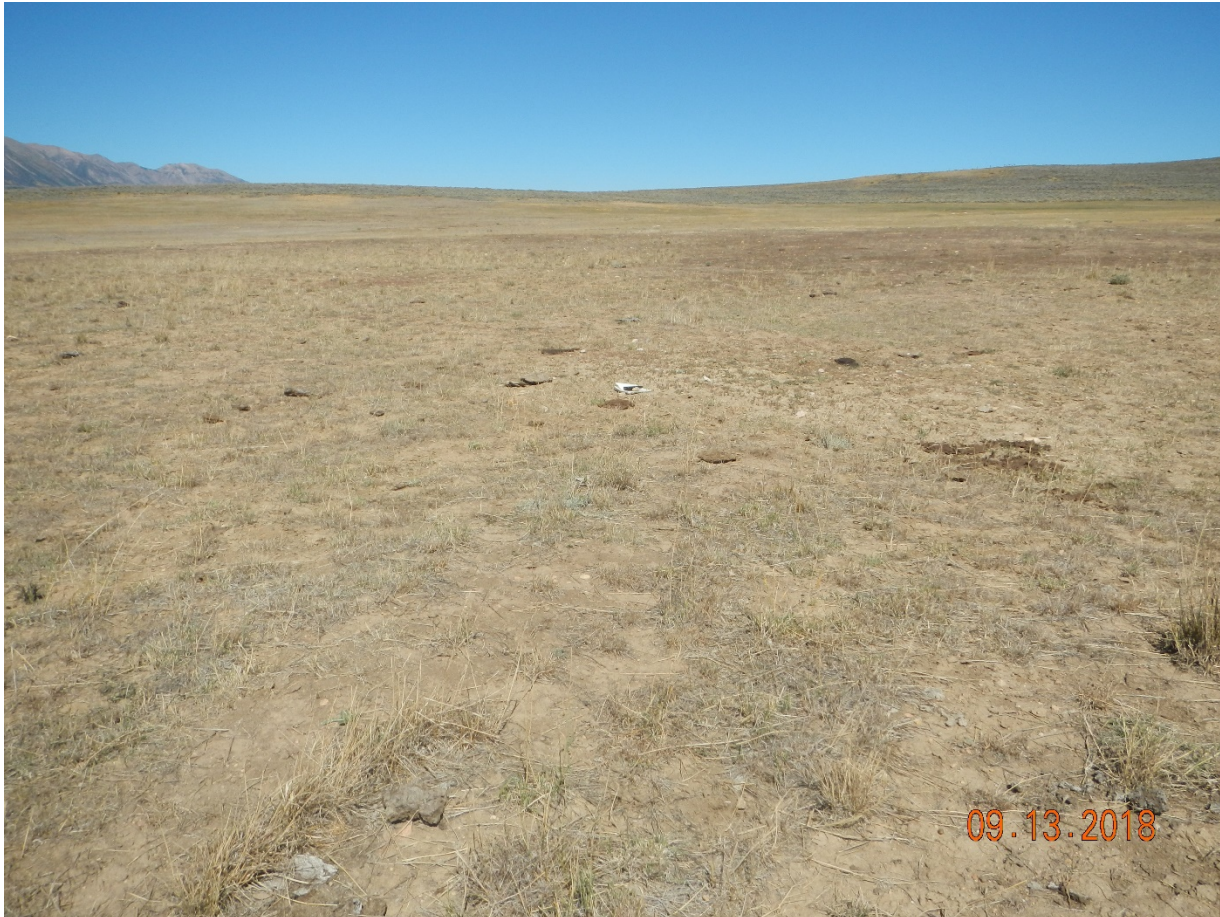
Photo#1: Overview of Location to Northwest. Site has been heavily grazed this year