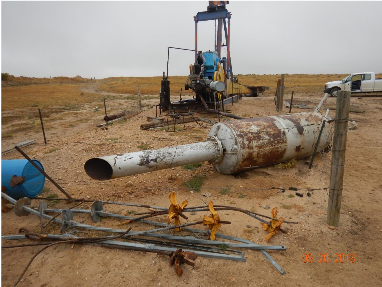
Photo 9: Photo taken from the west end of the well location, facing east. Photo shows various debris and equipment remaining on location. Photo also shows no reclamation activities appear to have been conducted in accordance w/ 1004.a