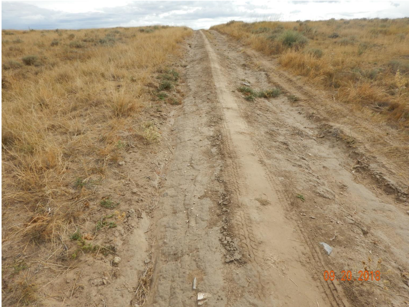
Photo 32: Photo taken from the access road, south of the location. Photo shows access road has not been reclaimed or maintained; erosion degradation evident.