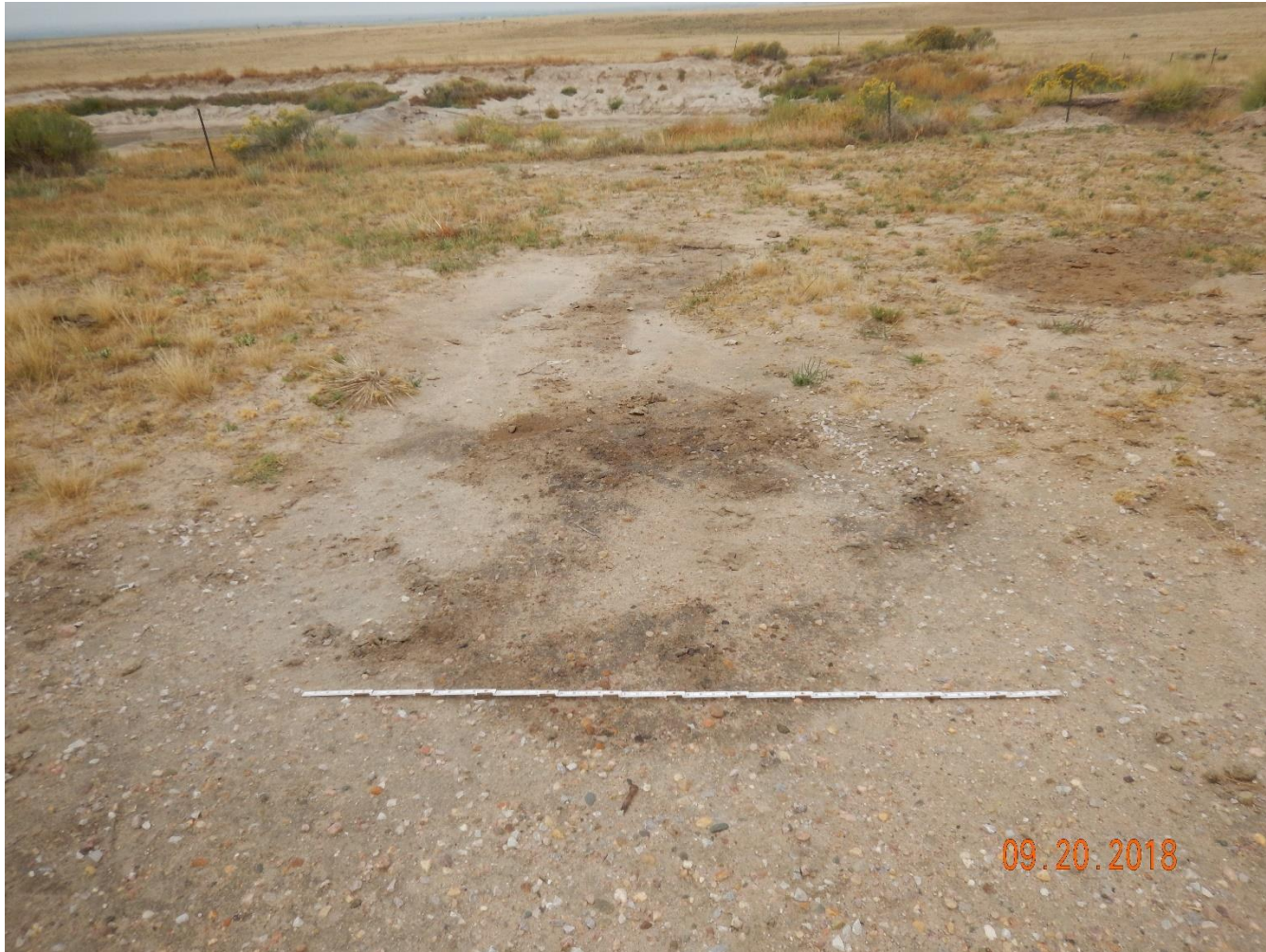
Photo 25: Photo taken from the west end of the battery location. Photo shows contaminated soils on the battery location. 6 foot measuring stick for reference.