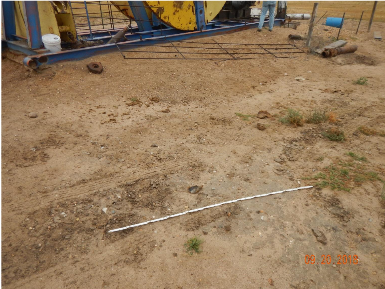
Photo 11: Photo taken from the north end of the well, facing southwest. Photo shows areas of contaminated soils observed on the location. 6 foot measuring stick for reference.