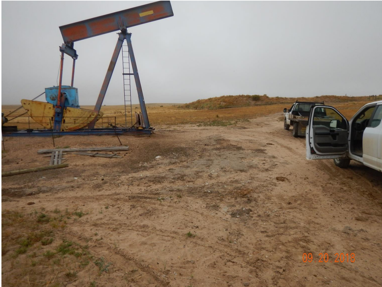
Photo 2: Photo taken from the south end of the well location, facing north. Photos 1-2 provide an overview of the well location. Photo shows various equipment and trash debris remain on site. Photo also shows no reclamation activities appear to have been conducted in accordance w/ 1004.a