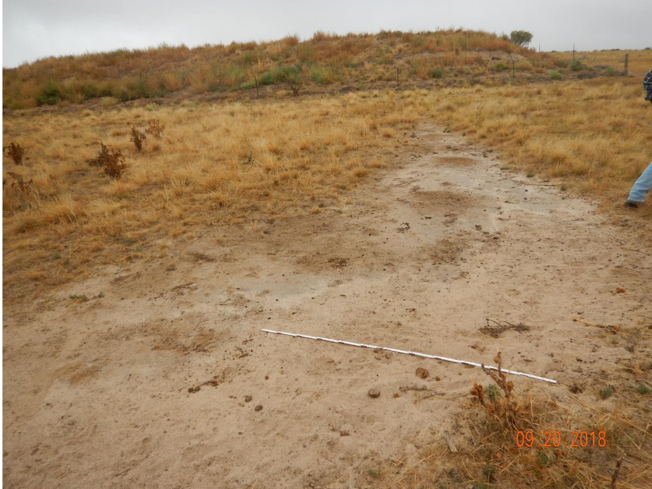
Photo 14: Photo taken from the west of the pit location, facing east. Photo shows areas of the closed pit that remained unvegetated. These areas require reclamation. Additional remediation may be required.