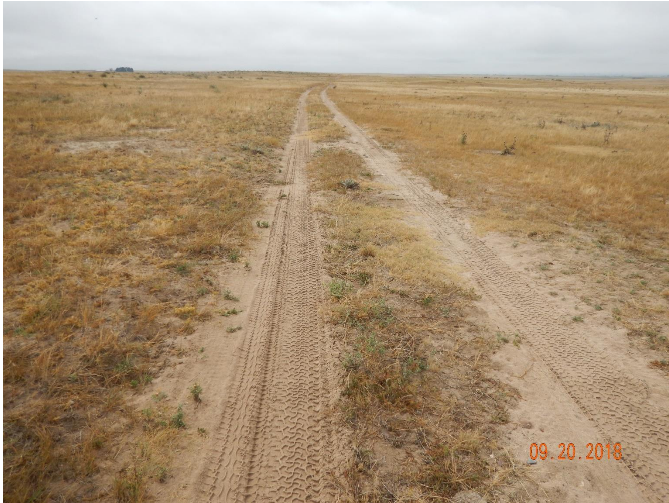
Photo 30: Photo taken from the access road, south of the location. Photo shows access road has not been reclaimed or maintained.