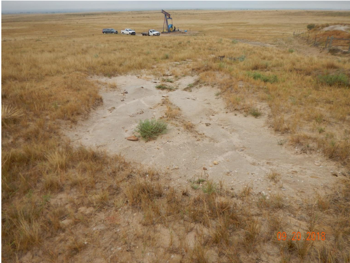
Photo 28: Photo taken from the southwest of the battery. Photo shows area of a previous spill. Photo shows area remains predominantly bare and exposed soil. Area requires remediation/reclamation.