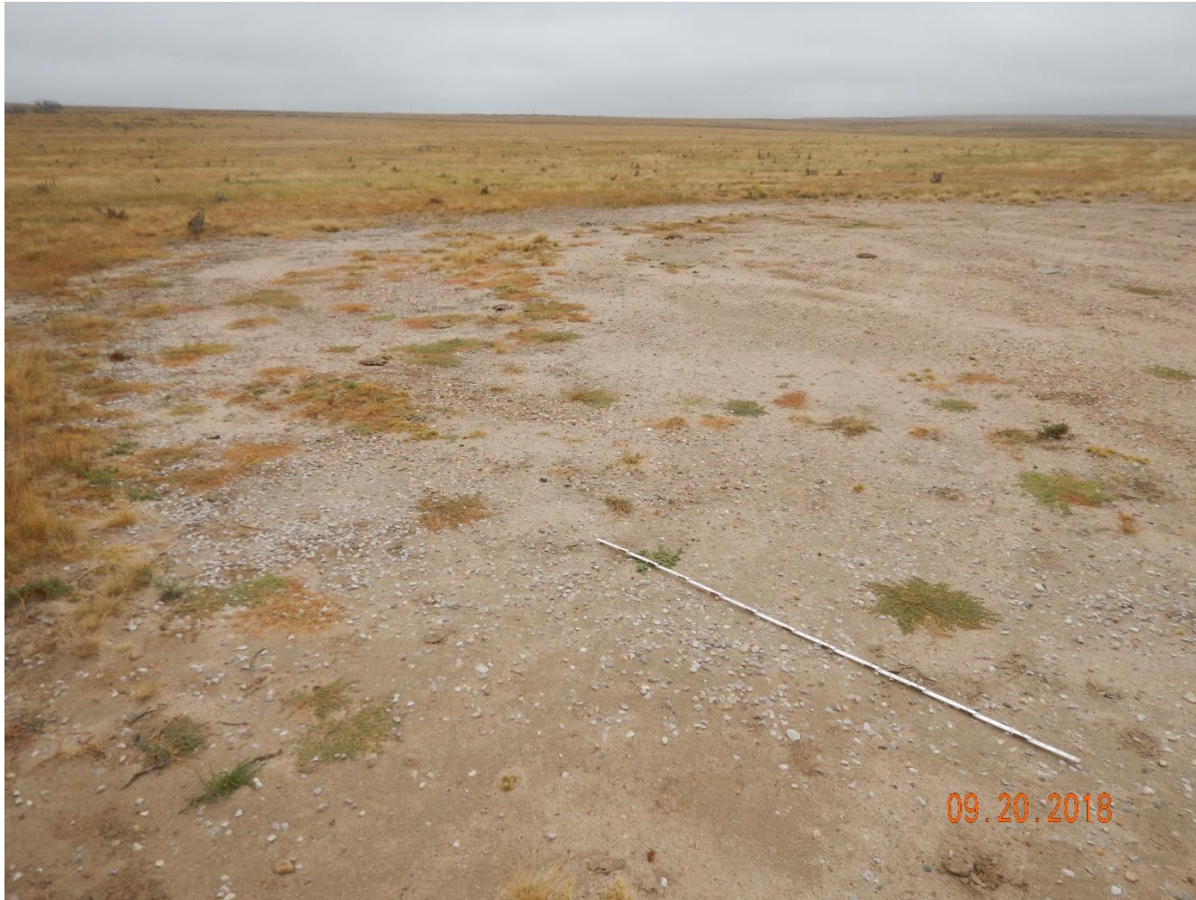
Photo 23: Photo taken from the northwest end of the battery location, facing east. Photo shows battery location has not been reclaimed. 6 foot measuring stick for reference.