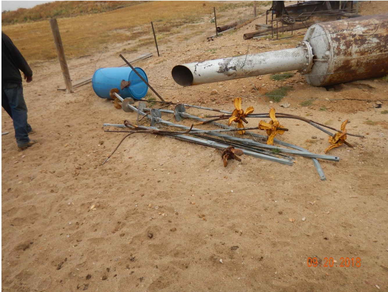
Photo 8: Photo taken from the west end of the well location, facing northeast. Photo shows various debris and equipment remaining on location.