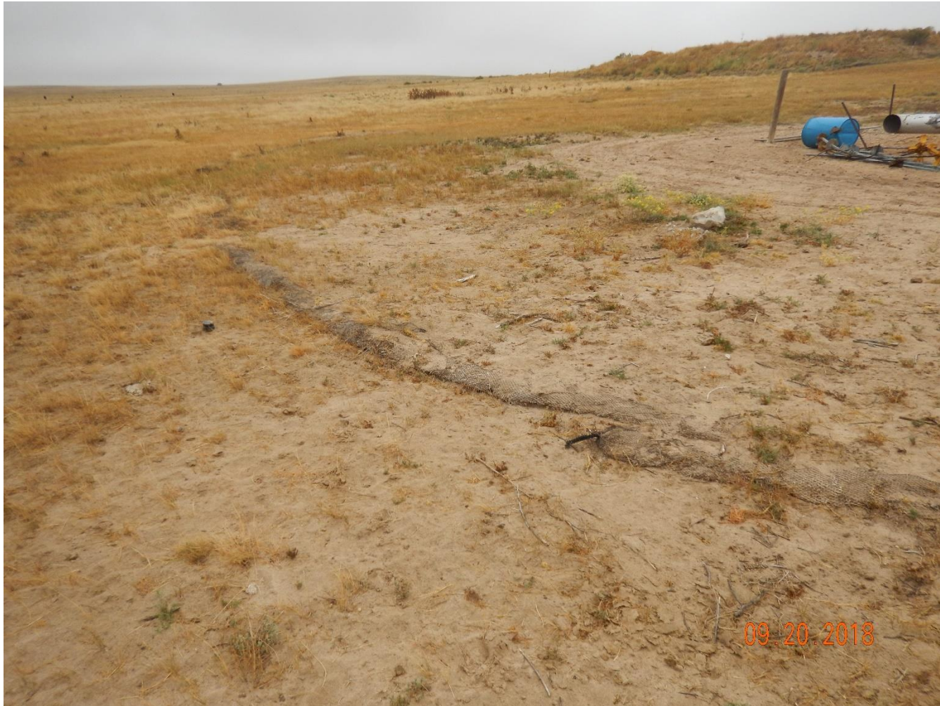
Photo 6: Photo taken from the west end of the well location, facing north. Operator appears to have installed straw wattles stormwater and sediment control BMPs. BMPs have not been maintained and are no longer in proper functioning conduction. Wattles are now considered debris and will need to be removed