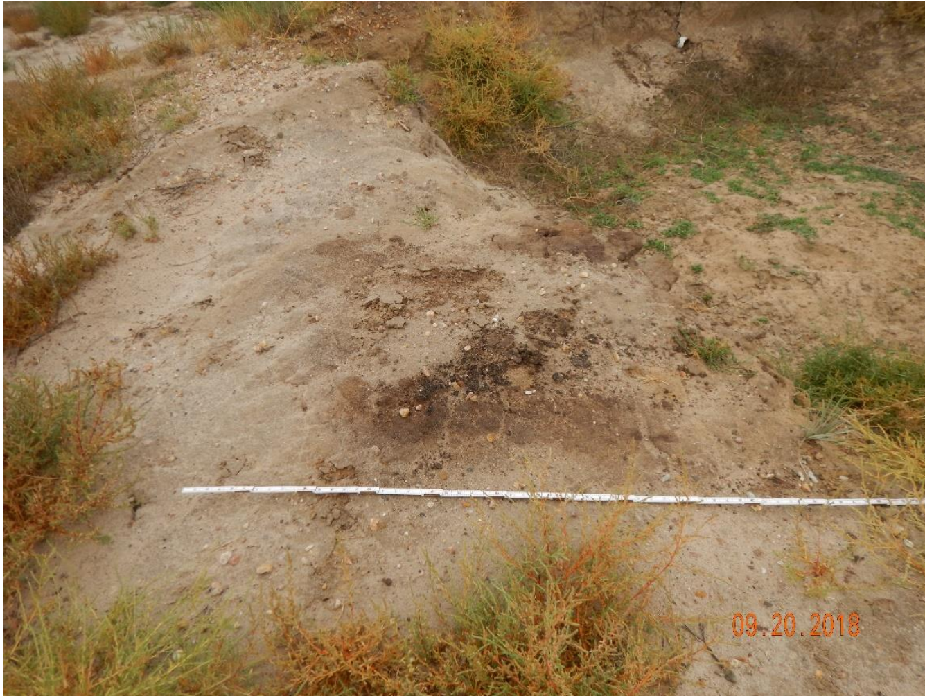
Photo 17: Photo taken from the skim pit. Photo of contaminated soils. 6 foot measuring stick reference.