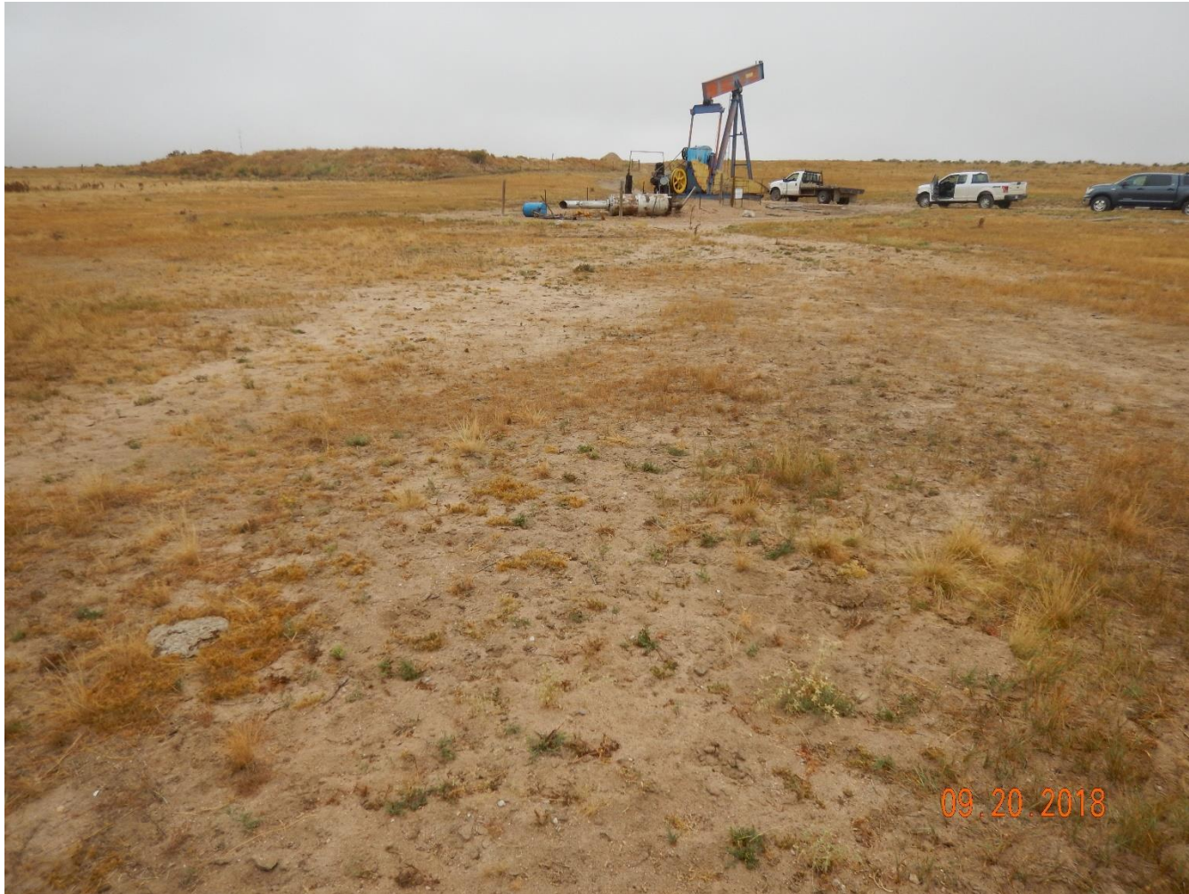
Photo 4: Photo taken from the southwest of the well location, facing northeast. Photo shows area of a former spill that caused degradation on the adjacent lands. These areas require reclamation.