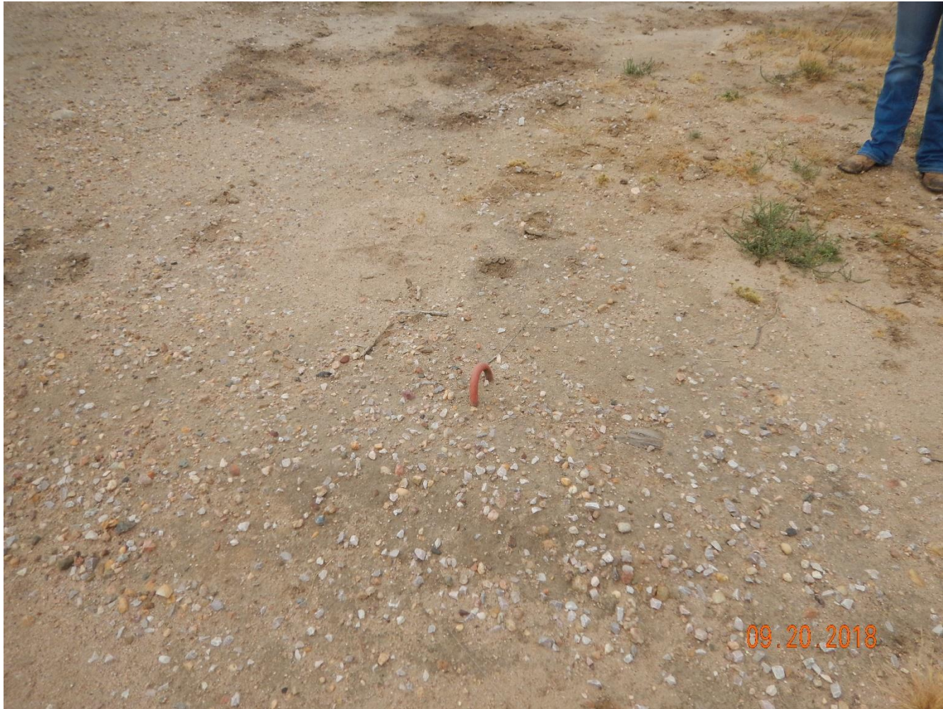
Photo 24: Photo taken from the northwest end of the battery. Photo shows anchor remaining on site.