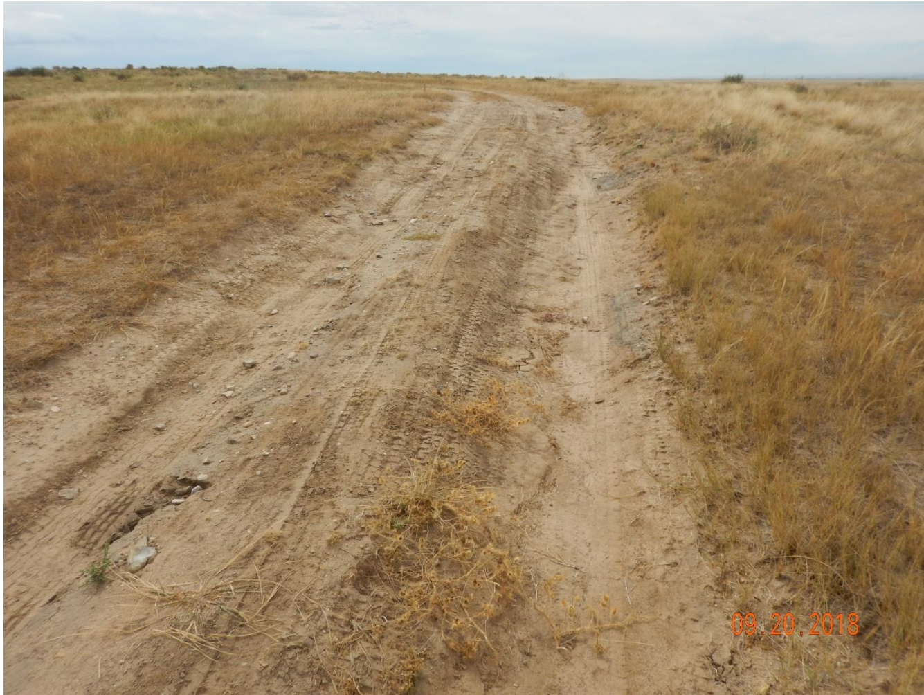
Photo 31: Photo taken from the access road, south of the location. Photo shows access road has not been reclaimed or maintained; erosion degradation evident.