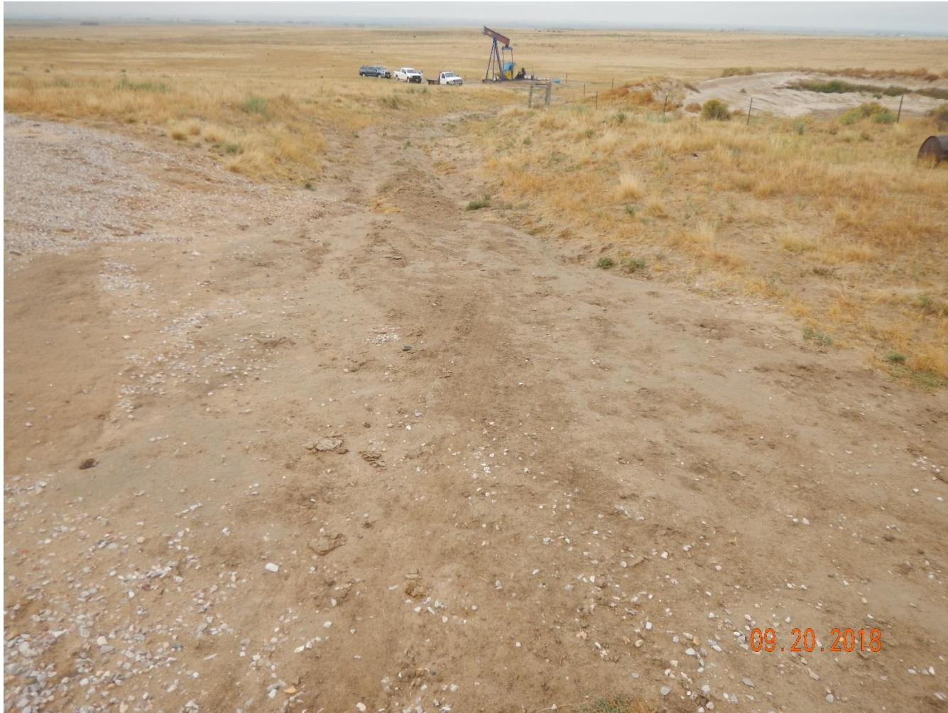
Photo 27: Photo taken from the west end of the battery, facing southwest. Photo shows area of access road leading from the well to the battery. Photo shows access road has not been reclaimed. Erosion degradation evident.