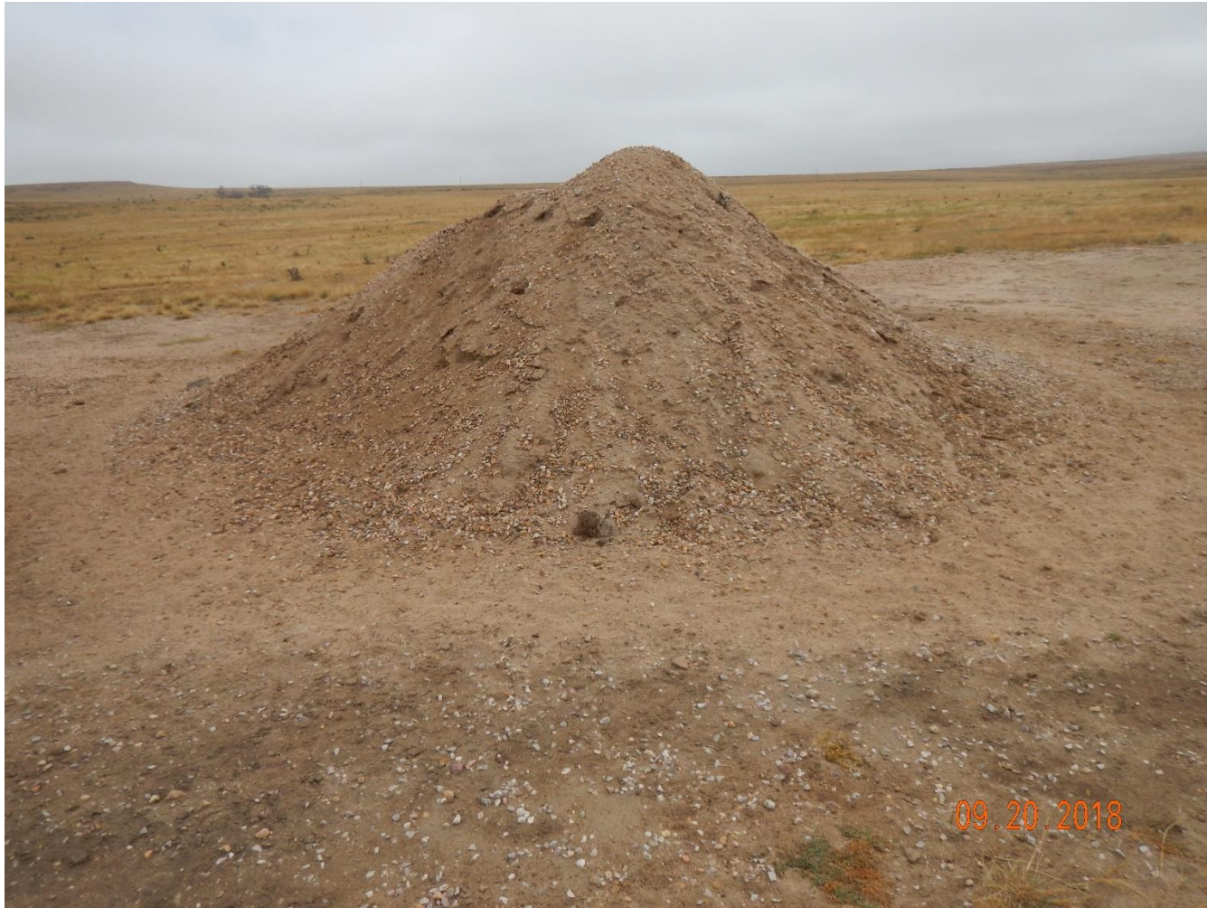
Photo 26: Photo taken from the southern end of the battery. Photo shows a pile of soil stored on locaiton.