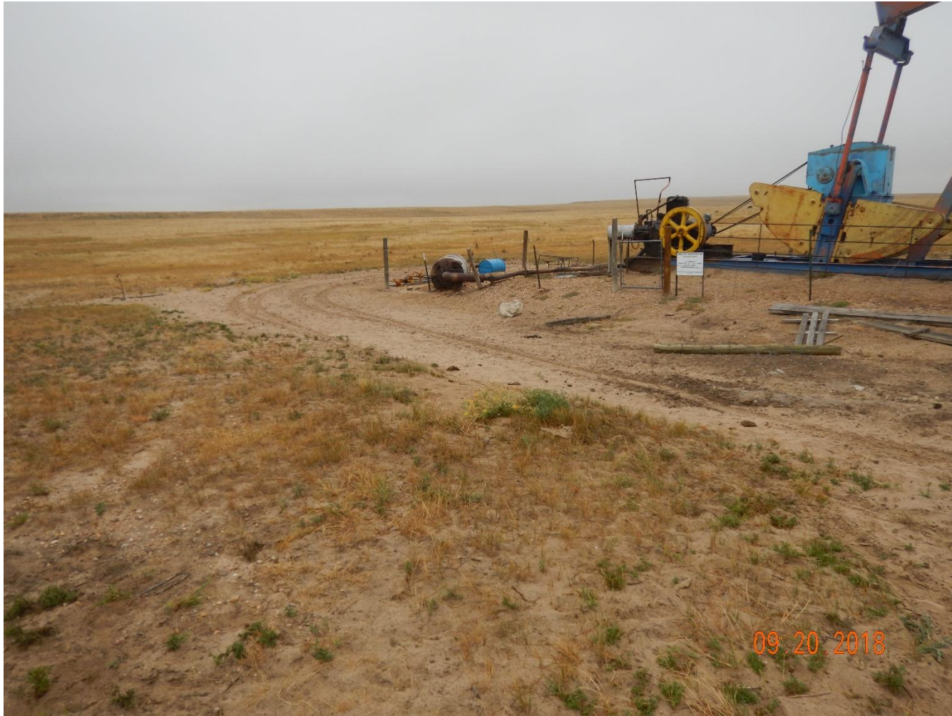
Photo 1: Photo taken from the south end of the well location, facing northwest. Photos 1-2 provide an overview of the well location. Photo shows various equipment and trash debris remain on site. Photo also shows no reclamation activities appear to have been conducted in accordance w/ 1004.a