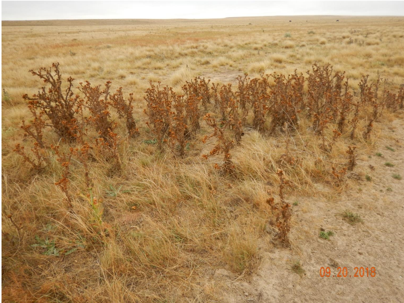
Photo 15: Photo taken from the west of the pit location, facing northeast. Photo shows Scotch Thistle. This is a Colorado State listed Noxious weed and required management.