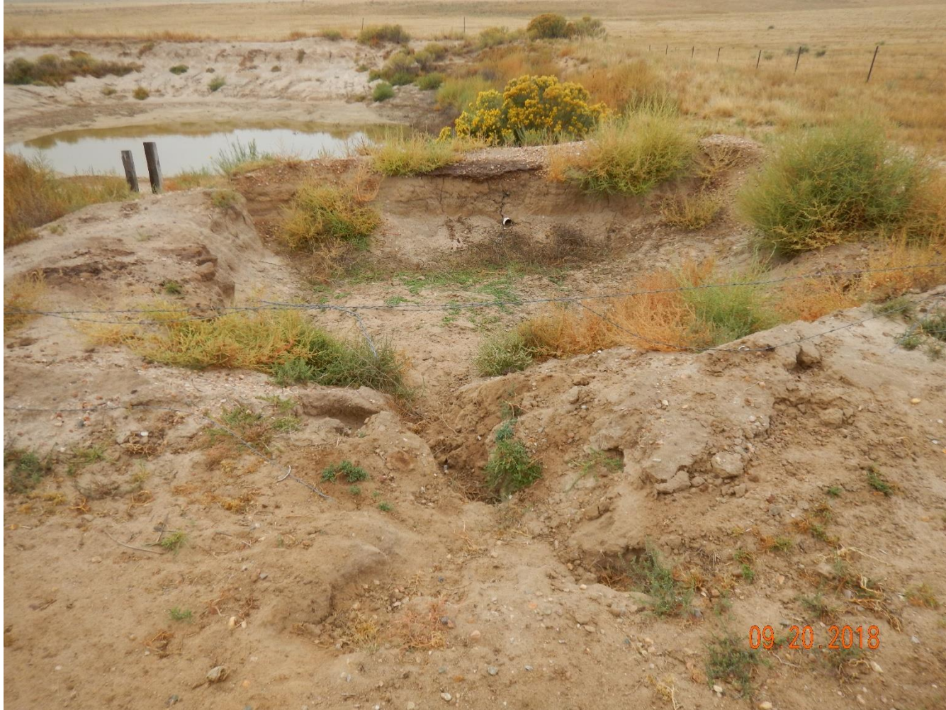
Photo 16: Photo taken from the east end of the skim pit, facing west.