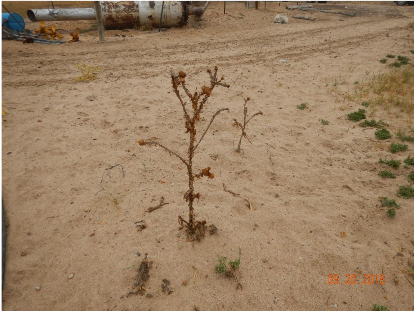
Photo 7: Photo taken from the west end of the well location. Photo shows Scotch Thistle. This is a Colorado State listed Noxious weed and required management.