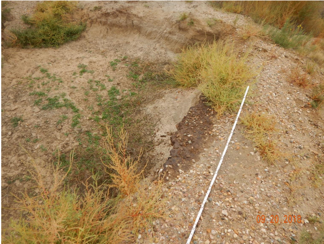
Photo 18: Photo taken from the skim pit. Photo of contaminated soils. 6 foot measuring stick reference.