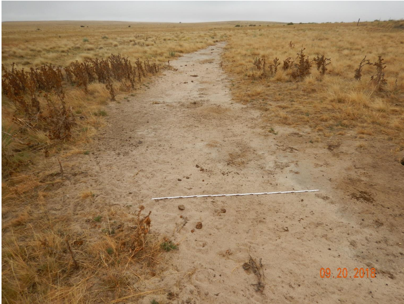
Photo 13: Photo taken from the west of the pit location, facing north. Photo shows areas of the closed pit that remained unvegetated. These areas require reclamation. Additional remediation may be required.