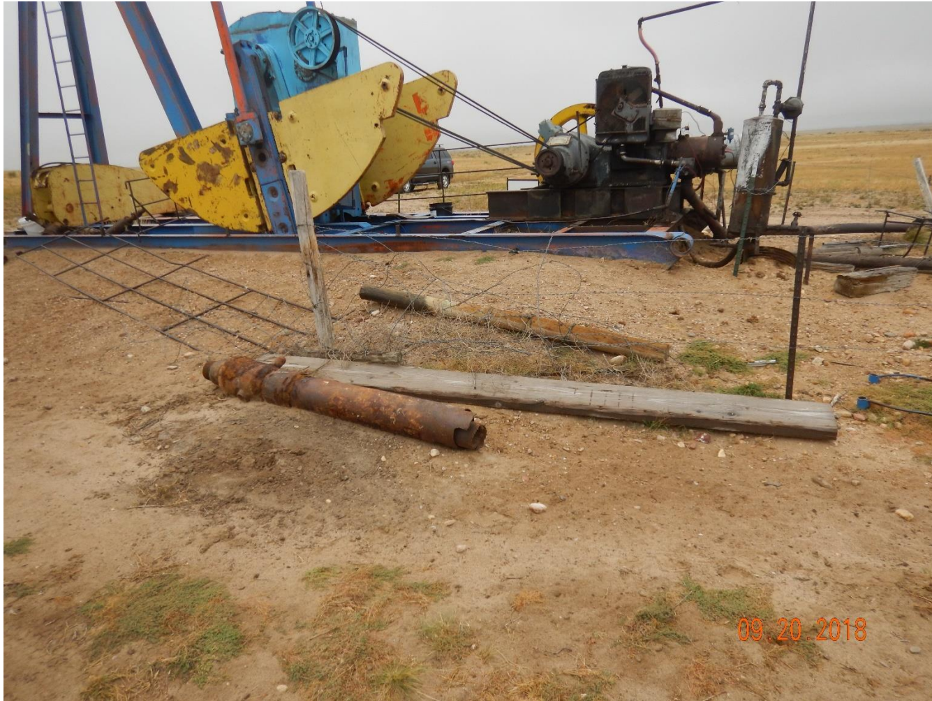
Photo 10: Photo taken from the north end of the well location, facing south. See comments under photo 9.