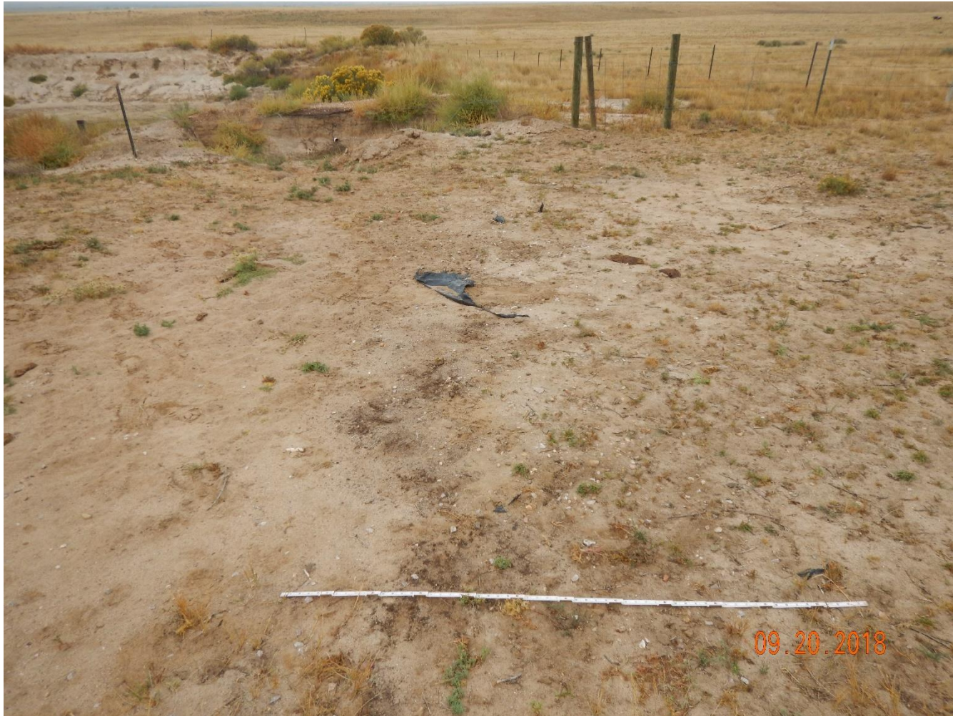
Photo 21: Photo taken from the north end of the battery location, facing west. Photo shows areas where contaminated soils were once stored. Tarp remains on site. 6 foot measuring stick for reference.