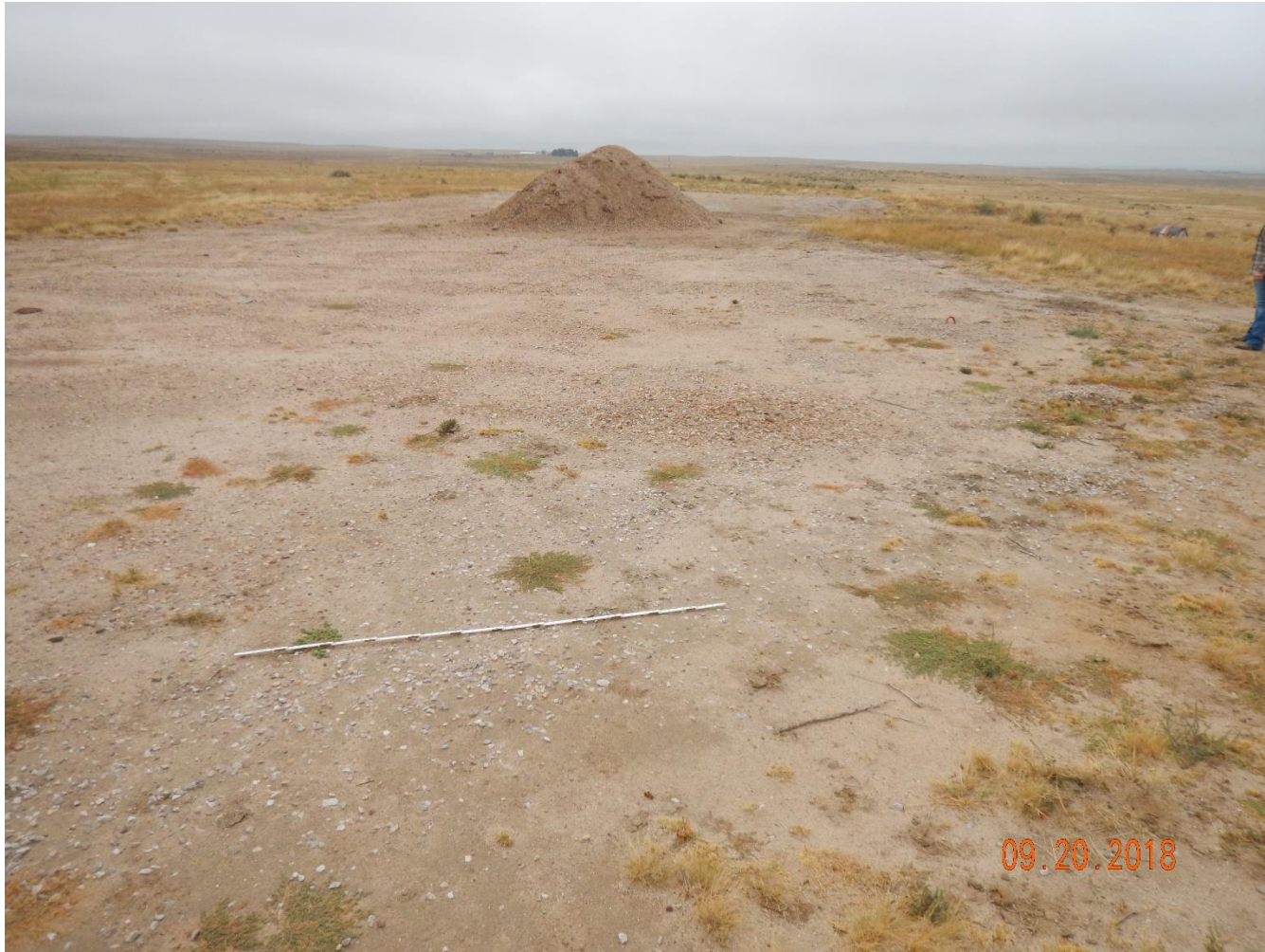
Photo 22: Photo taken from the northwest end of the battery location, facing south. Photo shows battery location has not been reclaimed. 6 foot measuring stick for reference.