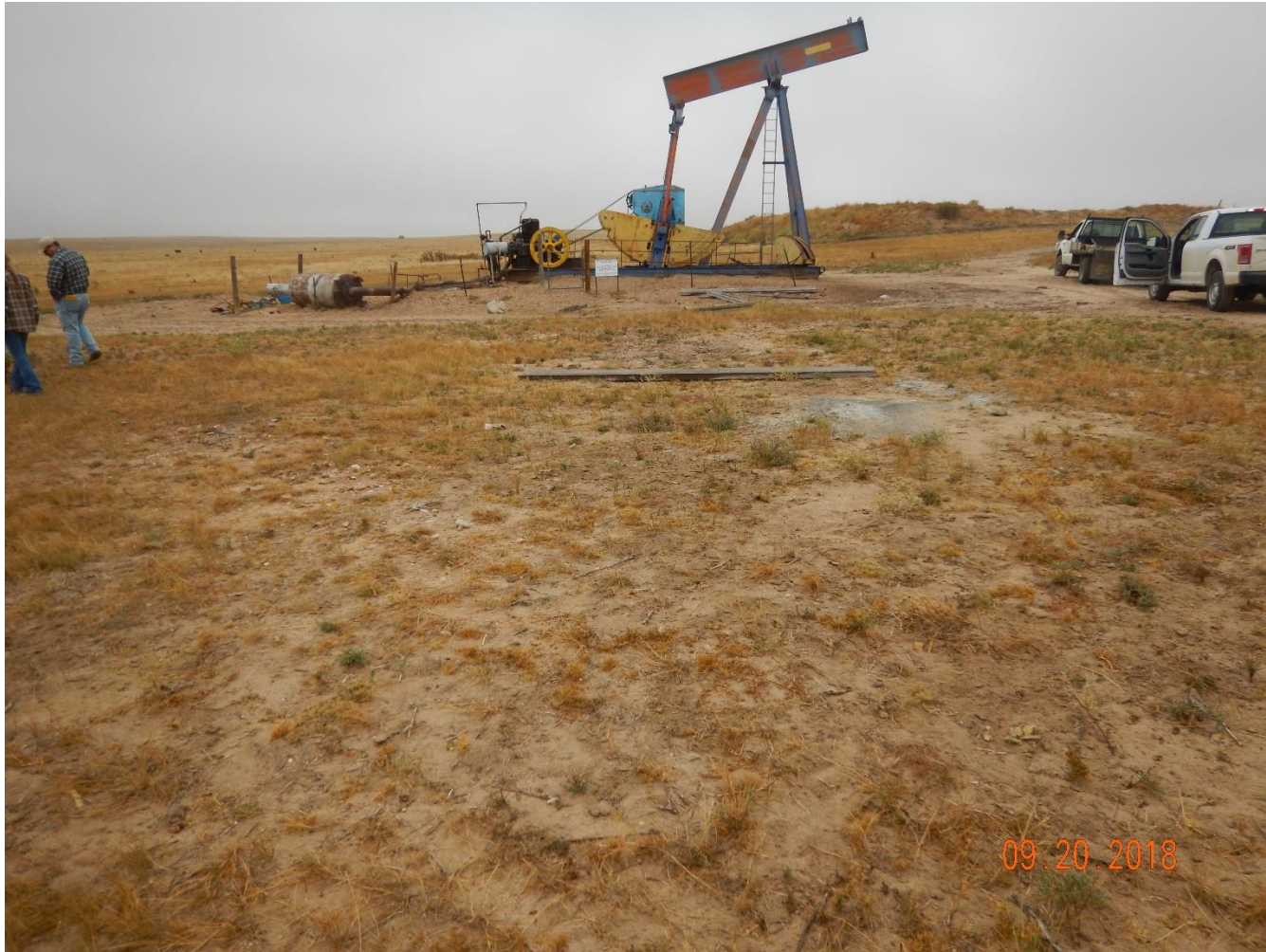
Photo 3: Photo taken from the south of the well location, facing north. Photo shows areas of disturbance off of the location that requires reclamation. Photo also shows various equipment and trash debris remain on site, and that no reclamation activities appear to have been conducted in accordance w/ 1004.a