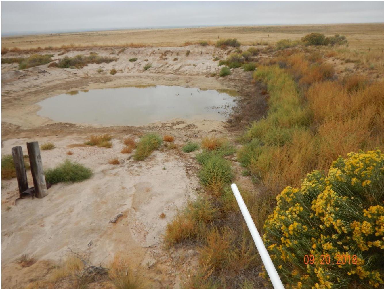
Photo 20: Photo taken from the northeast end of the pit, facing west. Photo shows overview of the pits. Pits remain open and have not been reclaimed. .