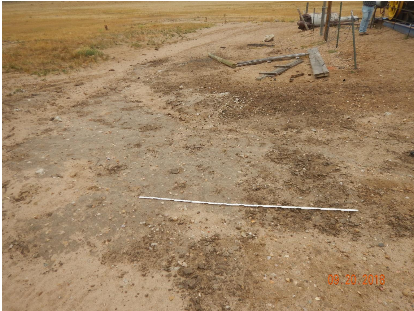
Photo 12: Photo taken from the south end of the well, facing west. See comments under photo 11.