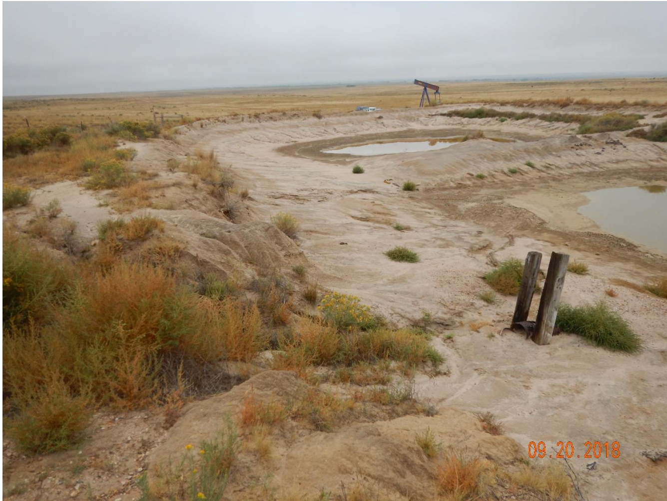
Photo 19: Photo taken from the northeast end of the pit, facing southwest. Photo shows overview of the pits. Pits remain open and have not been reclaimed.