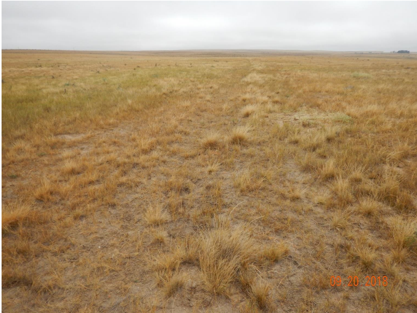
Photo 29: Photo taken from the east of the location. Photo shows area where a second access road to the location has been reclaimed.