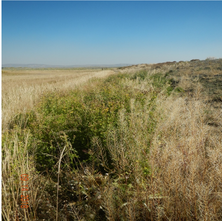
Photo#2: Noxious weed, Canada thistle is established on outside of West Berm.