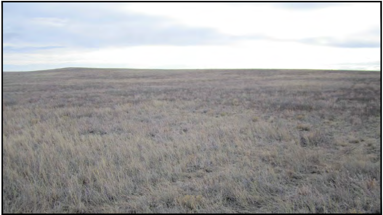
PHOTO: VIEW OF REFERENCE AREA