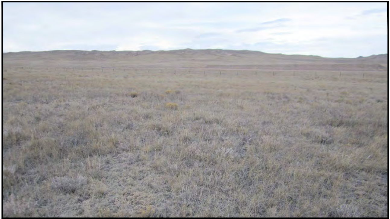
PHOTO: VIEW OF REFERENCE AREA