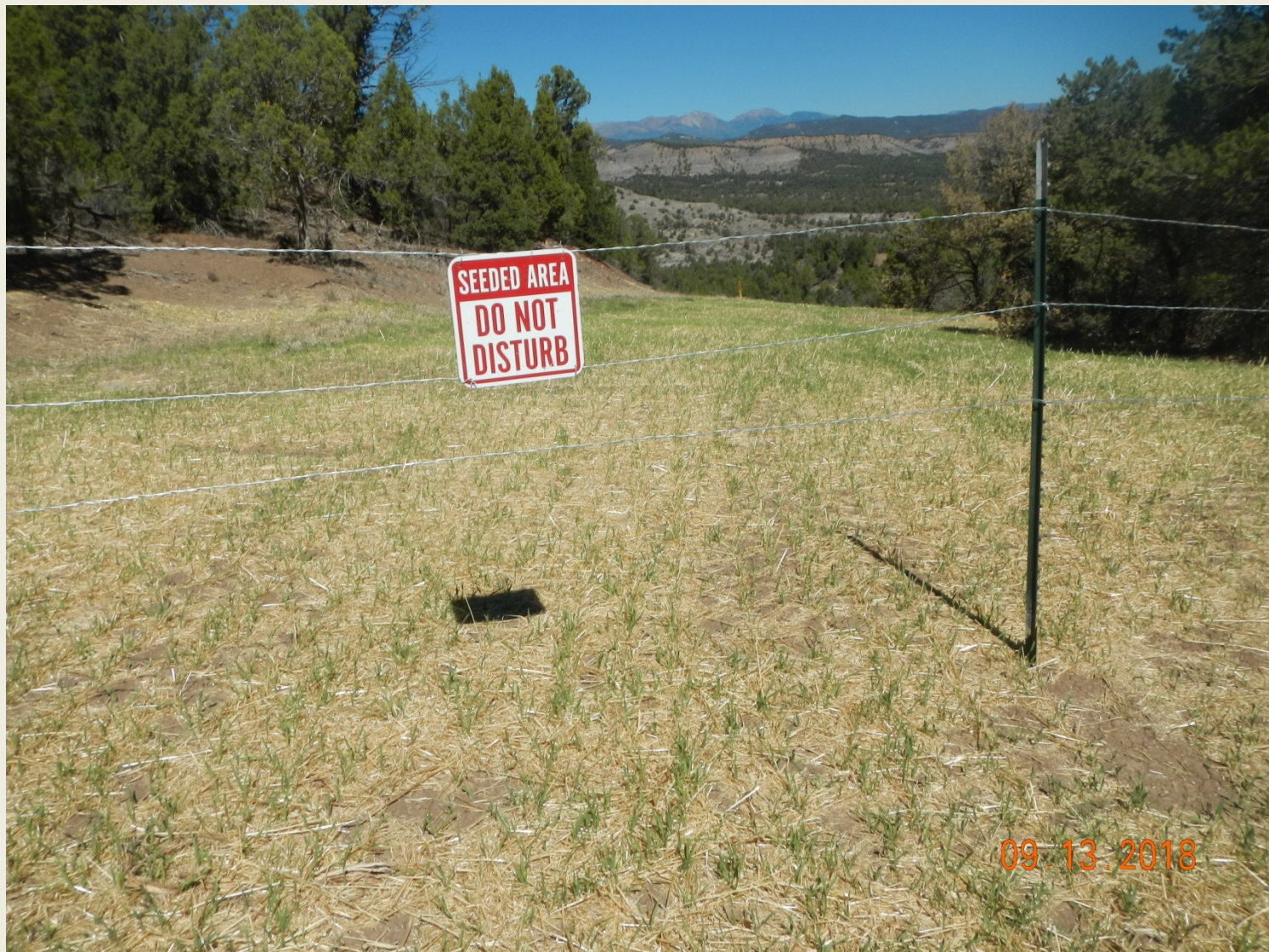
Photo 1. View of the reclaimed access road from the beginning of the road. Road closure is in accordance with final reclamation rules.