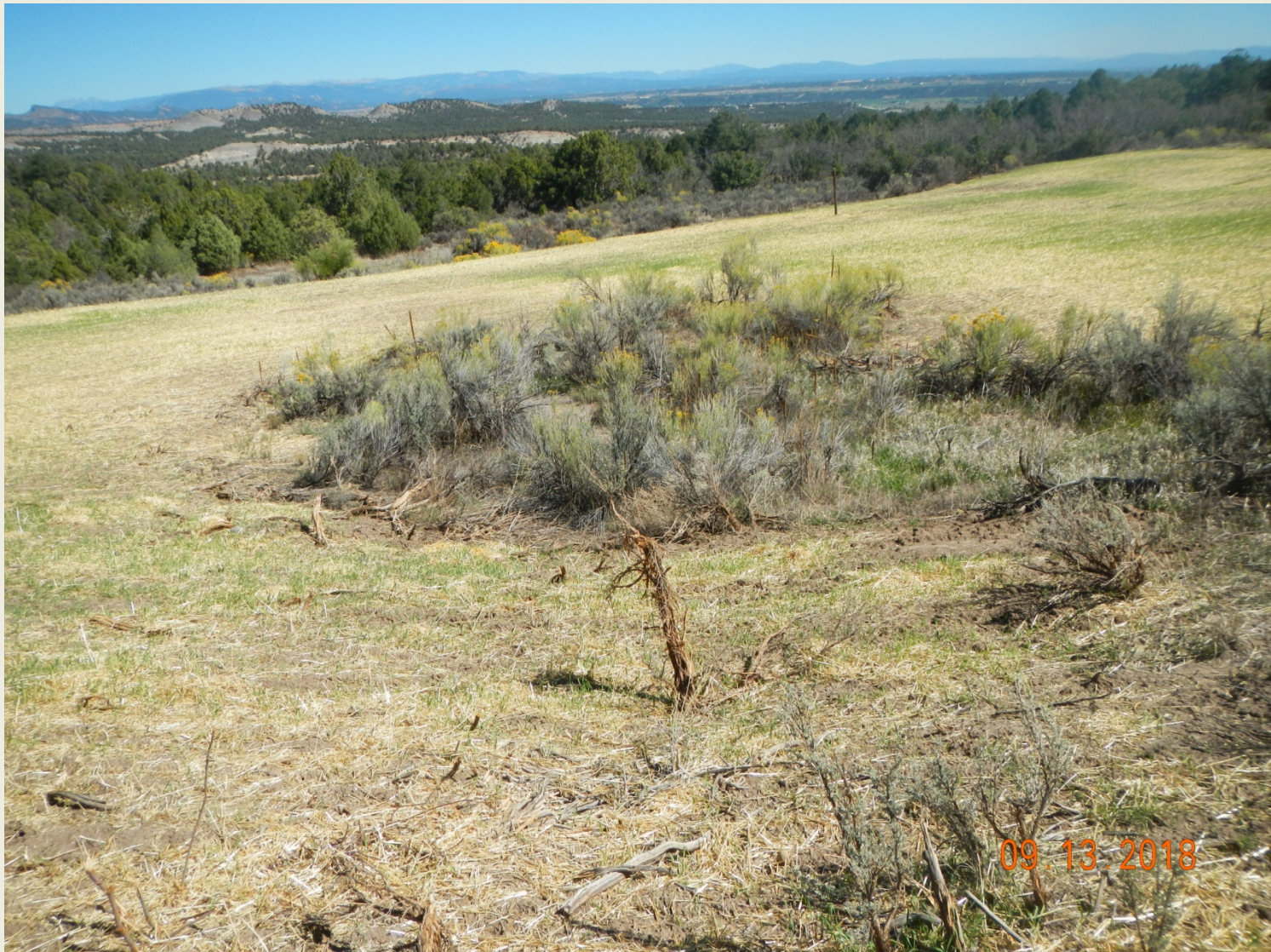
Photo 2. View of the eastern project area from the southwestern corner facing center. Well pad and access road are recontoured, straw mulched, and seeded with grasses. Species identification was not apparent at the time of the inspection.