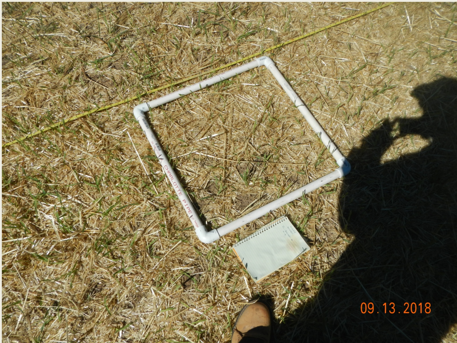
Photo 4. View of germination sampling “Quadrat 1”, along the access road.