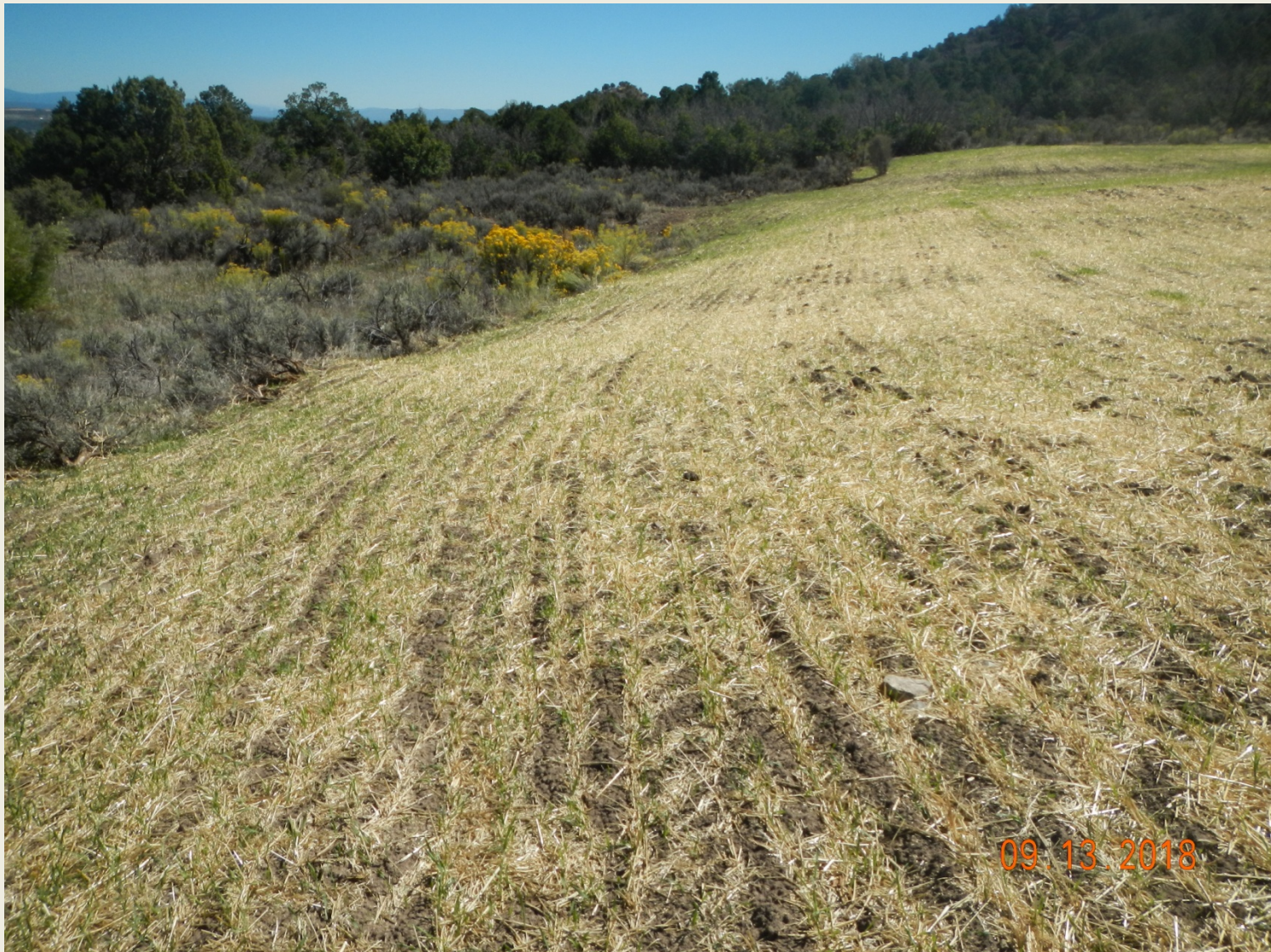
Photo 3. View of the northern project area from the northwestern edge facing eastward.