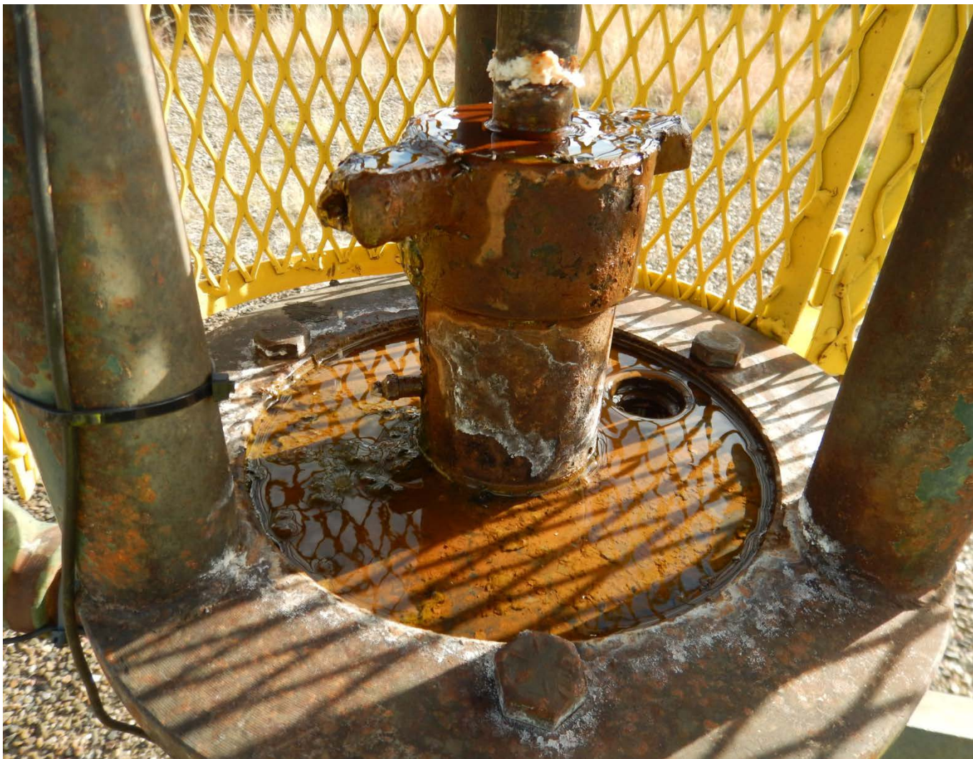
Small drip leak observed coming from wellhead.