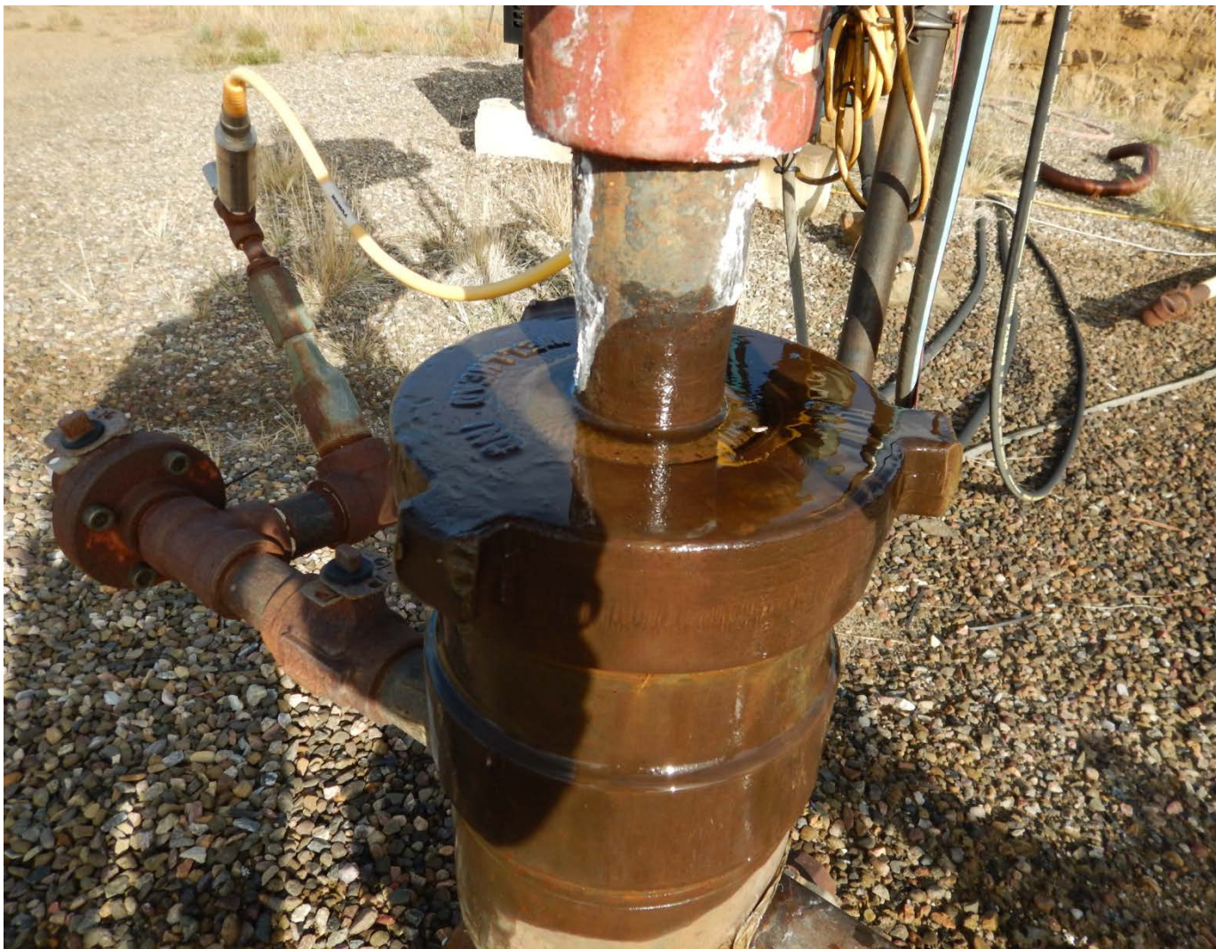
Small drip leak observed coming from wellhead.