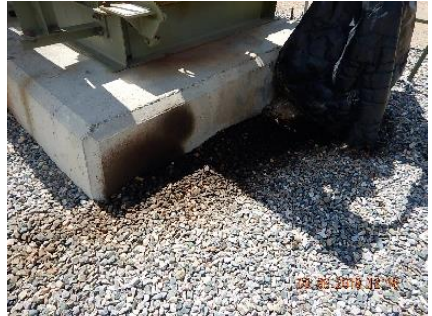
Photo 6: Impacted soil and gravel at rear of pump jack concrete base for Tiffany 2-3.