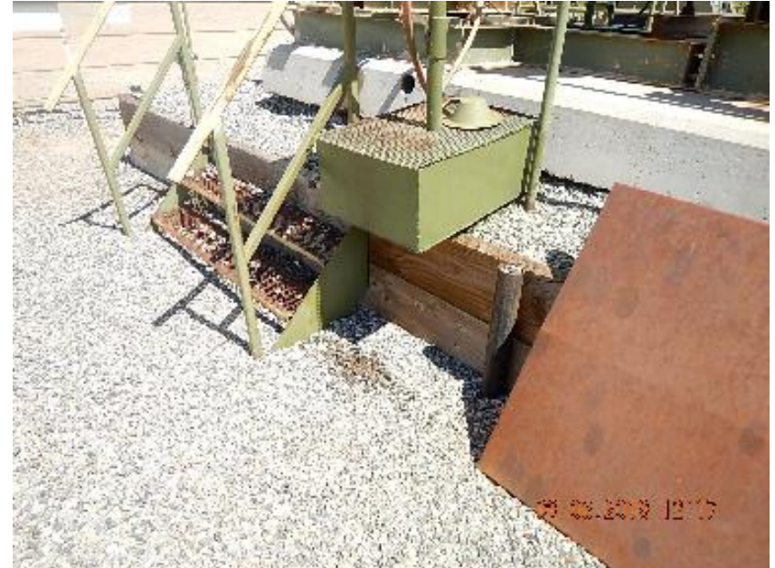
Photo 4: Impacted soil and gravel off front of C #1 lube oil tank.