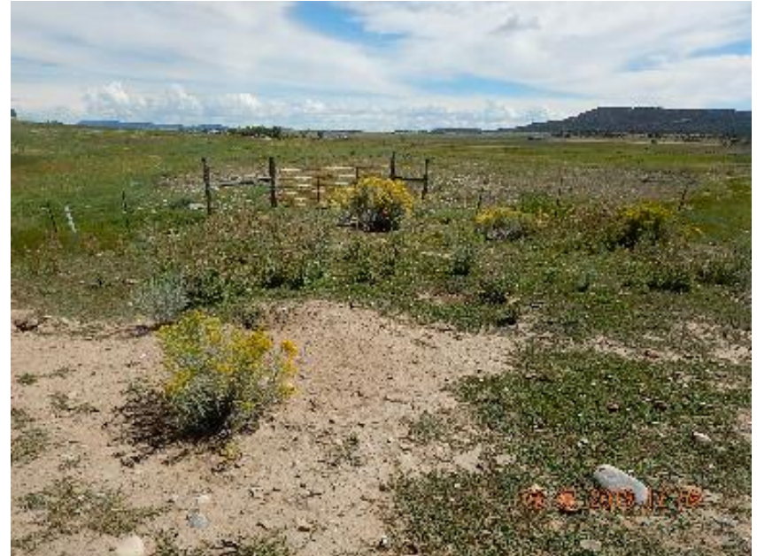
Photo 12: Additional view of Canadian Thistle in SE perimeter corner.