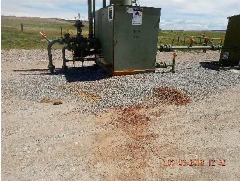
Photo 7: Impacted soil and gravel at front of Tiffany 2-3 separator.