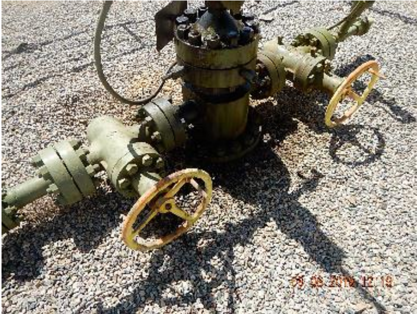
Photo 5: Impacted soil and gravel around base of Tiffany 2-3 wellhead.