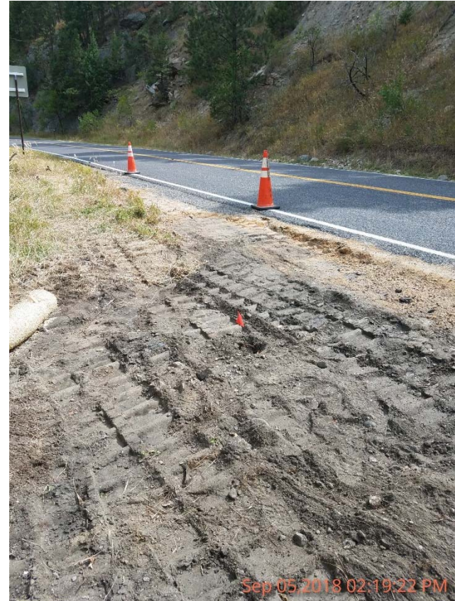
Photo 2 –Excavated spill area and termination of spill extent, looking southeast (down canyon).