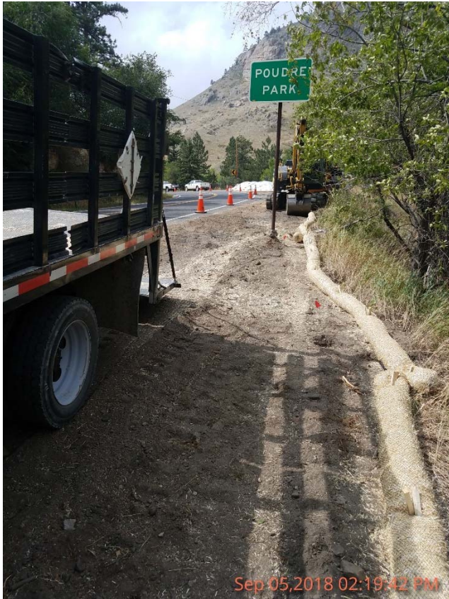
Photo 3 – Viewing excavated spill area, looking northwest (up canyon).