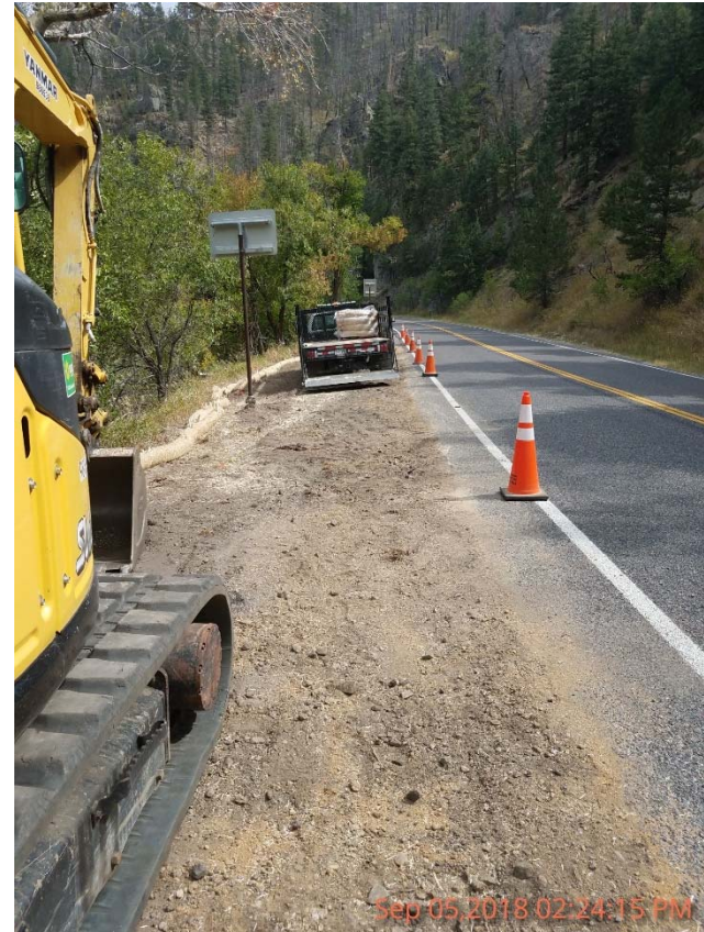
Photo 4 –From near crash and spill point of origin, looking southeast (down canyon).