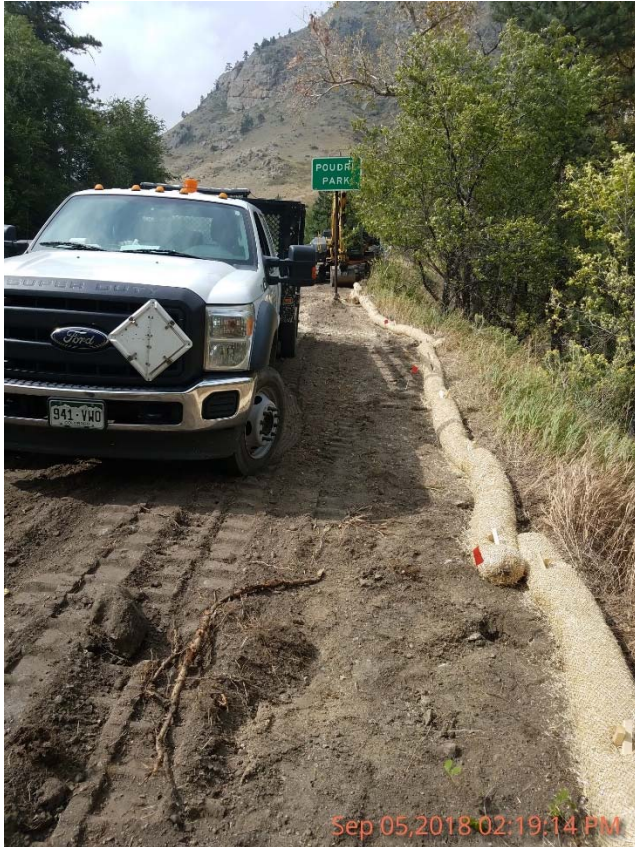
Photo 1 – Excavated spill area from downslope, eastern end of spill looking northwest (upcanyon).