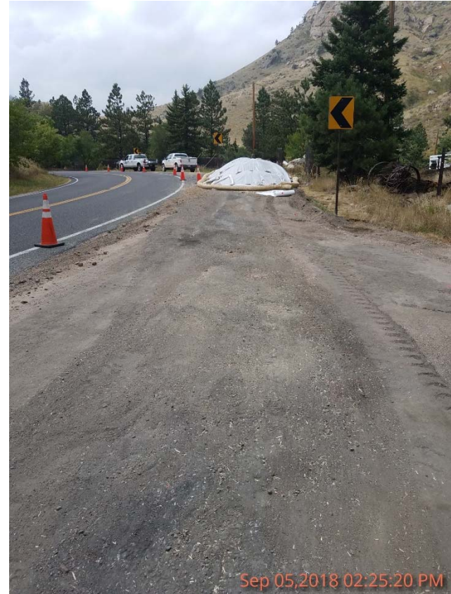
Photo 6 –Crash site and spill source area. Area scraped to existing asphalt surface.