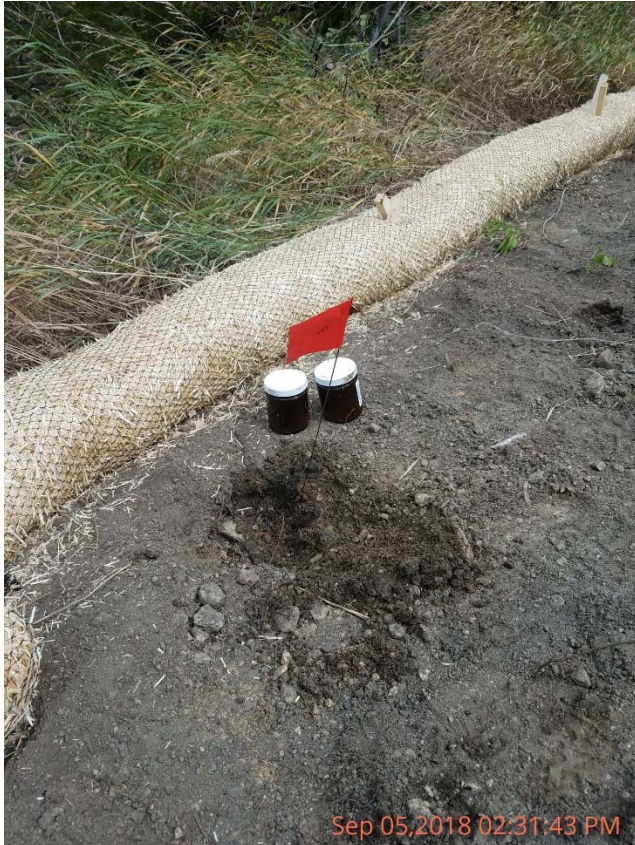
Photo 7 – Operator sample location 02 within excavated spill area. COGCC jars of sample collected adjacent Operator sample location.