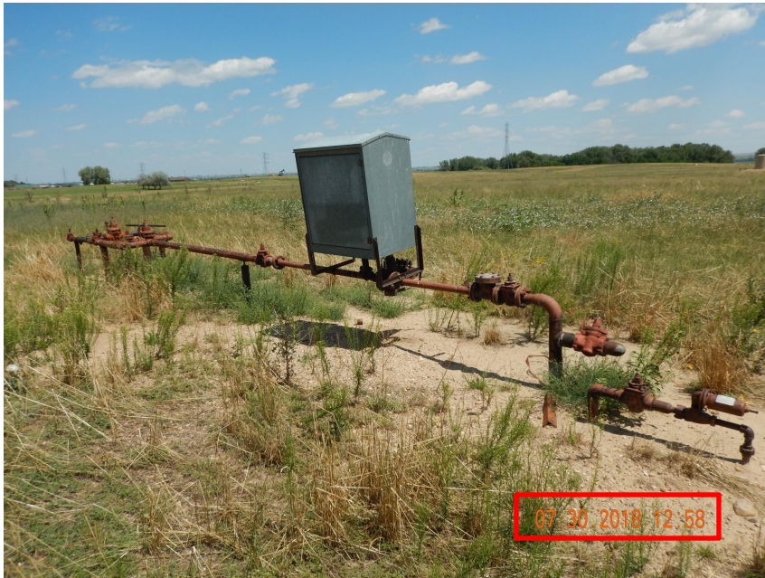
Photo 3. Photo taken from the eastern location on July 30, 2018, facing Northeast. Operator has failed to remove all equipment. It is the responsibility of the Operator to coordinate with the responsible parties to remove all equipment that was associated with oil and gas operations.