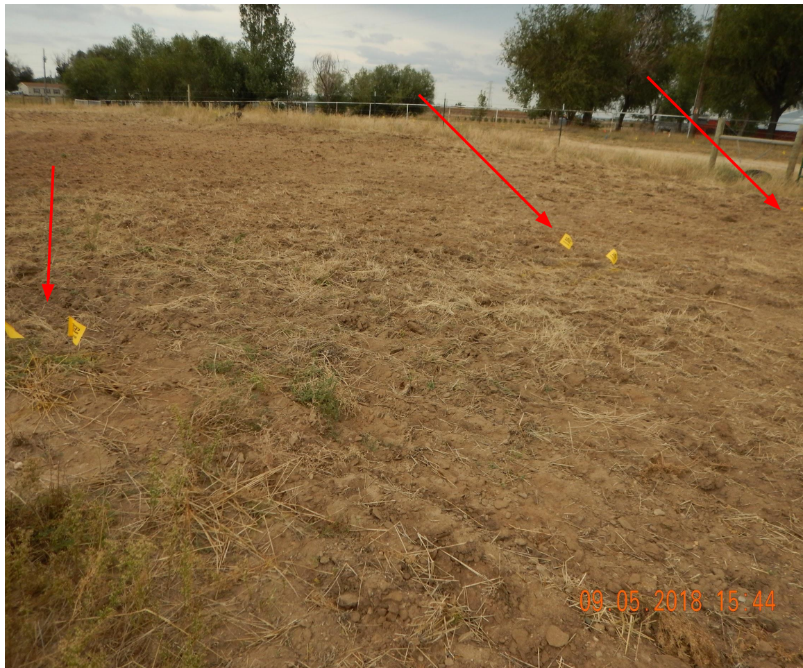
Photo 5. Photo taken from the eastern location on September 5, 2018, facing Southeast. Photo illustrates flagging from a recent "Locate". See comments under Photo 4.