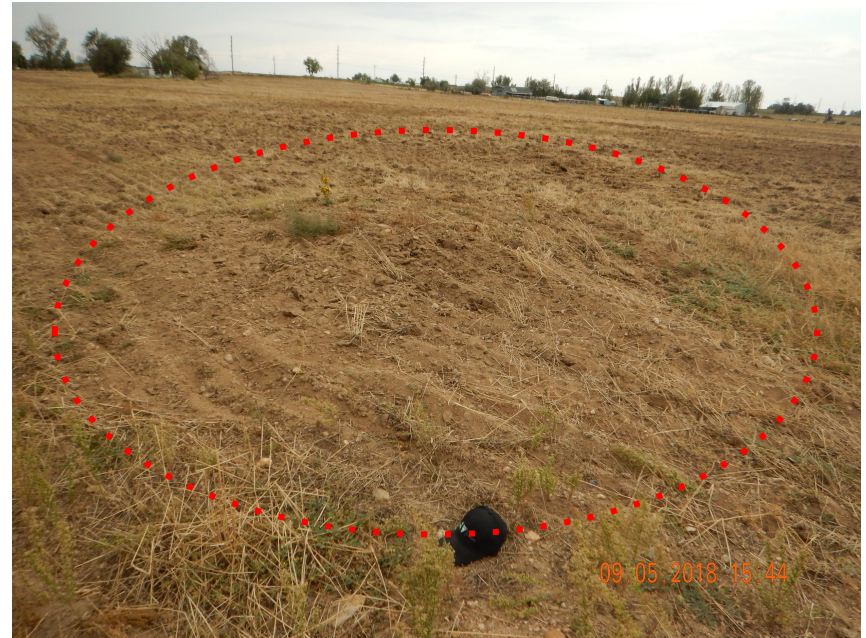
Photo 2. Photo taken from the western location on September 5, 2018, facing West. Surface owner has recently cultivated the ~30 acre parcel, including portions of this P&A location. This photo illustrates the Operator has failed to contour a portion of the location.