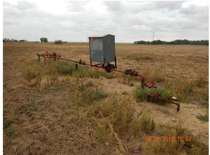
Photo 4. Photo taken from the eastern location on September 5, 2018, facing Northeast. Equipment remains at the P&A location. Equipment has been flagged and a recent "Locate" was performed. Unclear whether the "Locate" was conducted by the surface owner because of the recent cultivation or whether the Operator was responding to the corrective action.