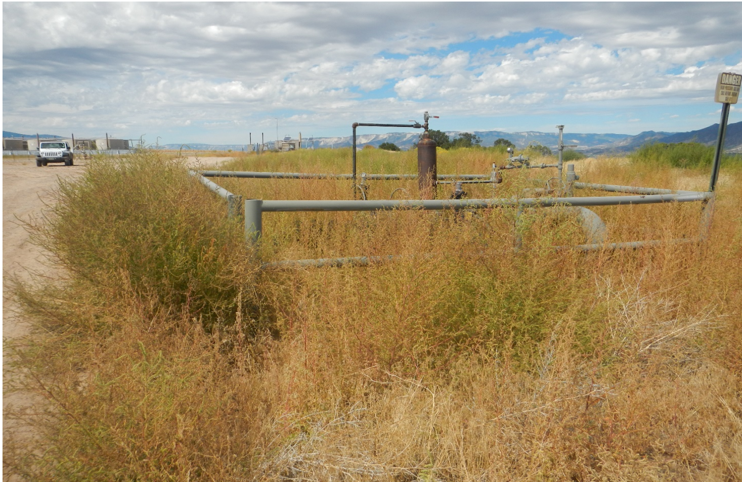
Photo#2: View of area to North of entry where Weed (kochia) infestation is severe.