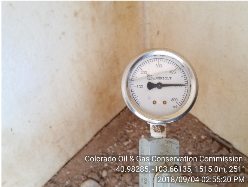
Colorado Oil & Gas Conservation Commission 40.98285, -103.66135, 1515.0m, 251° 2018/09/04 02:55:20 PM