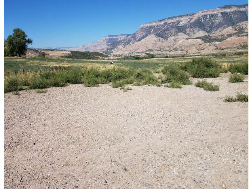
Location Photo #6, weeds on location.