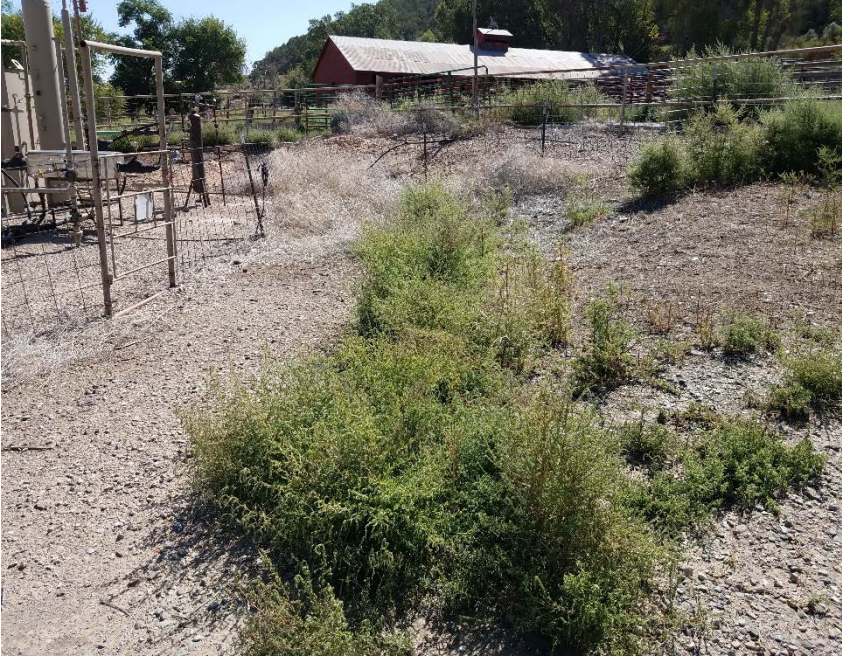
Location Photo #5, weeds on location