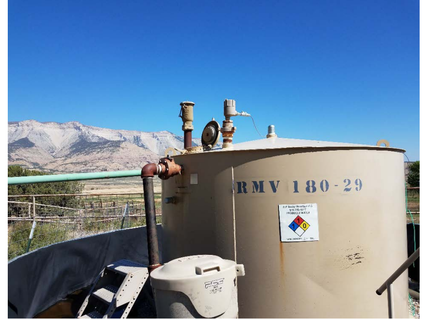
Location Photo #8, open gauge hatch