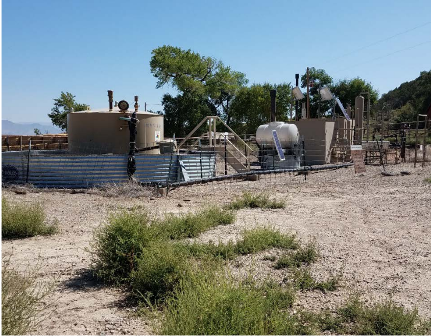
Location Photo #1