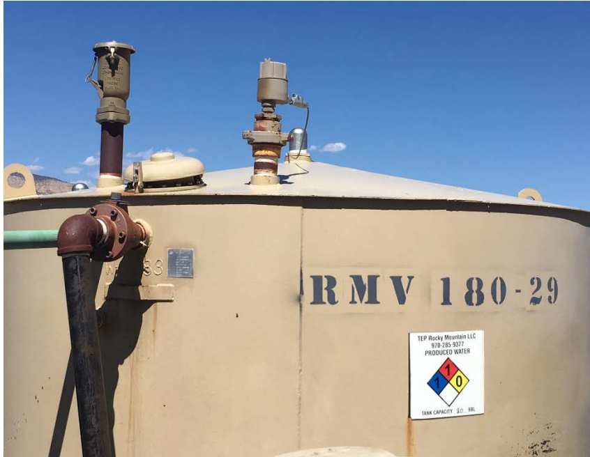
Location Photo #9, operator closed gauge hatch.