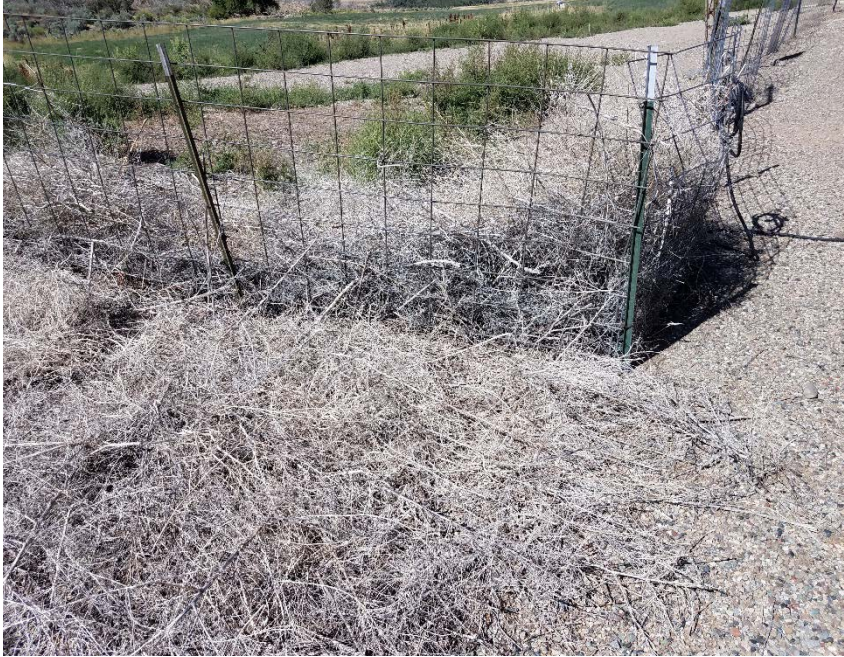
Location Photo #7, debris against fence.