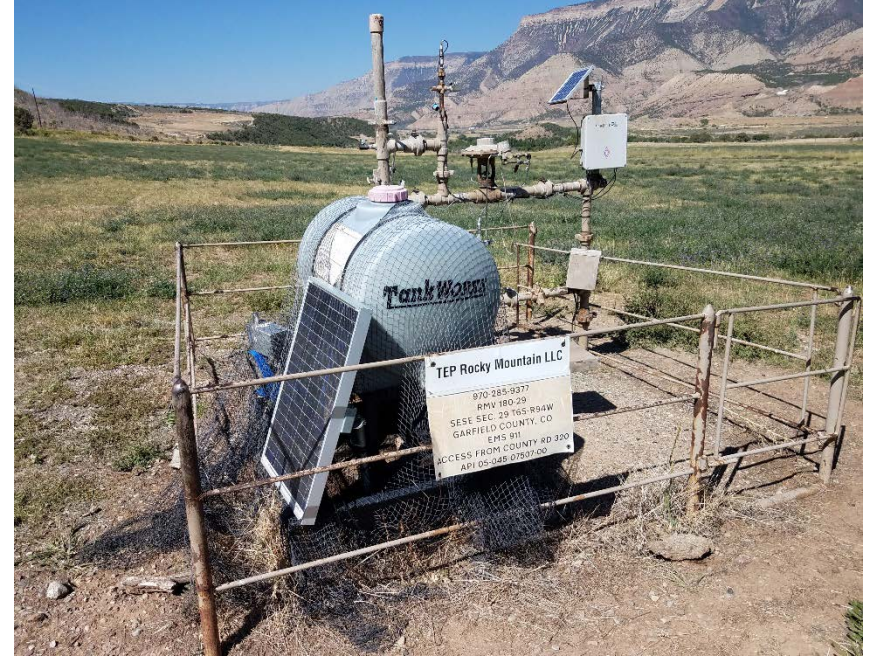
Location Photo #2