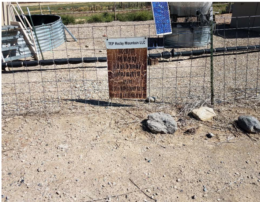
Location Photo #3, non legible battery sign.