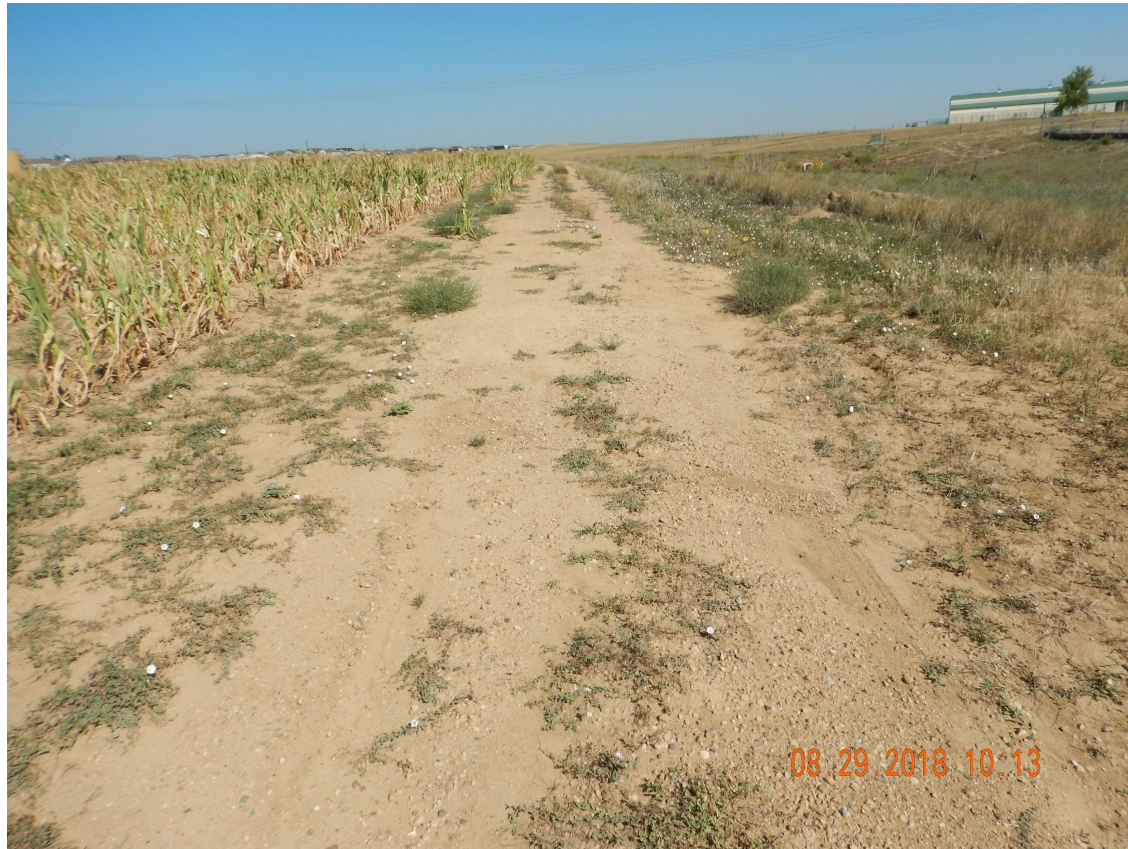
Photo 3. Photo taken along a portion of the access road, facing North. See comments under Photo 2.