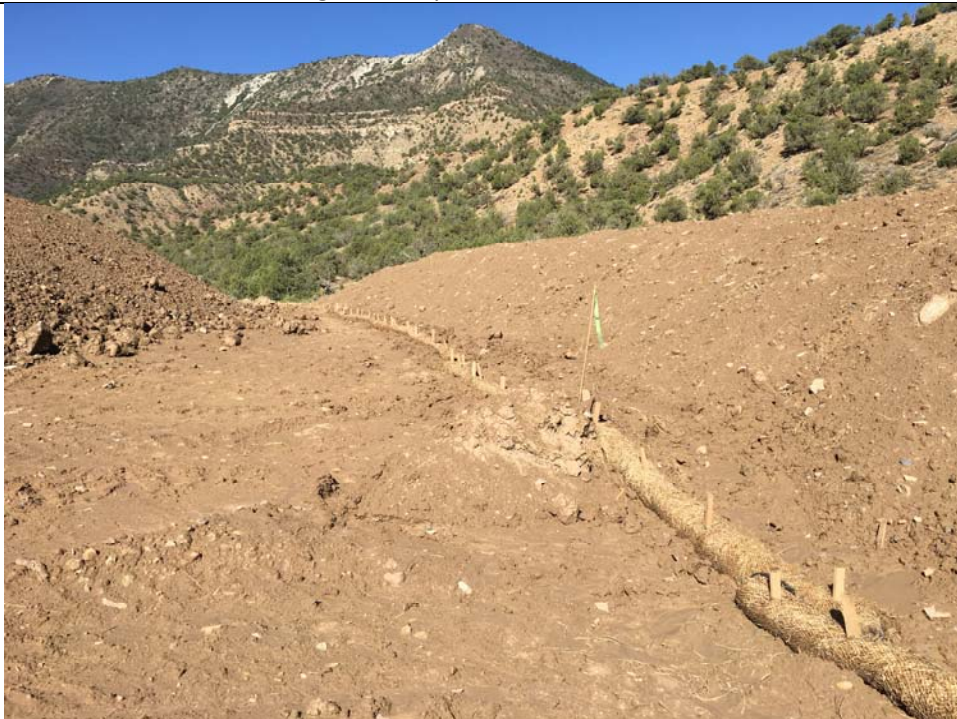
Photograph 3: Wattles installed around entire perimeter of topsoil stockpile.