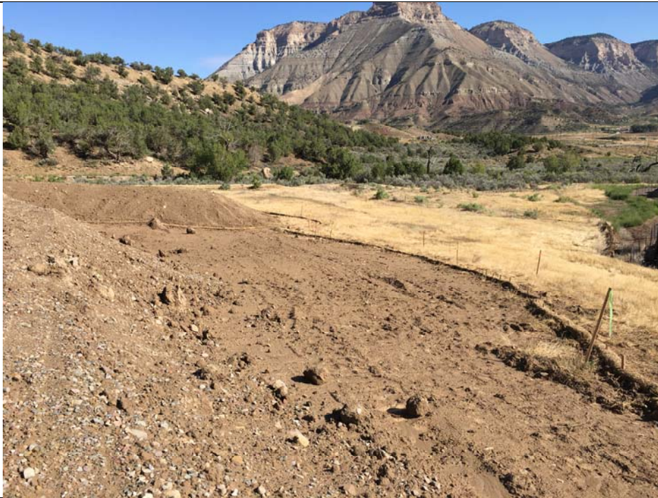
Photograph 2: Wattles installed along eastern perimeter of new disturbance.