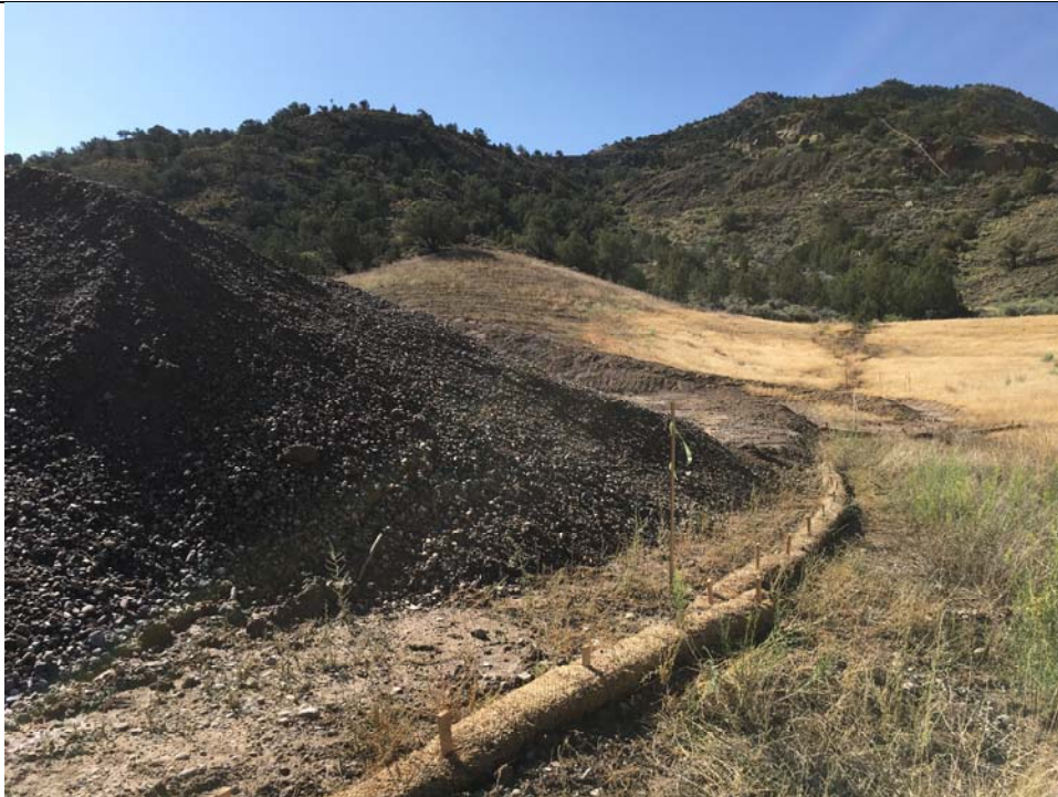
Photograph 4: Wattles installed around the western perimeter of the gravel stockpile.