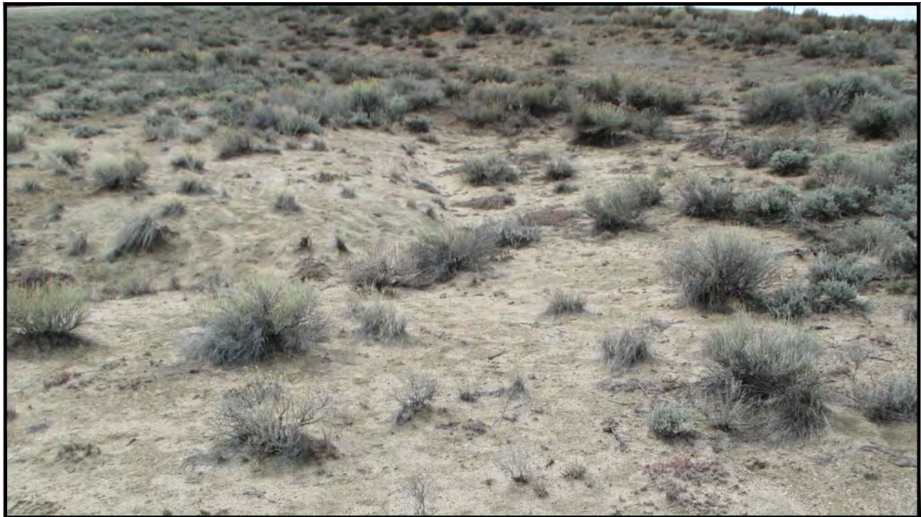
PHOTO: VIEW OF REFERENCE AREA LOCATED IN THE SE 1/4 SW 1/4 OF SECTION 29