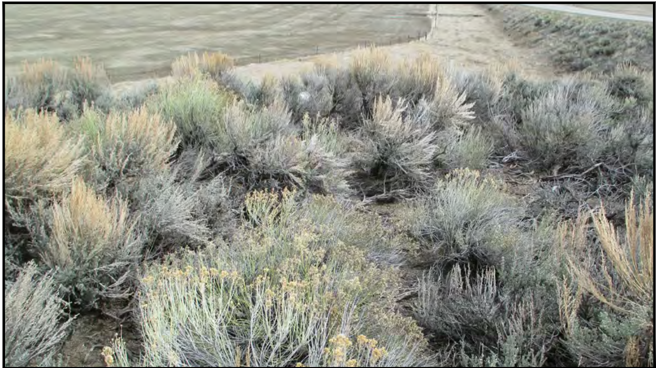
PHOTO: VIEW OF REFERENCE AREA LOCATED IN THE SE 1/4 SW 1/4 OF SECTION 29