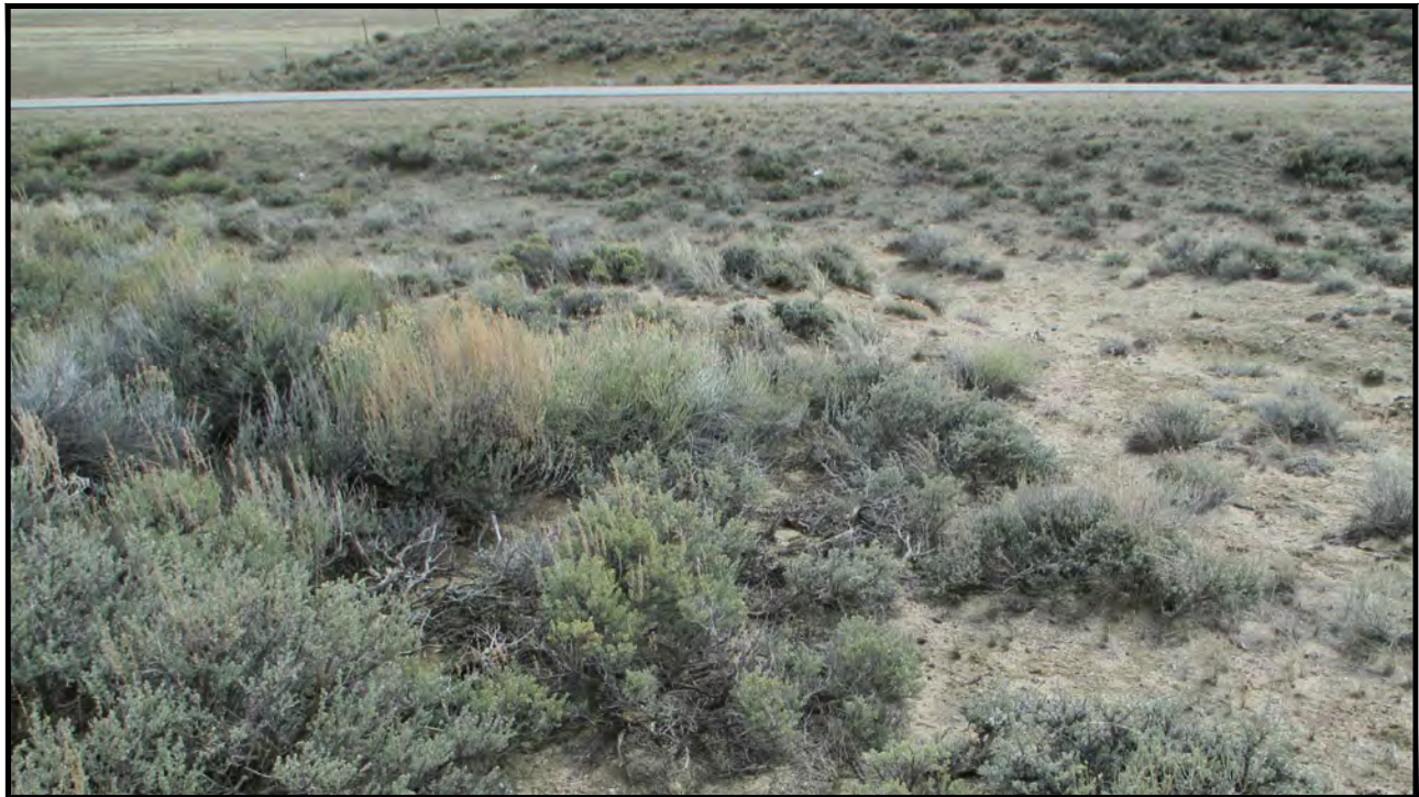
PHOTO: VIEW OF REFERENCE AREA LOCATED IN THE SE 1/4 SW 1/4 OF SECTION 29