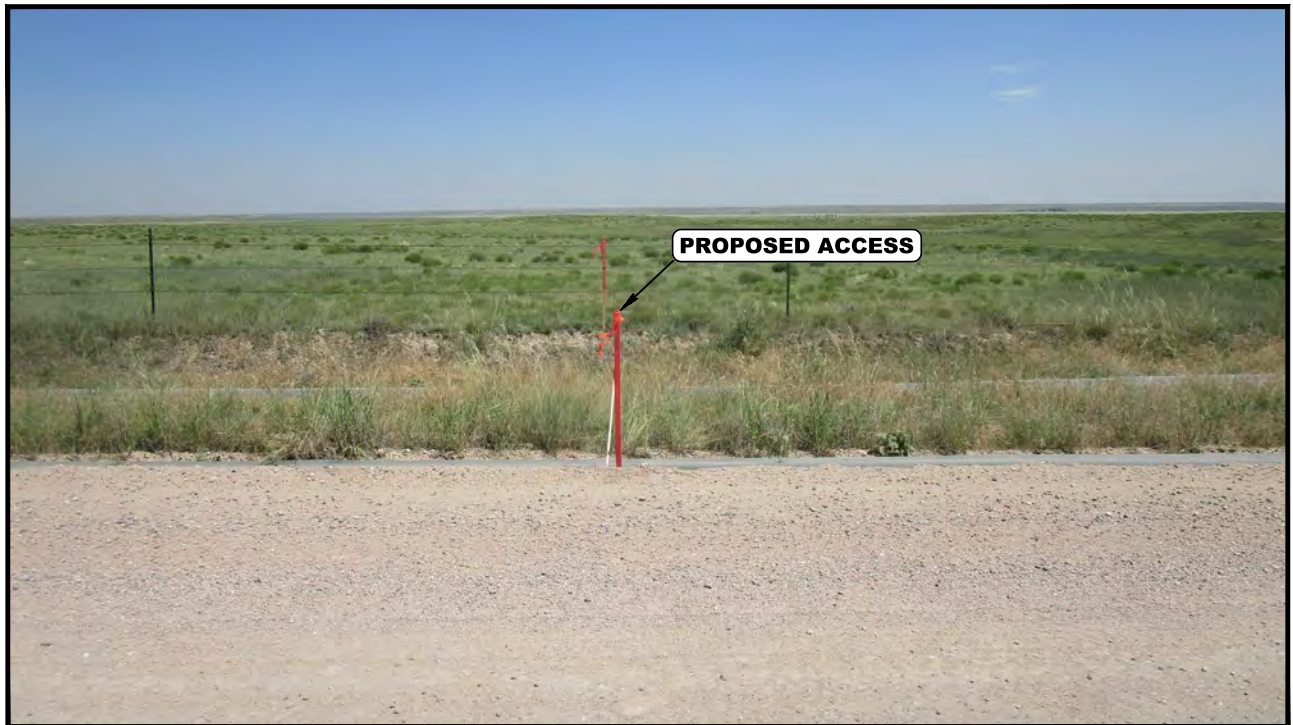
PHOTO: VIEW FROM BEGINNING OF EASTERLY PROPOSED ACCESS