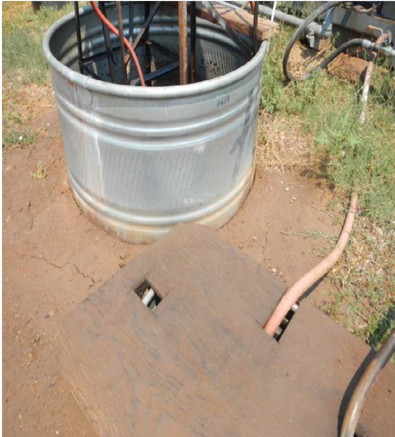
Photo#16: Staining and impacted soil were observed around multiple pieces of equipment.