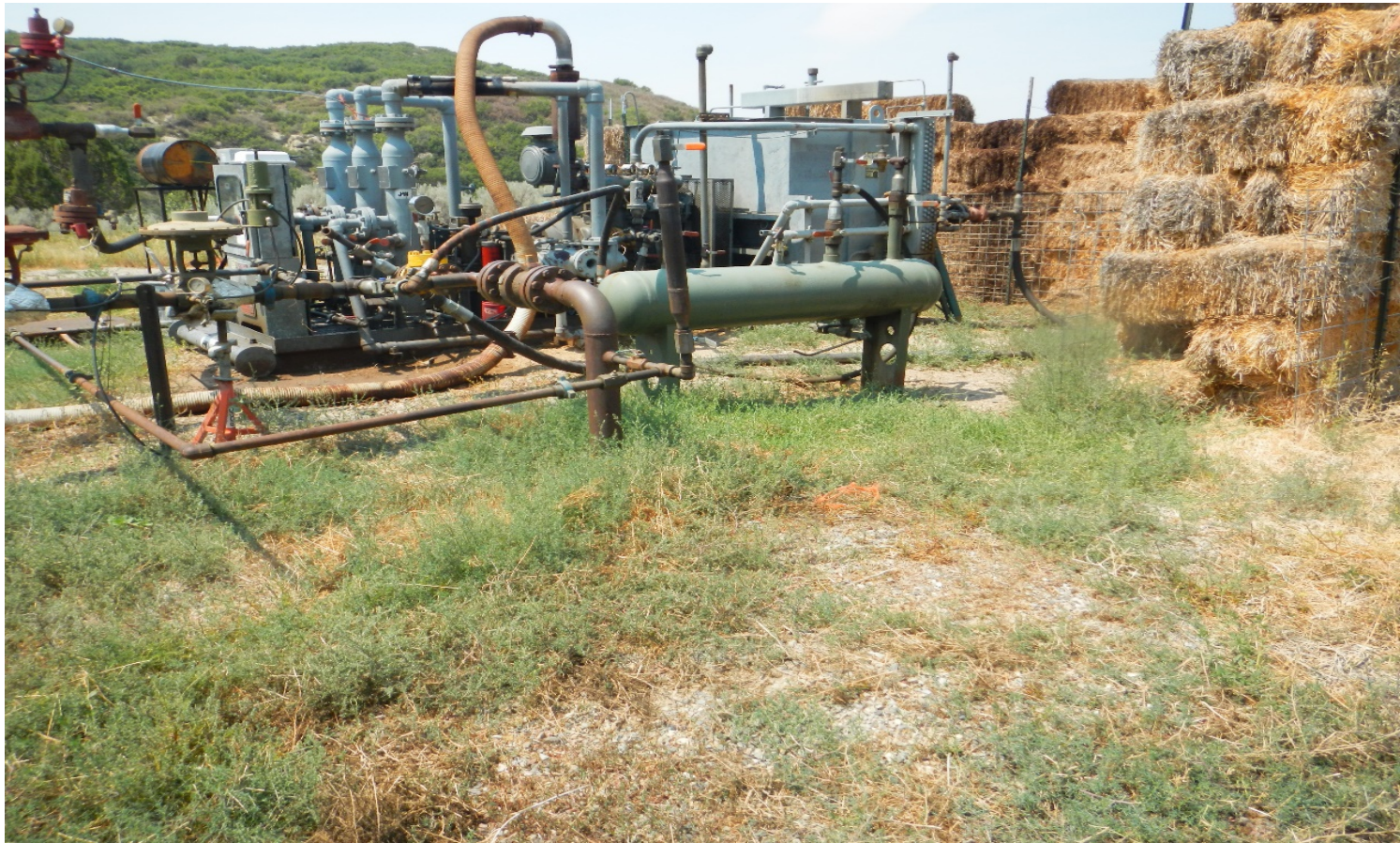
Photo#5: View of Compressor & Sound Wall; note weeds growing in and around equipment.