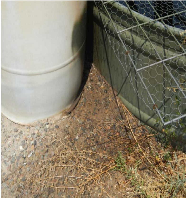
Photo#14: Staining and impacted soil were observed around multiple pieces of equipment.