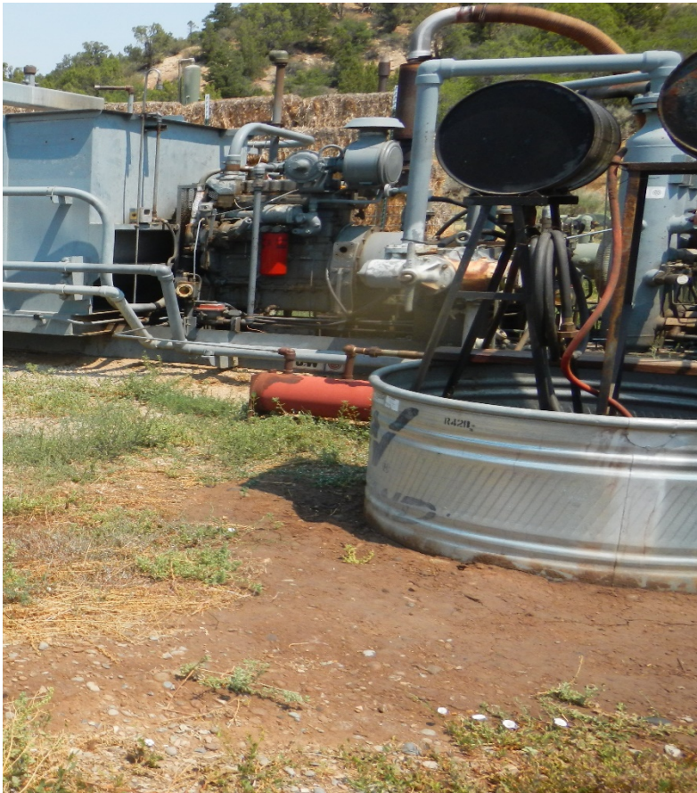
Photo#18: Staining and impacted soil were observed around multiple pieces of equipment.