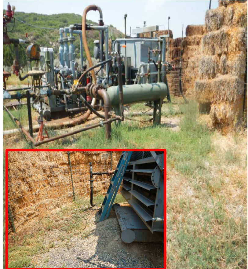
Photo#7: View of Sound Wall from South end. Insert is of back side of compressor & Sound Wall.