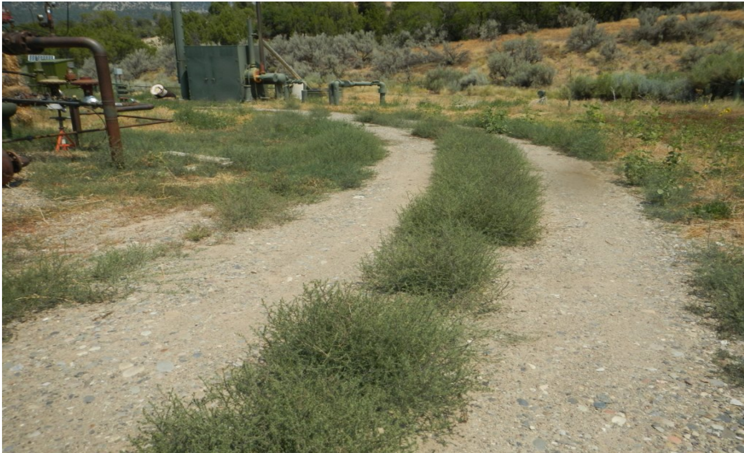
Photo#2: Russian thistle on road, in interim Reclamation & equipment areas.