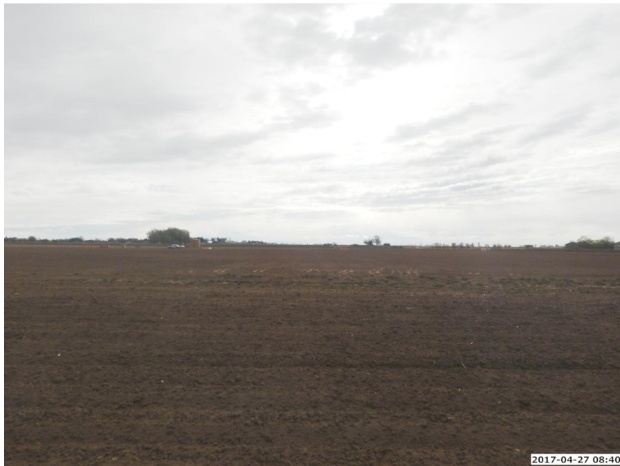
PICTURE OF CHALK-SEELEY FEDERAL 7-26 PAD FACILITY PAD LOCATION - CAMERA ANGLE EAST

K:\SYNERGY RESOURCES\2017_41_CHALK_T6N_R66W_SEC_26\PHOTOS\CHALK PHOTOS.dwg, 9/28/2017 3:34:17 PM, seven