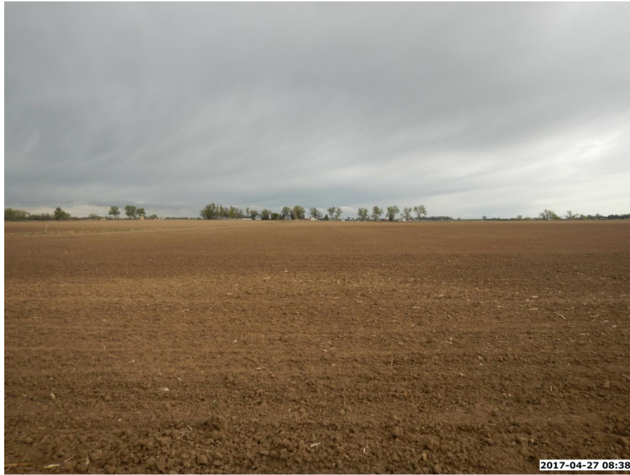
PICTURE OF CHALK-SEELEY FEDERAL 7-26 PAD FACILITY PAD LOCATION - CAMERA ANGLE NORTH