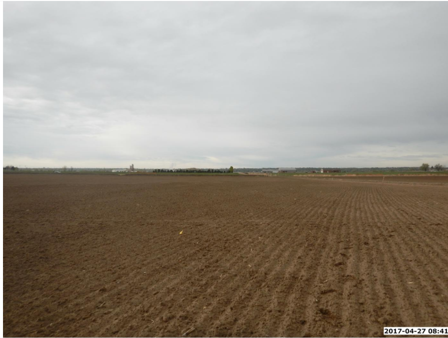
PICTURE OF CHALK-SEELEY FEDERAL 7-26 PAD FACILITY PAD LOCATION - CAMERA ANGLE SOUTH