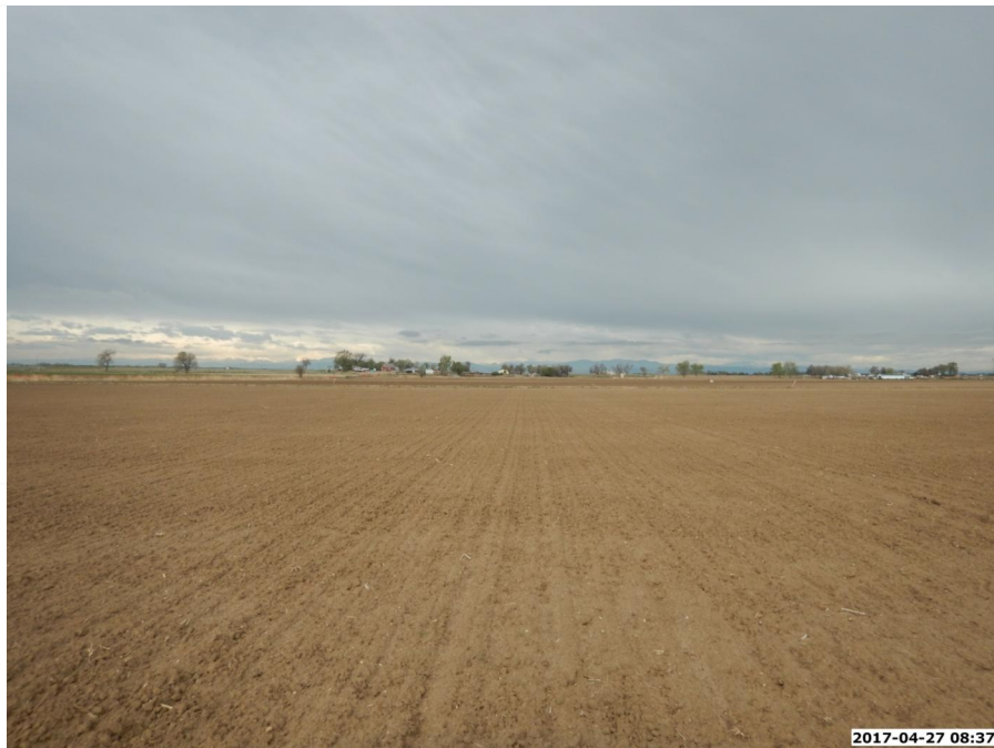
PICTURE OF CHALK-SEELEY FEDERAL 7-26 PAD FACILITY PAD LOCATION - CAMERA ANGLE WEST

FACILITY PAD LOCATION PICTURES LOCATED IN SECTION 26 T6N, R66W, 6TH P.M. WELD COUNTY, COLORADO