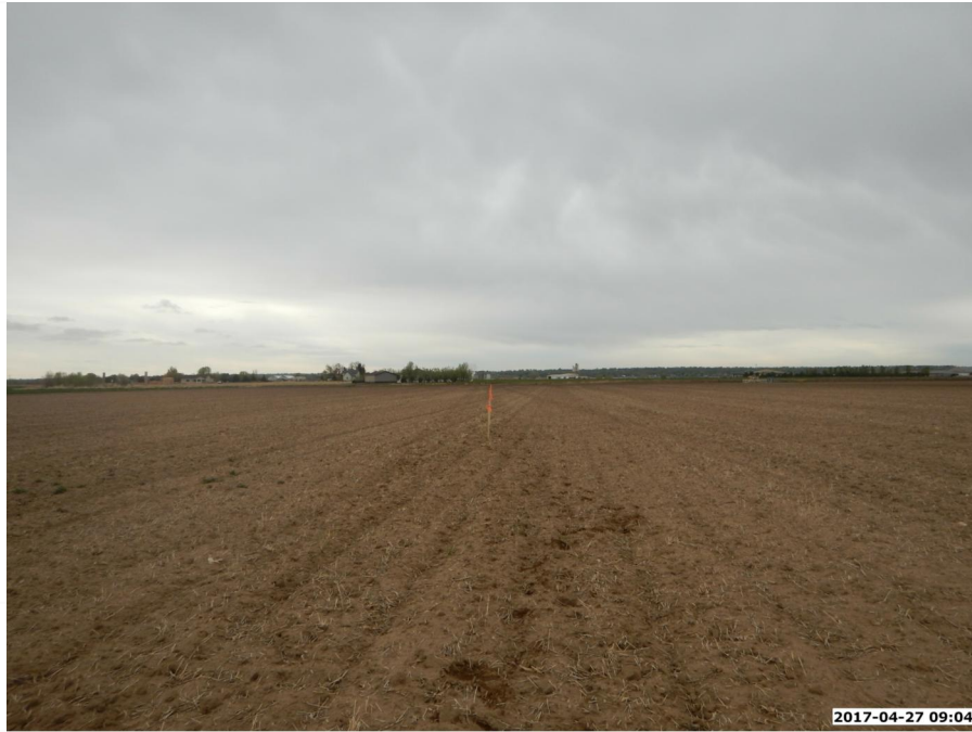
PICTURE OF CHALK-SEELEY FEDERAL 7-26 PAD (SEELEY FEDERAL WELLS) WELL PAD LOCATION - CAMERA ANGLE NORTH