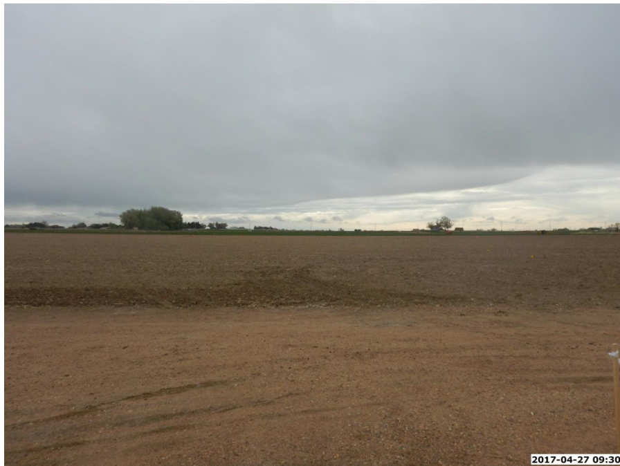
PICTURE OF CHALK-SEELEY FEDERAL 7-26 PAD (SEELEY FEDERAL WELLS) WELL PAD LOCATION - CAMERA ANGLE EAST