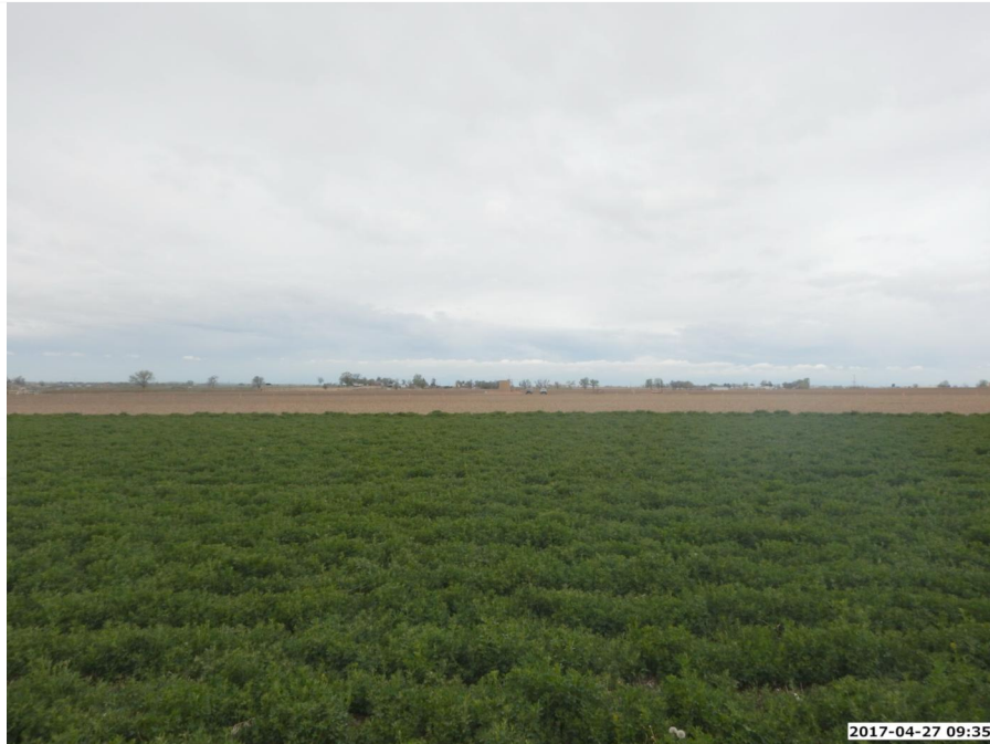
PICTURE OF CHALK-SEELEY FEDERAL 7-26 PAD (SEELEY FEDERAL WELLS) WELL PAD LOCATION - CAMERA ANGLE WEST