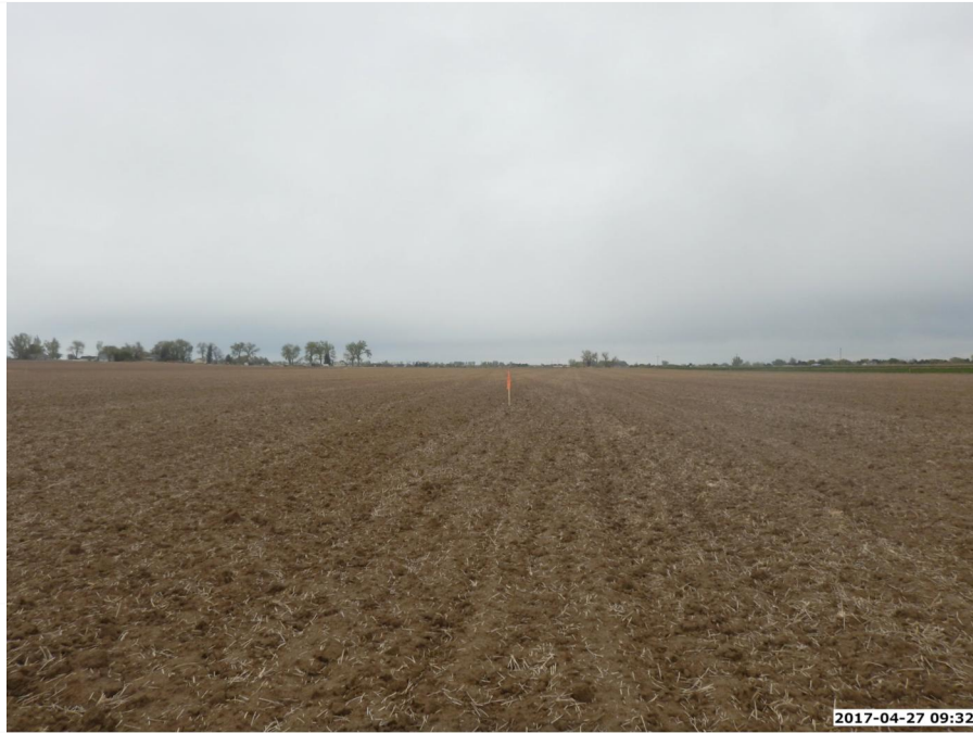
PICTURE OF CHALK-SEELEY FEDERAL 7-26 PAD (SEELEY FEDERAL WELLS) WELL PAD LOCATION - CAMERA ANGLE SOUTH