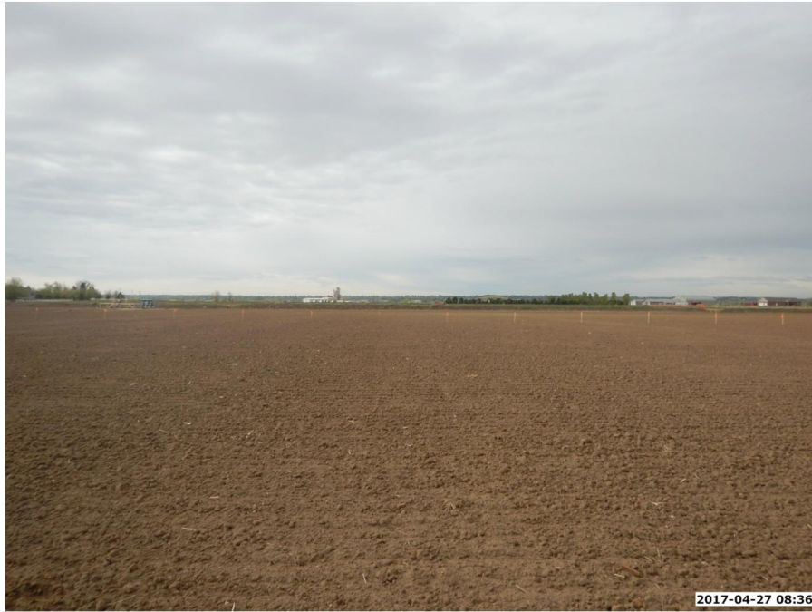
PICTURE OF CHALK-SEELEY FEDERAL 7-26 PAD (CHALK WELLS) WELL PAD LOCATION - CAMERA ANGLE SOUTH