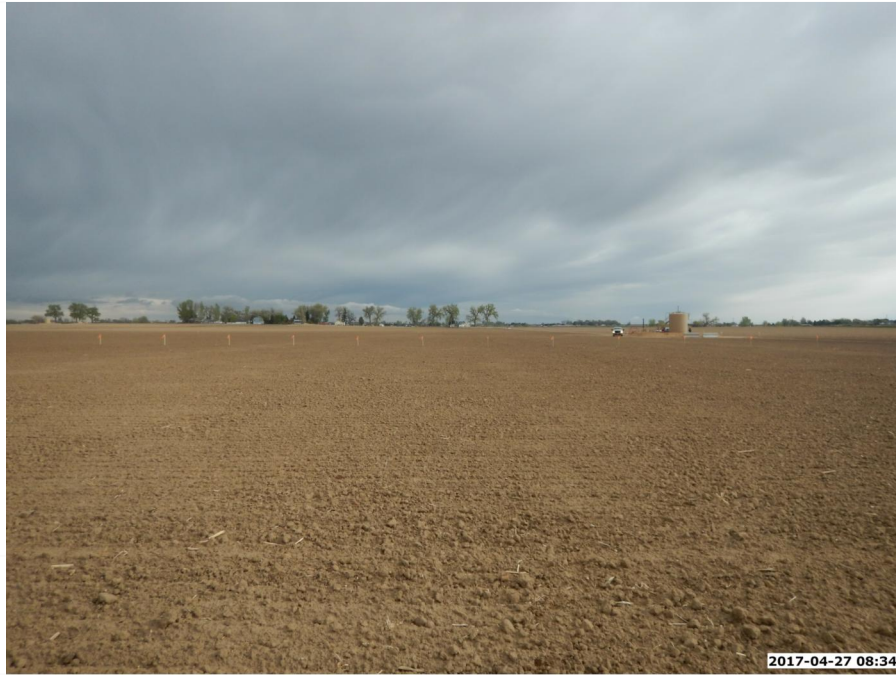
PICTURE OF CHALK-SEELEY FEDERAL 7-26 PAD (CHALK WELLS) WELL PAD LOCATION - CAMERA ANGLE NORTH