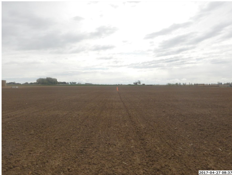
PICTURE OF CHALK-SEELEY FEDERAL 7-26 PAD (CHALK WELLS) WELL PAD LOCATION - CAMERA ANGLE EAST

CHALK 36N-2C-XR, CHALK 36C-2-XR, CHALK 15N-2B-XR, CHALK 15C-2-XR, CHALK 37N-2C-XR, CHALK 37N-2A-XR, CHALK 20C-35-M, CHALK 20N-35B-M, CHALK 9N-35C-M, CHALK 9C-35-M, CHALK 39N-35A-M & CHALK 39N-35C-M LOCATED IN SECTION 26, T6N, R66W, 6TH P.M. WELD COUNTY, COLORADO