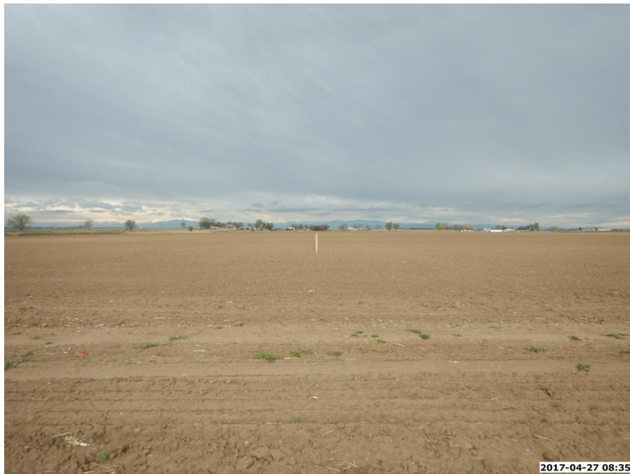
PICTURE OF CHALK-SEELEY FEDERAL 7-26 PAD (CHALK WELLS) WELL PAD LOCATION - CAMERA ANGLE WEST

CHALK 36N-2C-XR, CHALK 36C-2-XR, CHALK 15N-2B-XR, CHALK 15C-2-XR, CHALK 37N-2C-XR, CHALK 37N-2A-XR, CHALK 20C-35-M, CHALK 20N-35B-M, CHALK 9N-35C-M, CHALK 9C-35-M, CHALK 39N-35A-M & CHALK 39N-35C-M LOCATED IN SECTION 26, T6N, R66W, 6TH P.M. WELD COUNTY, COLORADO