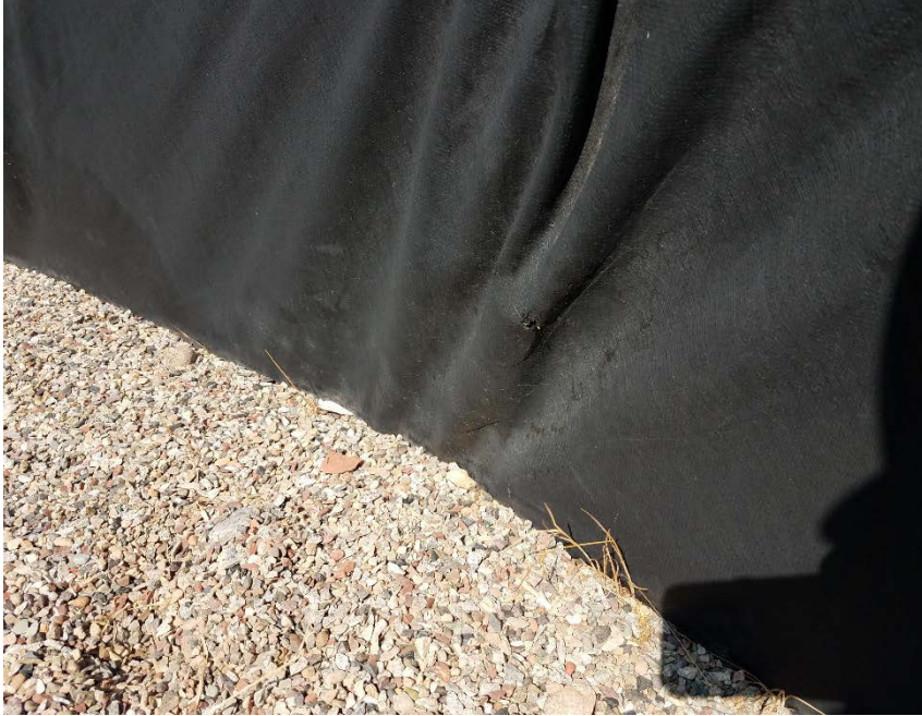
Location Photo #7, Holes in secondary containment.