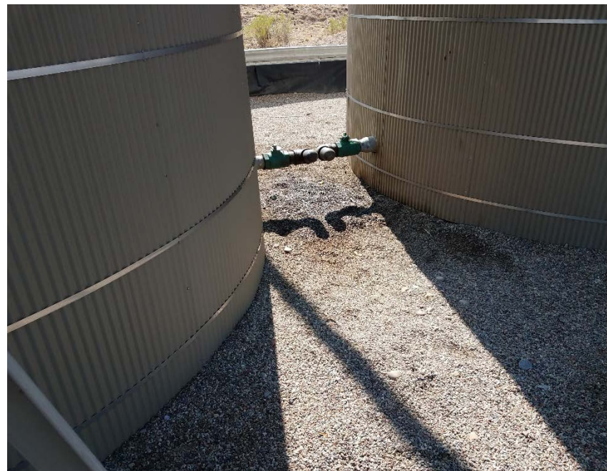
Location Photo #4, Stained rock in tank containment.