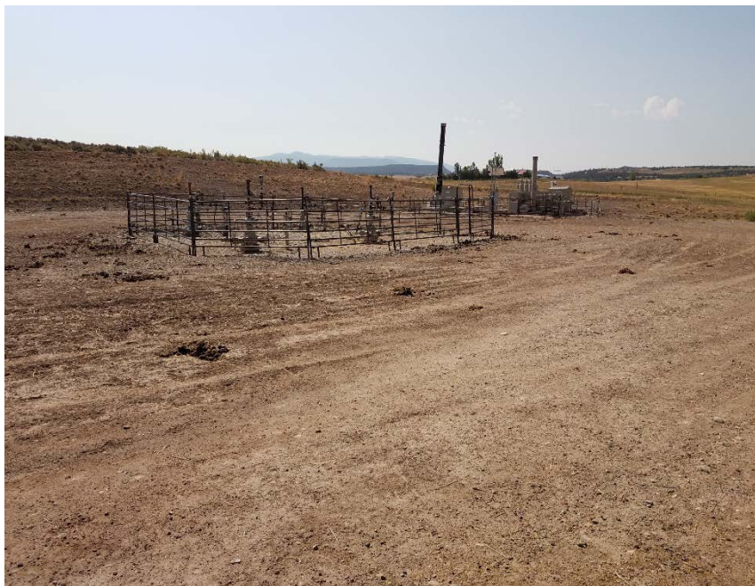
Location Photo #1