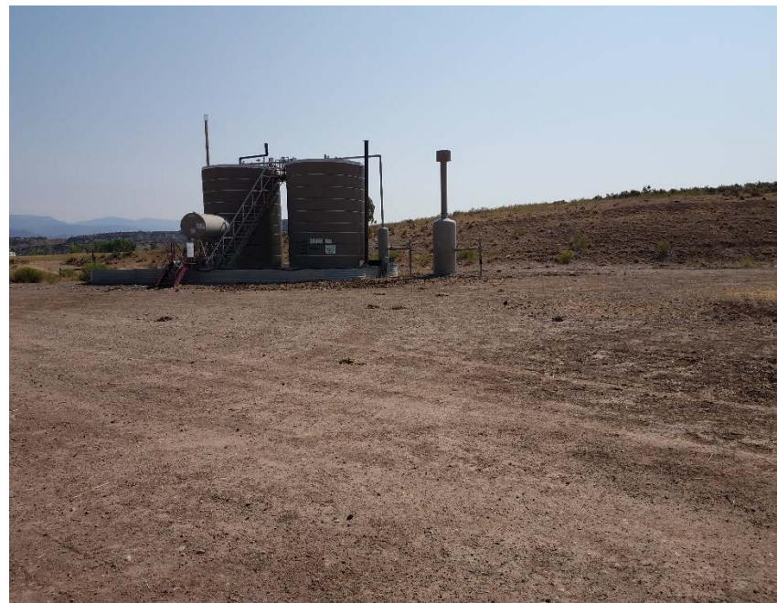
Location Photo #2,