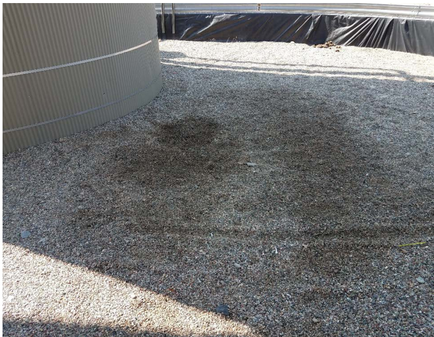
Location Photo #3, Stained rock in tank containment.