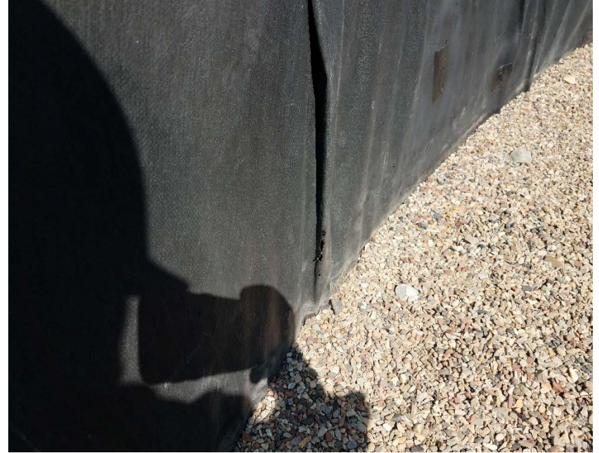
Location Photo #8, Holes in secondary containment.