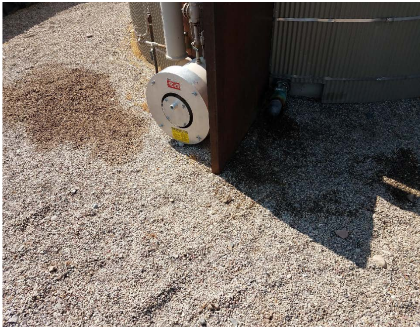
Location Photo #5, Stained rock in tank containment.