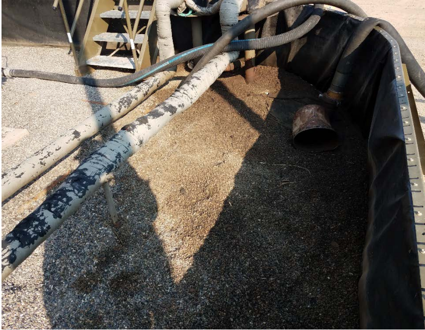
Location Photo #5, Stained/oily rock in corner of containment by stairs