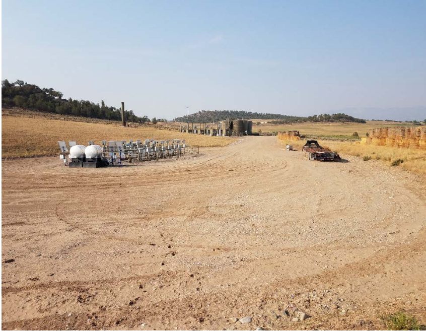
Location Photo #1