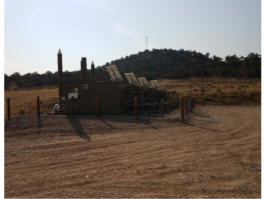
Location Photo #2