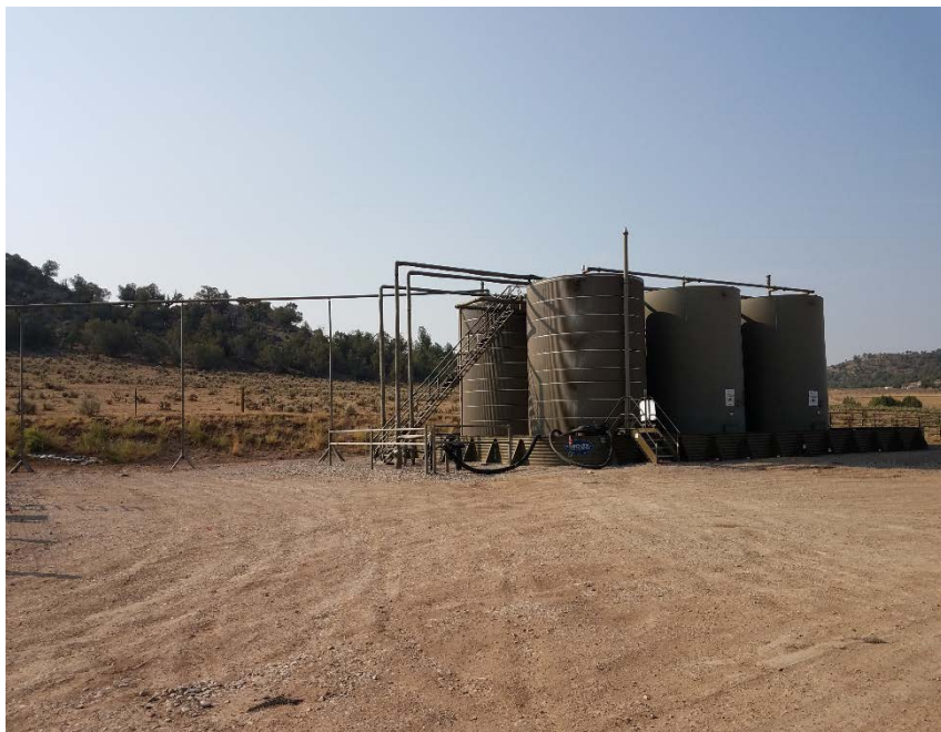
Location Photo #3