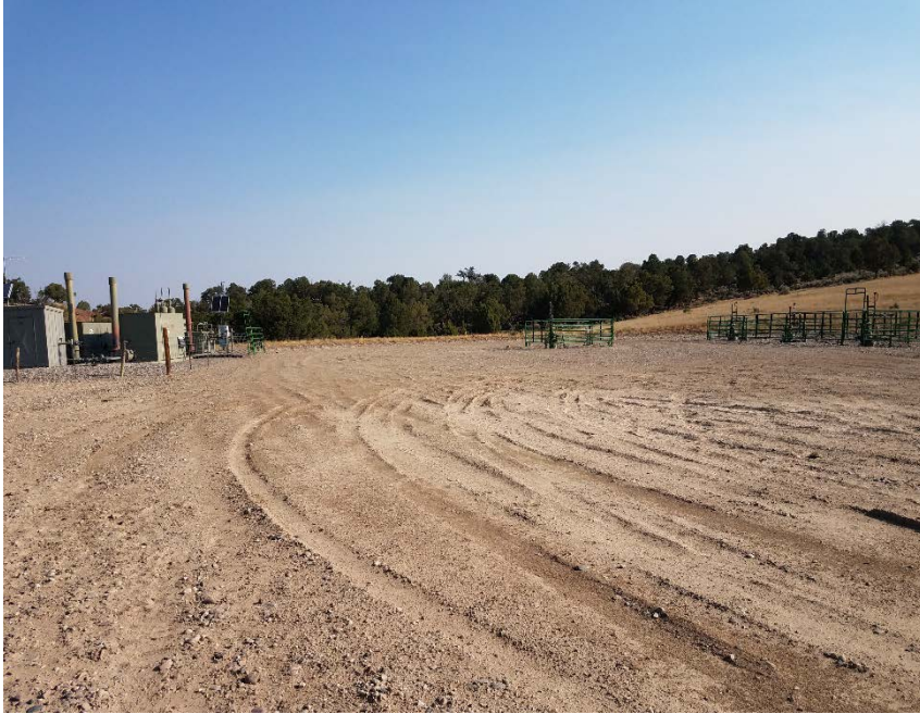
Location Photo #1