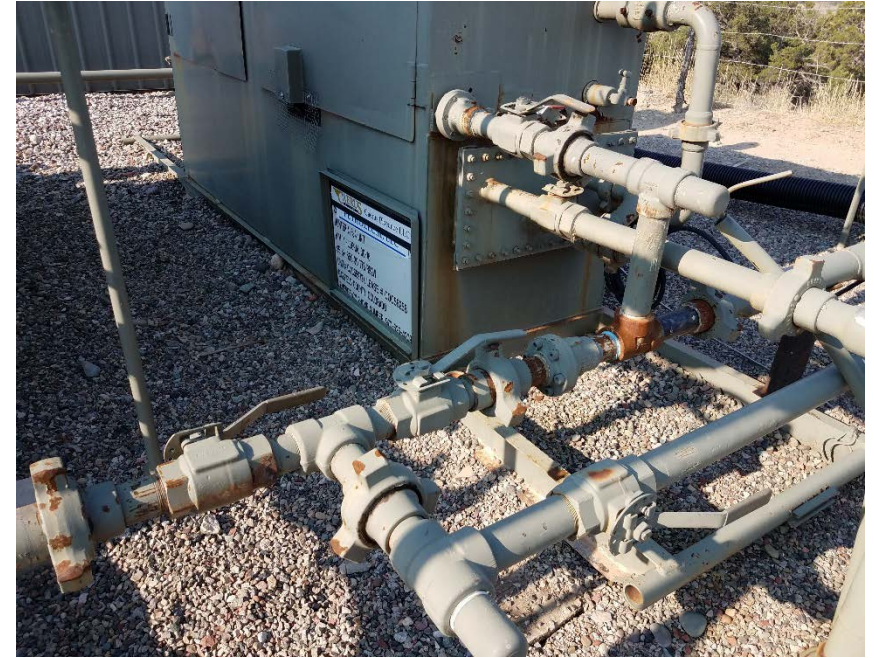
Location Photo #3, well shut in