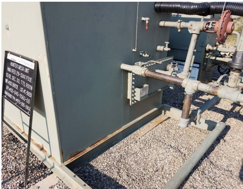
Location Photo #5, Well shut in