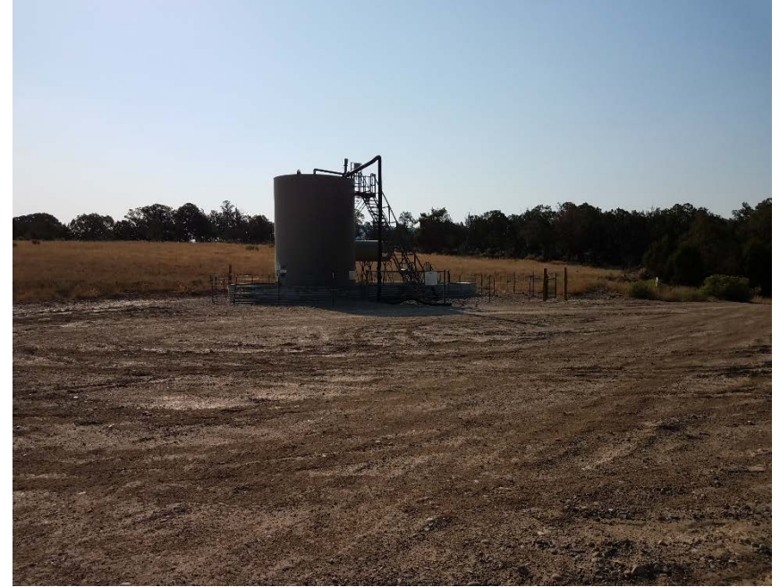
Location Photo #2