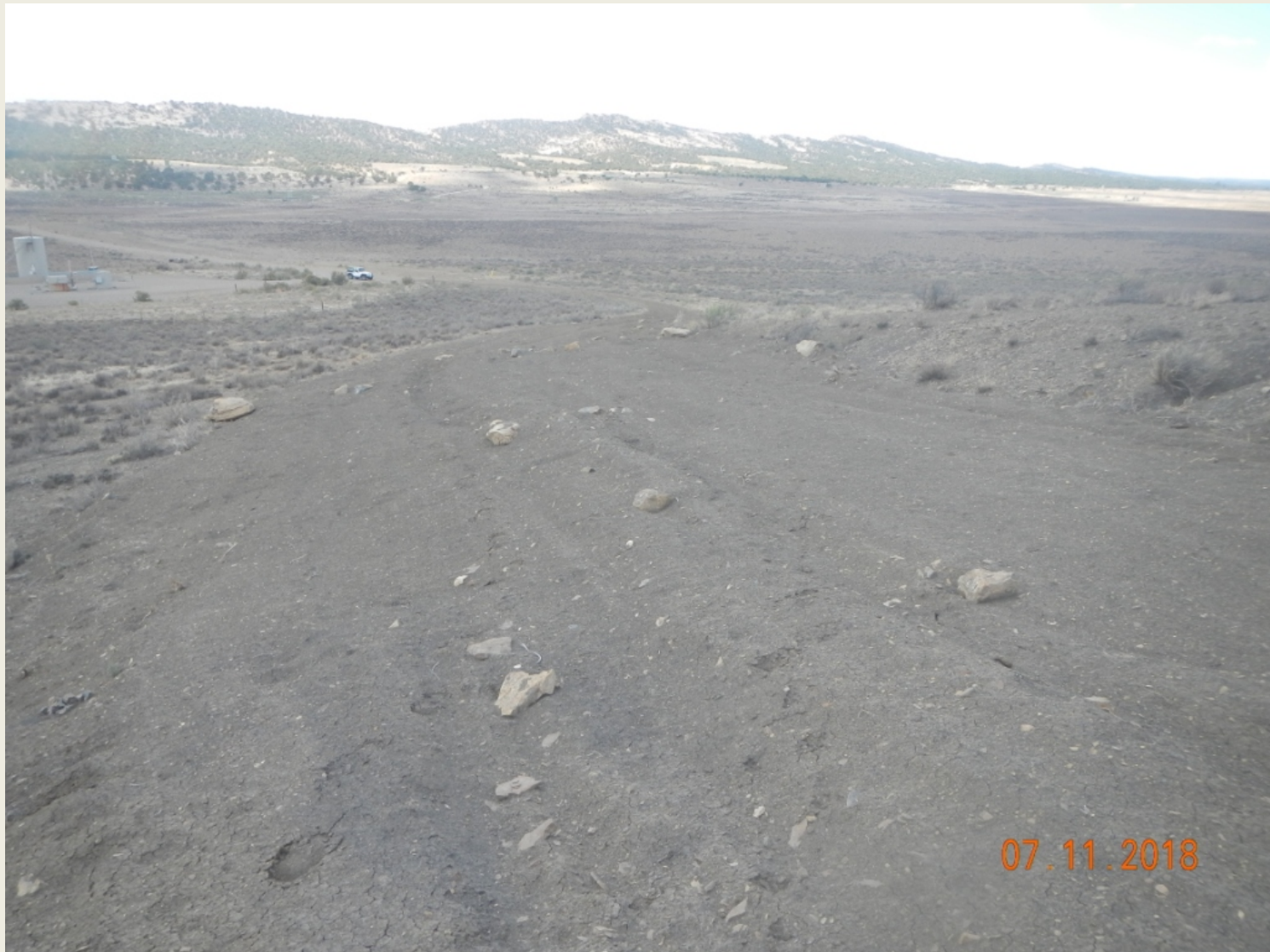
Photo 2. View of a portion of the reclaimed access facing southwestward. Reclamation activities appear to have been conducted. Little germination observed.