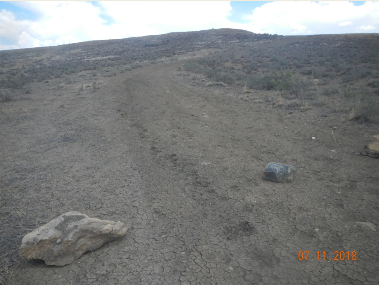
Photo 1. View of the beginning of reclaimed access facing northward.