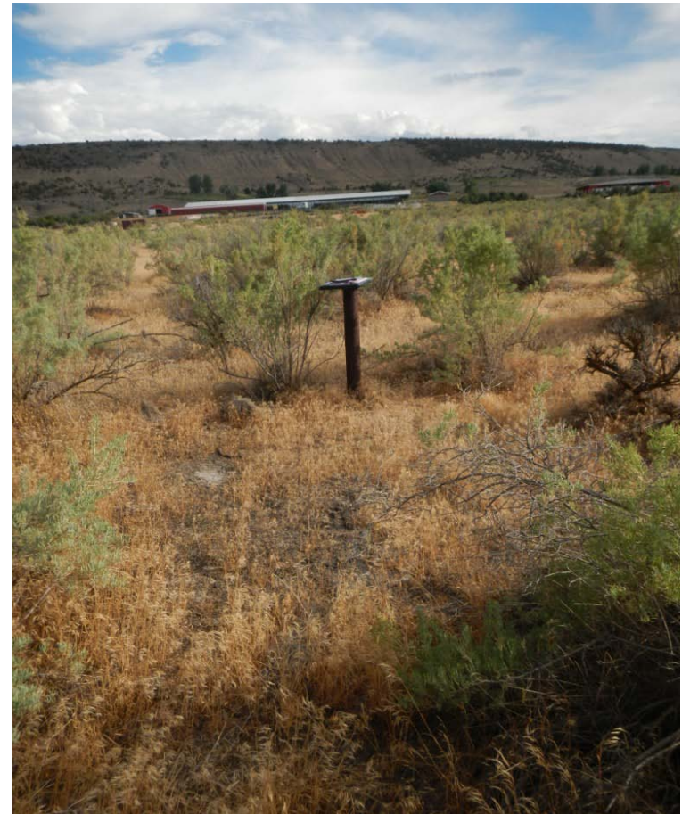
Photo#2: View South over API#103-40072