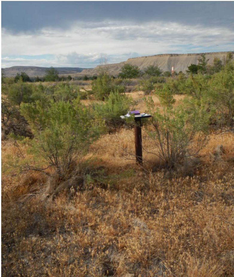
Photo#1: View North over API#103-40072