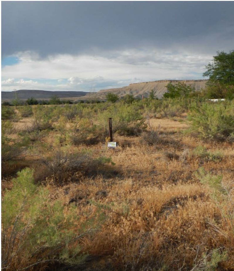
Photo#3: View North over API#103-04073