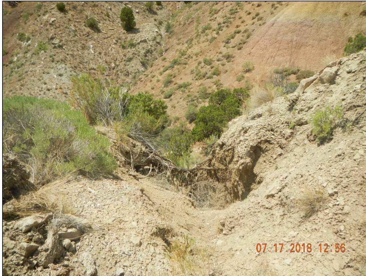
Erosion of hillside from ditch run off at top switch back. (39.48567 108.04314)

DOE PM 2-31 Api# 05-045-07036 Inspection # 689701621