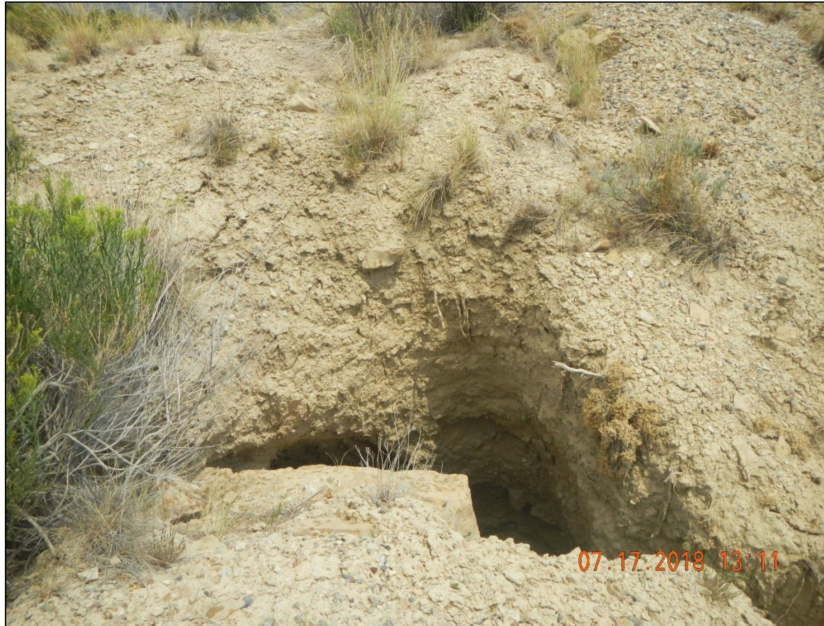
Erosion of hillside from ditch run off and rilling of roadside @ (39.48523 108.04113)

DOE PM 2-31 Api# 05-045-07036 Inspection # 689701621