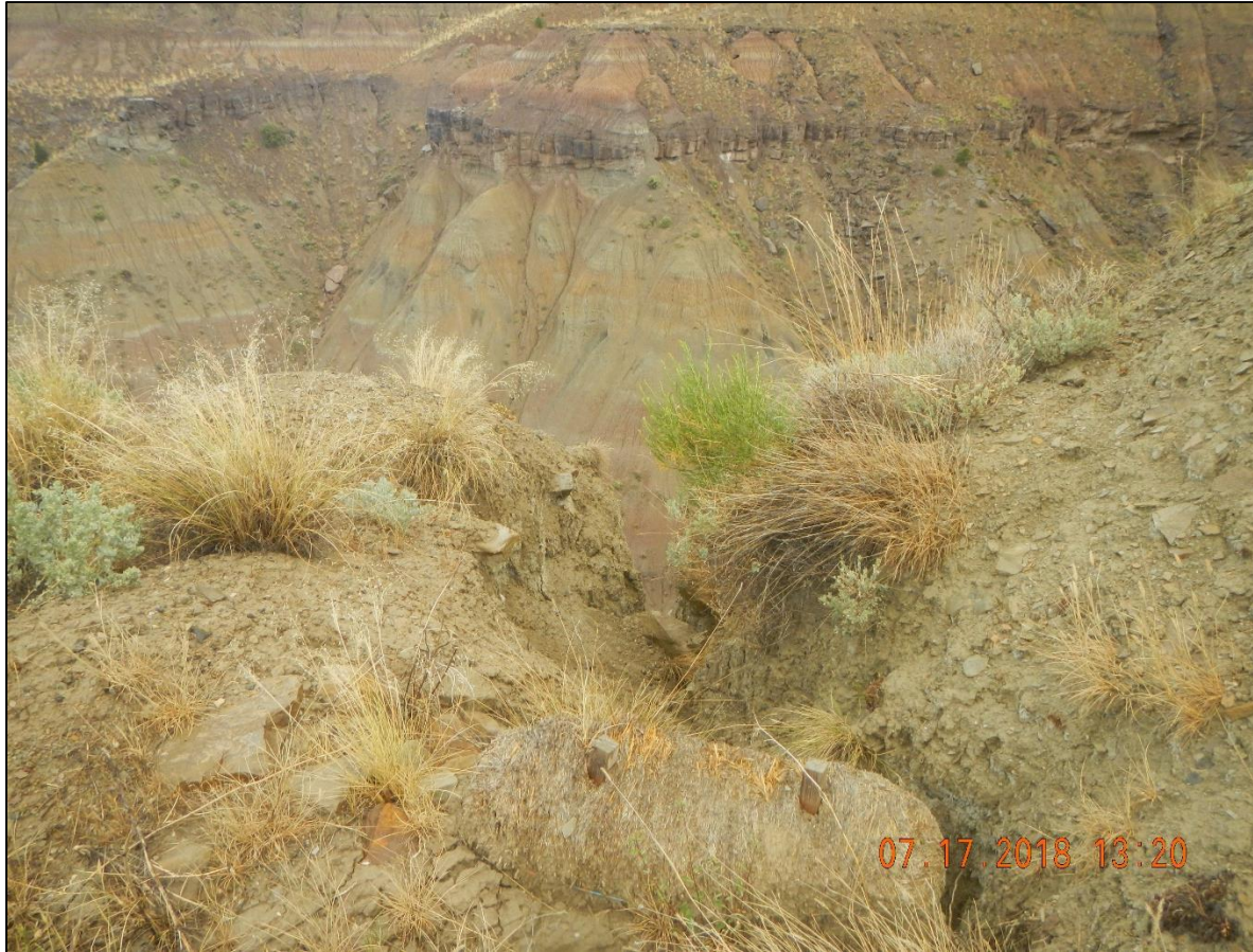
Erosion of hillside from ditch run off @ (39.48382 108.04018)

DOE PM 2-31 Api# 05-045-07036 Inspection # 689701621