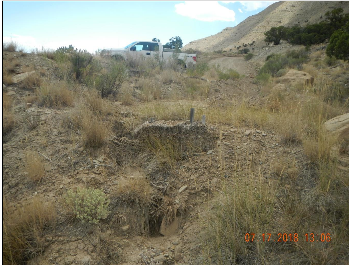
Sediment build up over straw bales used for check dams @ Switch back (39.48597 108.04075)

DOE PM 2-31 Api# 05-045-07036 Inspection # 689701621