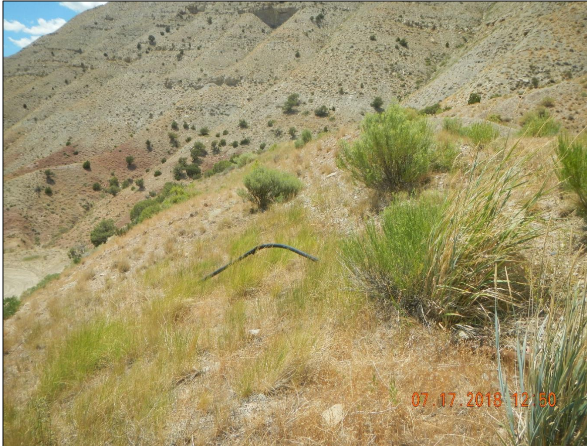
Tubing off the edge of location. 39.48637 -108.04253

DOE PM 2-31 Api# 05-045-07036 Inspection # 689701621