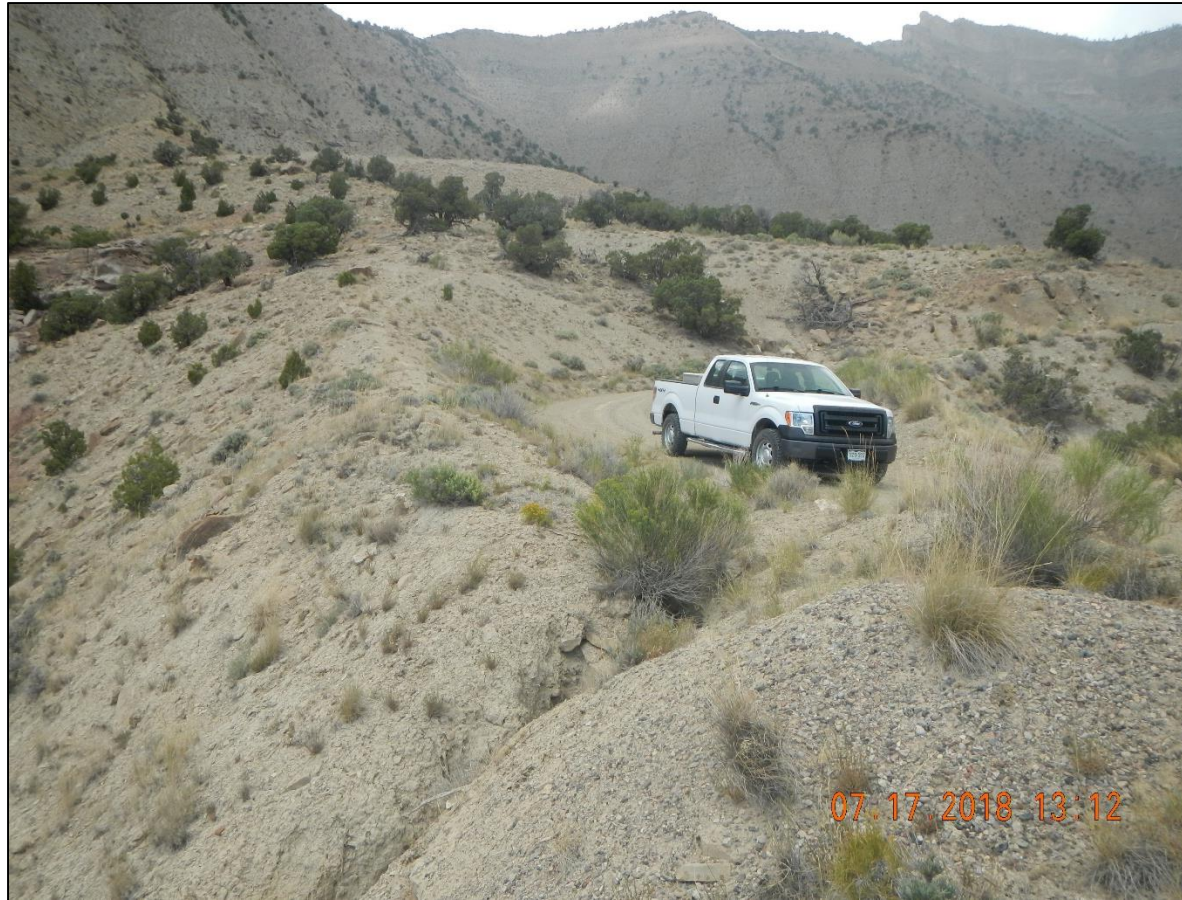
Erosion of hillside from ditch run off and rilling of roadside @ (39.48523 108.04113)

DOE PM 2-31 Api# 05-045-07036 Inspection # 689701621