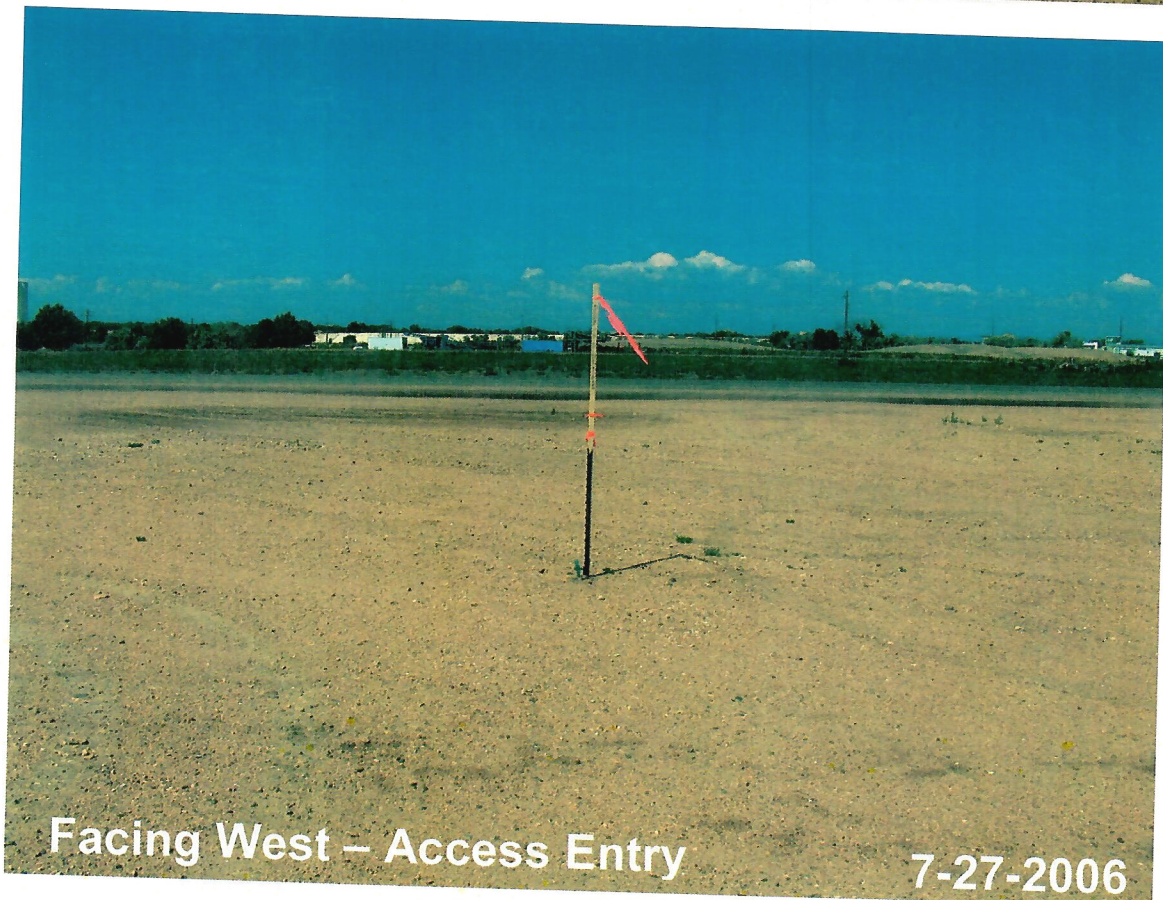
Facing West – Access Entry