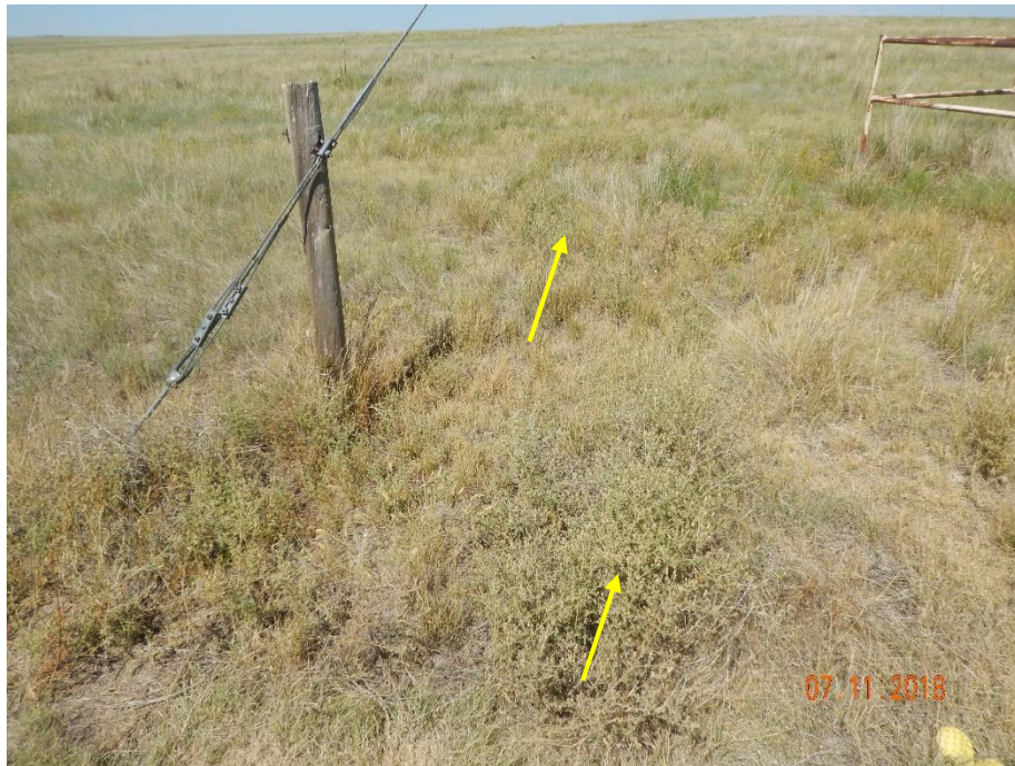
Photo 1: Photo taken from the western interim areas of the location, facing west.. Previous inspection required management and removal of noxious weeds.