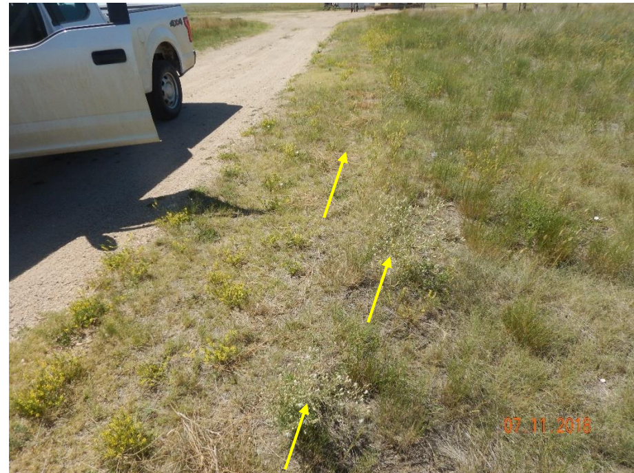
Photo 4: Photo taken from the access road, facing south. See comments under photo 1.

Photo shows Diffuse Knapweed (lighter, grey-green plants, white colored flowers) remains prevalent on location and access roads. Though there is evidence of herbicide, spraying does not appear to have been sufficient as many plants appear to be viable and have continued to mature/flower