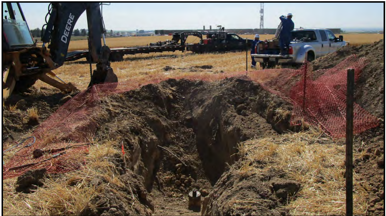
PHOTO: VIEW OF AS-DRILLED LOCATION