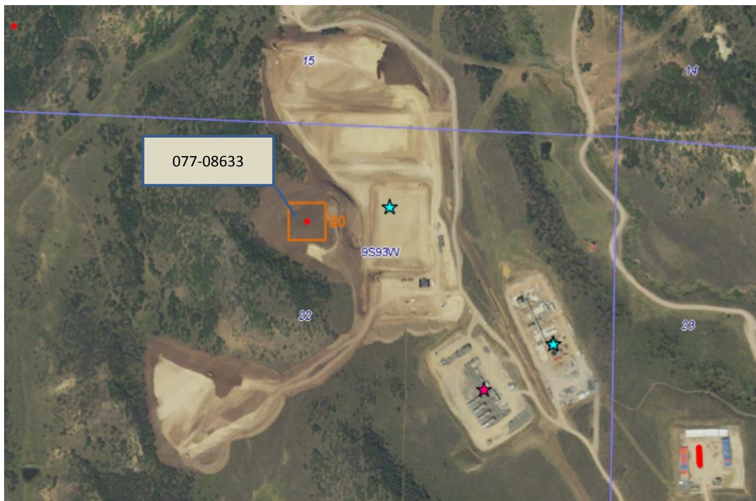
Photo#2: 2015 aerial view of AL Well API# 077- 08633 and Laramie Loc#425510