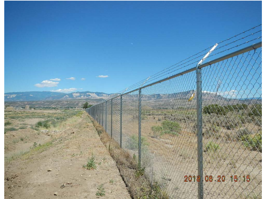
Photo #16 – View of fence line and fire road along south side of location. Fence is 6' tall chain link with ~2' of chicken wire at base to prevent wildlife access.