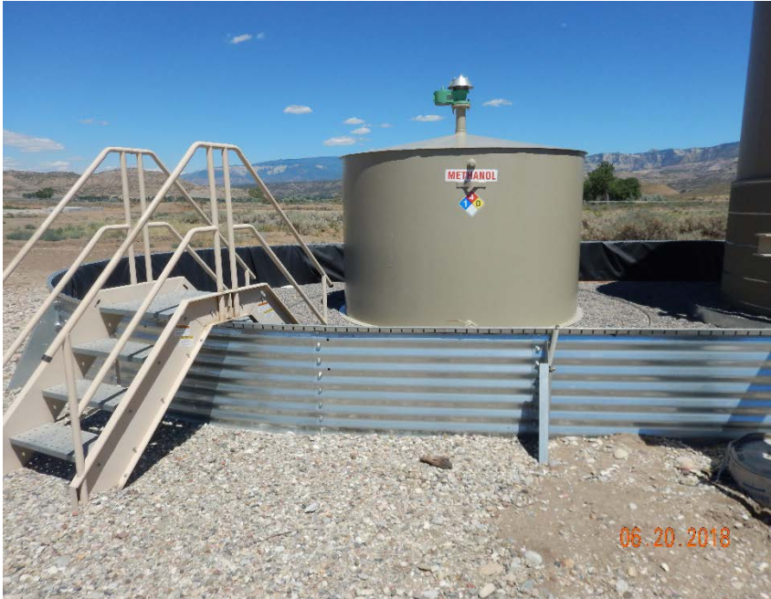
Photo #11 – 200 bbl methanol steel AST in lined earthen berm. Tank battery has been constructed at SE corner of location.