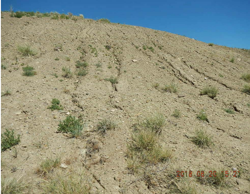
Photo #19 – Evidence of erosion and sediment transport along west side of soil stockpile.