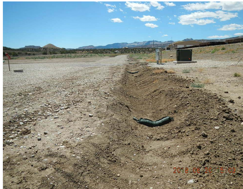
Photo #14 – Stormwater control ditch with wattles in use along access road to tank battery.