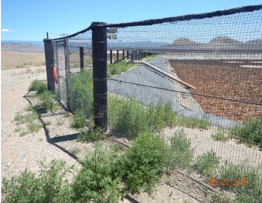
Photo #5 – Weeds encroaching on earthen berm, fence line, and pit liner at NE corner of pit. Note: Pit netting in good condition.