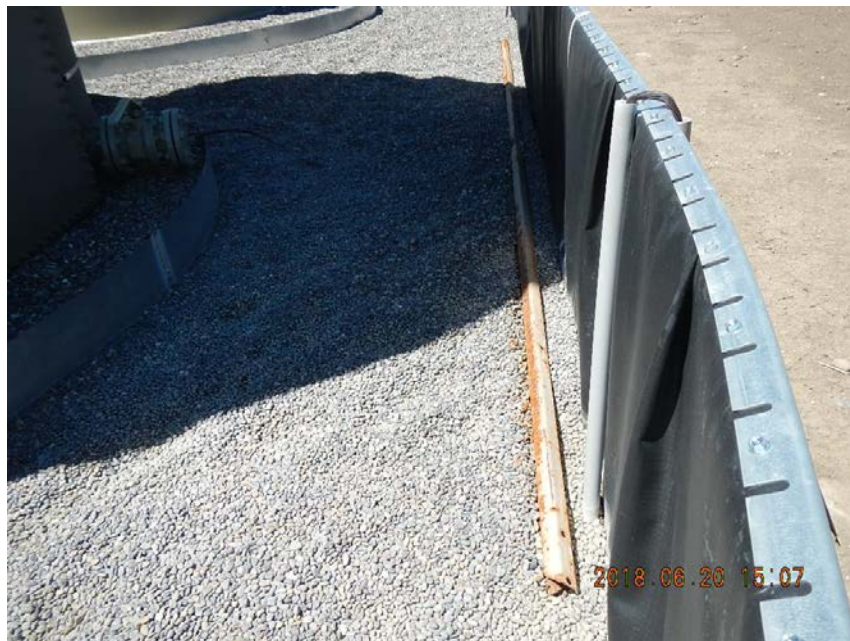
Photo #17 – ~20' angle iron segment stored inside of metal berm, located east of condensate AST.