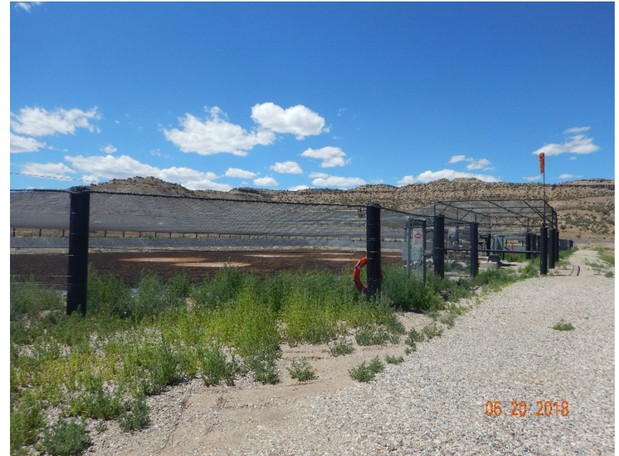
Photo #6 - Weeds encroaching on earthen berm, fence line, and pit liner at SE corner of pit. Note: Pit netting in good condition.