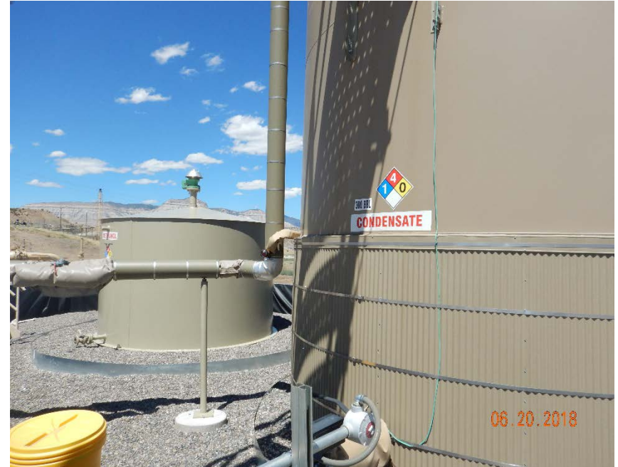
Photo #12 – Volume label and NFPA placard affixed to 300 bbl condensate steel AST.