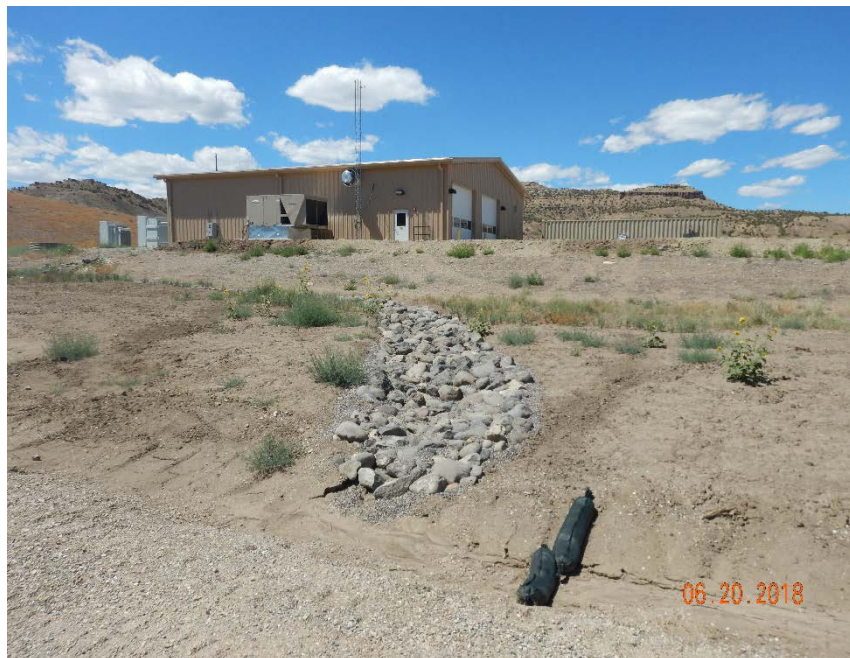
Photo #13 – Rock-lined erosion control channel and ditch with wattles in use south of pump house.