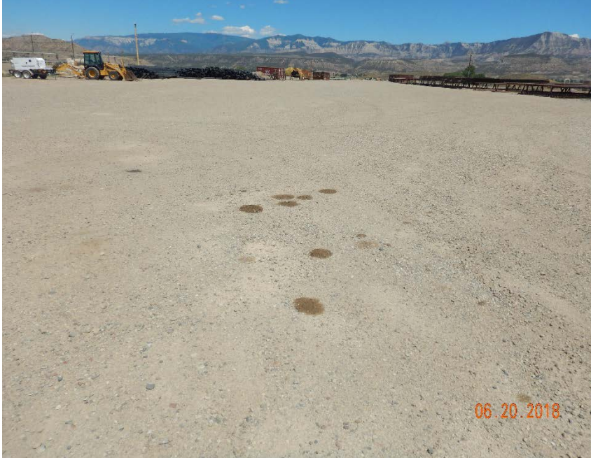
Photo #9 – Localized, oil-stained soil located north of truck loadouts.