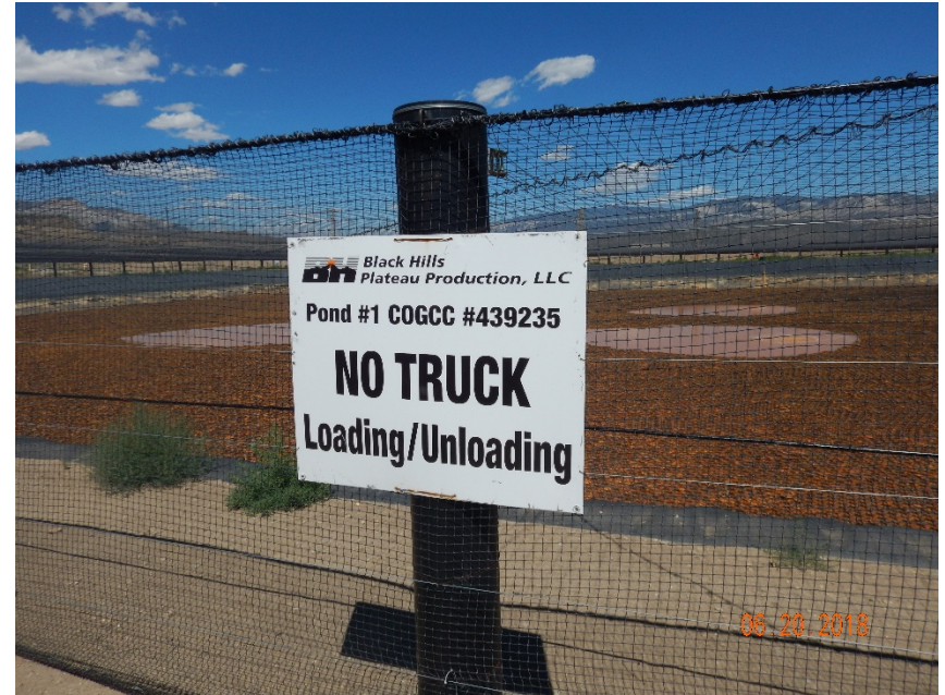
Photo #2 – Black Hills Plateau Production LLC sign located on west side of pit.