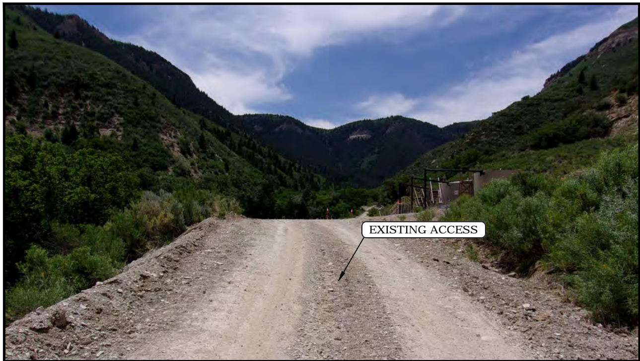
PHOTO: VIEW FROM BEGINNING OF EXISTING ACCESS