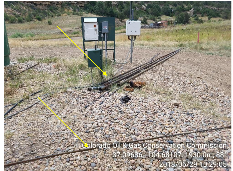
Photo 4. Unused equipment stored on location.