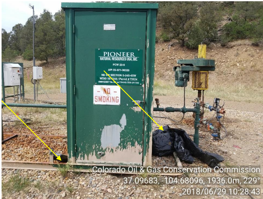
Photo 3. trash