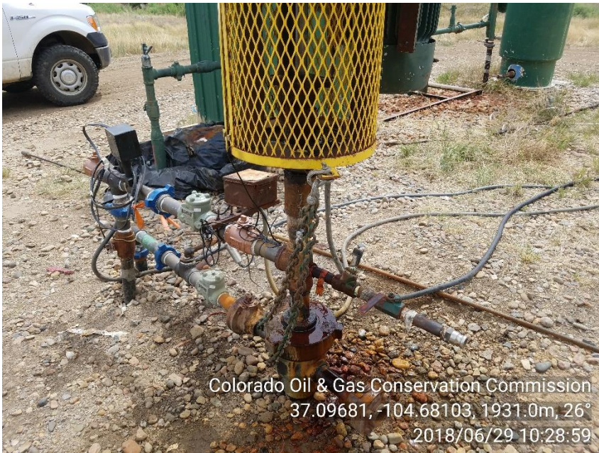
Photo 1. Wellhead/packing leak