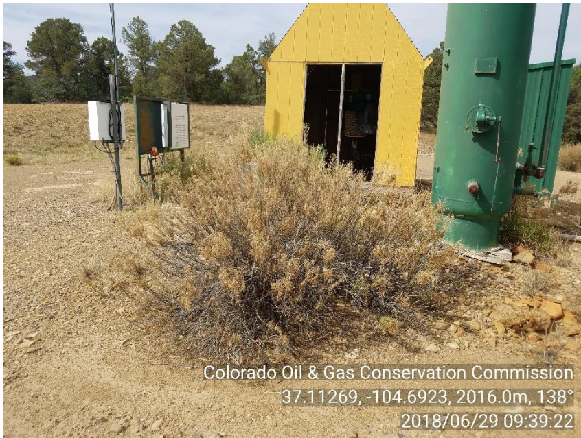
Photo 1. Wellhead/ Weeds