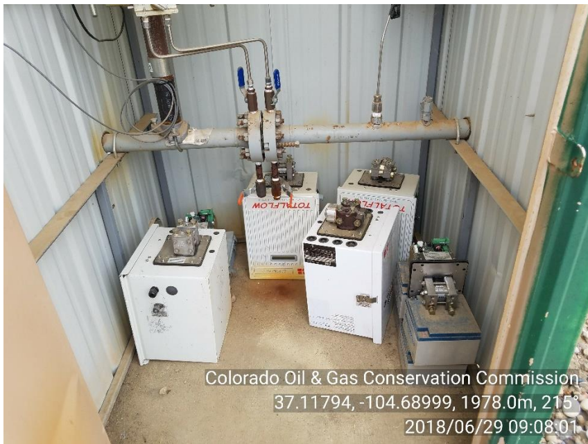
Photo 3. Unused equipment stored on location.