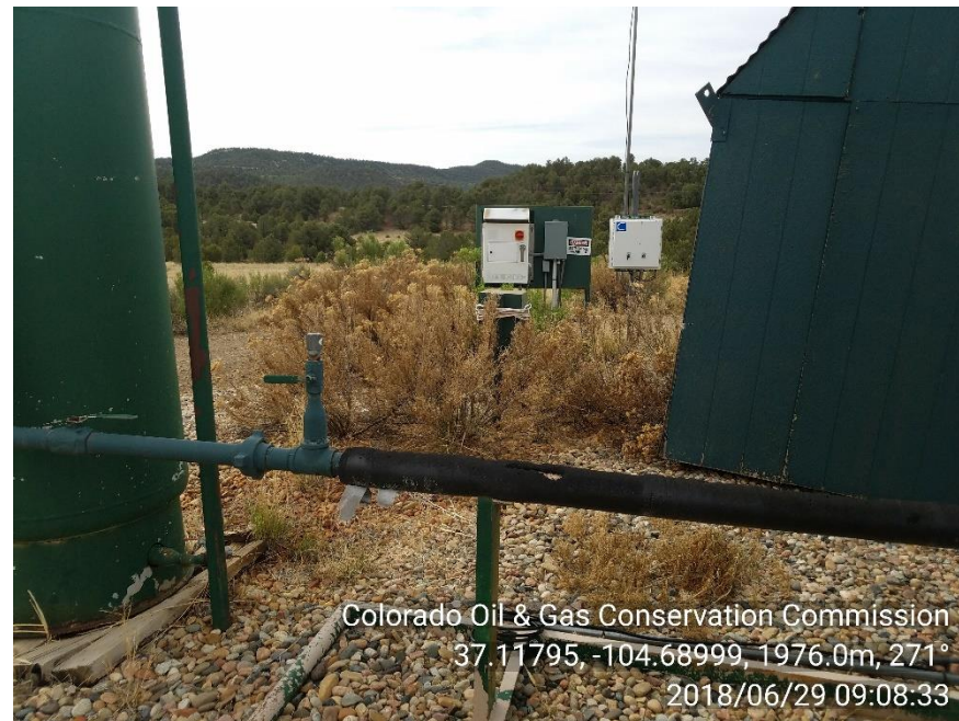
Photo 4. Weeds