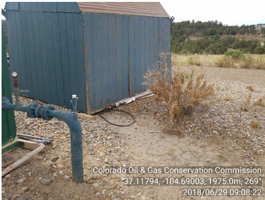
Photo 1. Wellhead