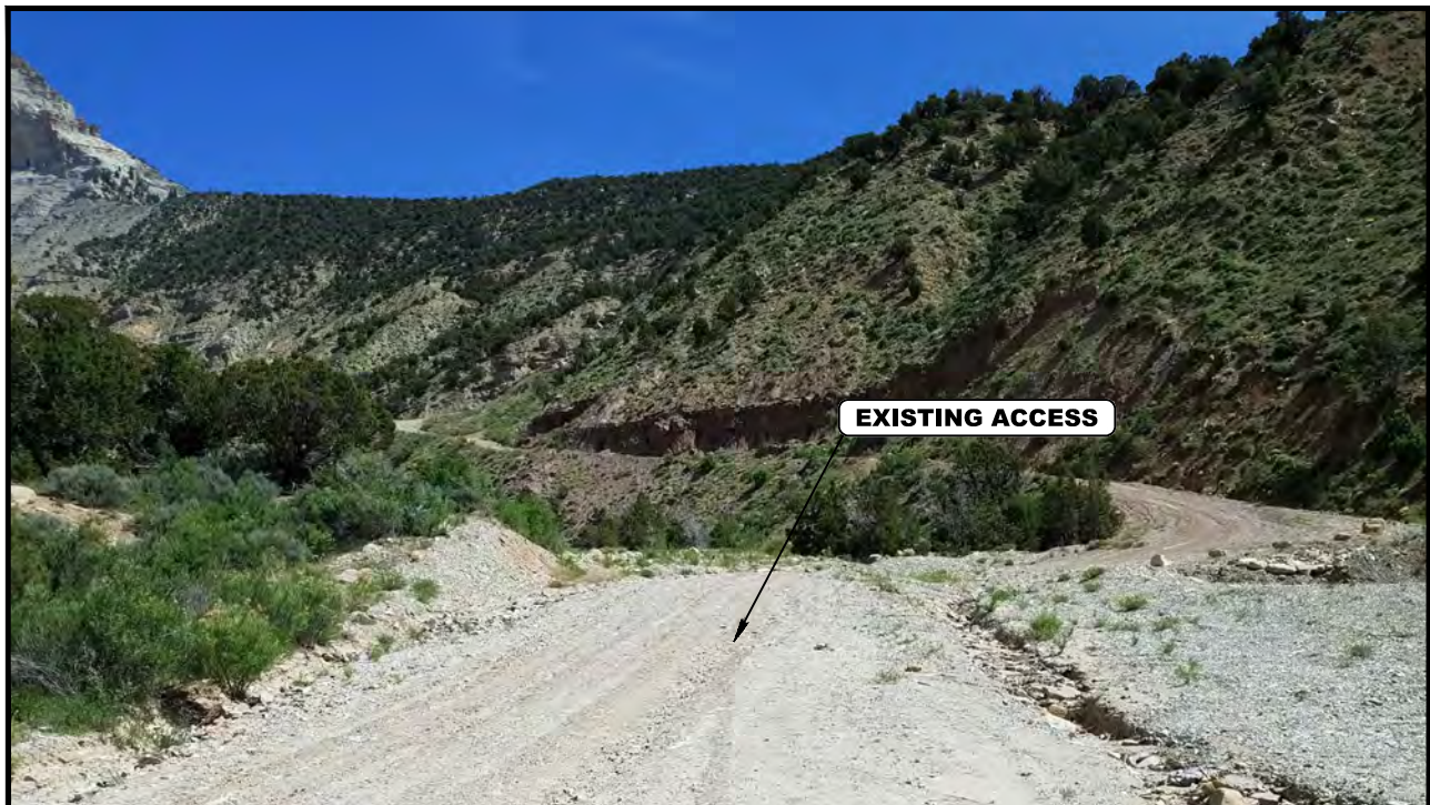
PHOTO: VIEW OF EXISTING ACCESS