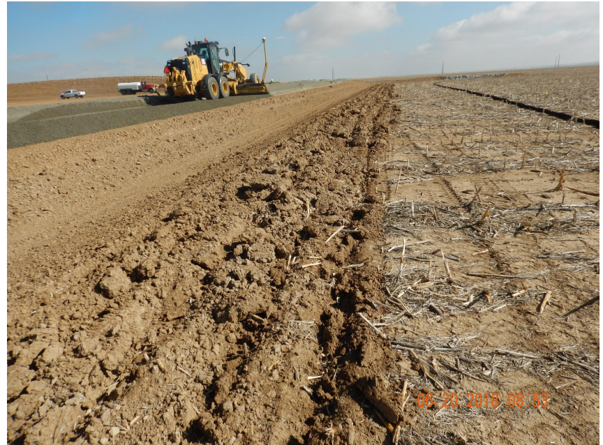
Photo 8. Photo taken from the southeastern perimeter of the location, facing North. Ditch, surface roughening, and wattle BPMs installed along the eastern perimeter.