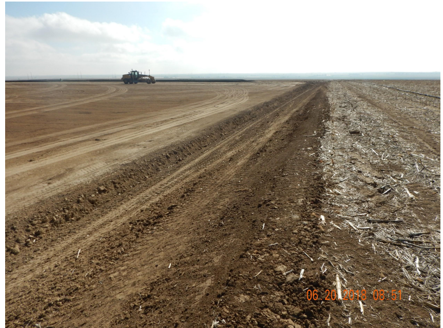
Photo 6. Photo taken from the southern perimeter of the location, facing East. See comments under Photo 3.