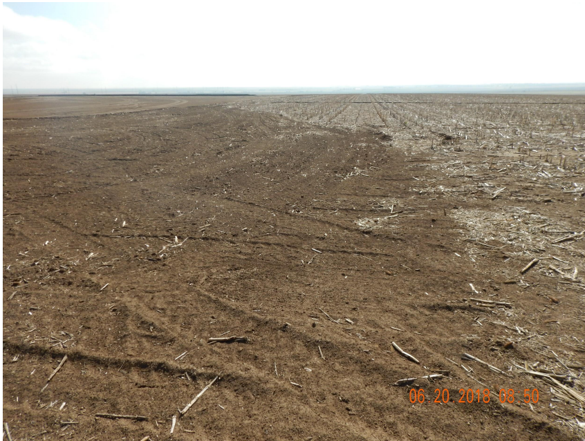
Photo 5. Photo taken from the southwest perimeter of the location, facing East. Filtrex wattles have been installed to the outer perimeter of the ditch BMP which is not visible in this photo.