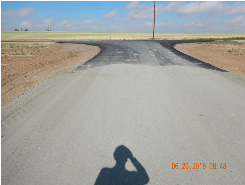
Photo 1. Photo taken from the entrance of location, facing West. Operator has constructed the approach and access road to the location.