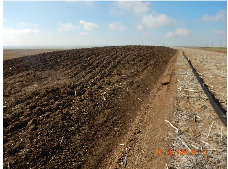
Photo 4. Photo taken from the western perimeter of the location, facing South. Photo illustrates the topsoil stockpile that has been stockpiled.