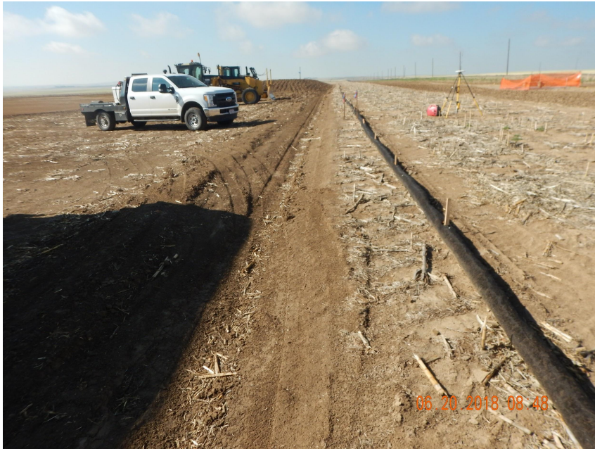
Photo 3. Photo taken from the northwestern perimeter of the location, facing South. Ditch BMP has been installed around the entire perimeter of the location which is directed to a sediment trap. In addition, filtrex wattles have been installed to the outer perimeter of the ditch BMP.