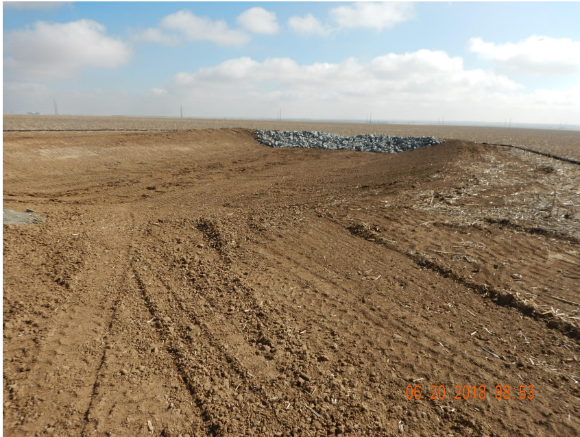
Photo 9. Photo taken from the northeastern perimeter of the location, facing North. Photo illustrates the sediment trap BMP.