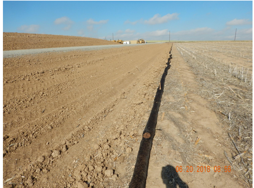
Photo 10. Photo taken from the southeastern perimeter of the location, facing North. Ditch, surface roughening, and wattle BMPs installed along the eastern perimeter.