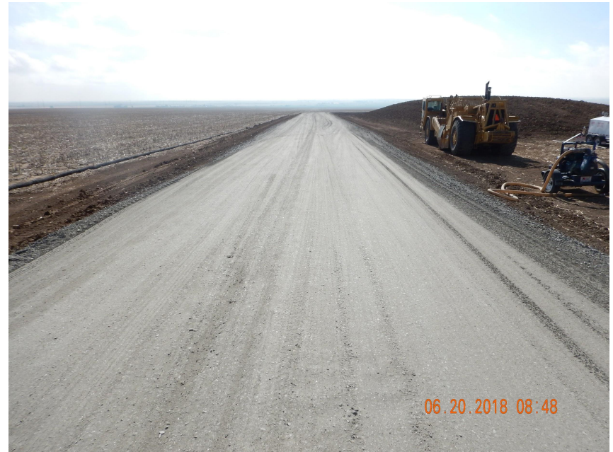
Photo 2. Photo taken from the entrance of location, facing East. See comments under Photo 1.