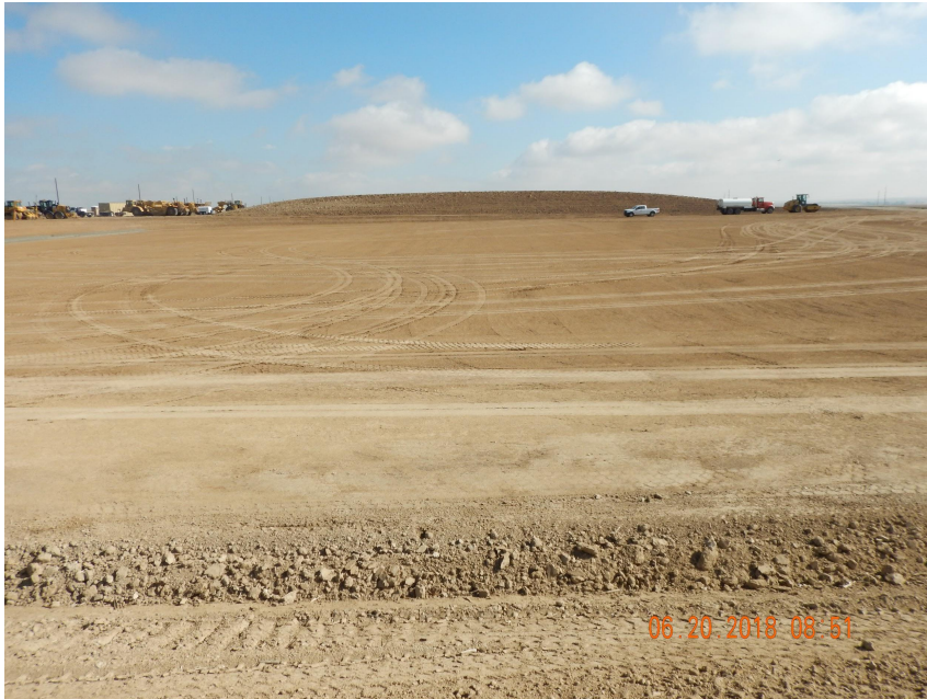
Photo 7. Photo taken from the southern perimeter of the location, facing North. Photo illustrates the operational well pad area with the spoils stockpile to the north.