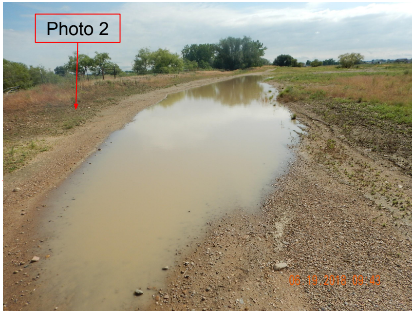
Photo 1. Photo taken from a portion of the access road, facing East. Photo illustrates an area of pooled water just west of the well location. Staff could not inspect this area of the access road for ruts. Staff did not drive past this point during the inspection.