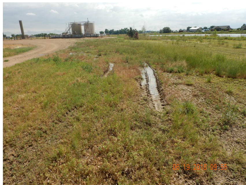
Photo 12. Photo taken from a portion of the southern access road, facing East. Per Rule 1002.e.(4), Operator shall minimize disturbances and shall not travel outside of the original access road boundary. Appears ruts were recently created. Operator shall repair ruts and shall comply with Rule 1004 standards.