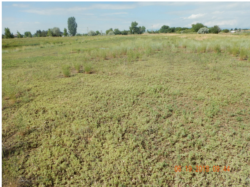
Photo 5. Photo taken just west of the well location, facing West. Photo illustrates Kochia rosette weeds (lower growing vegetation). See comments under Photo 3.