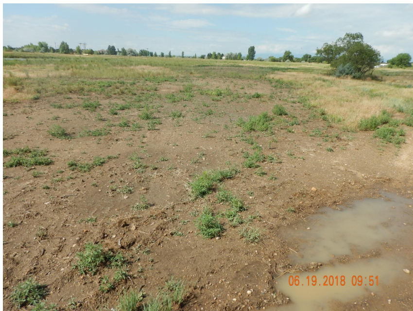
Photo 9. Photo taken from a portion of the flowline disturbance area at the interaction of the access road, facing West. See comments under Photos 3 & 8.