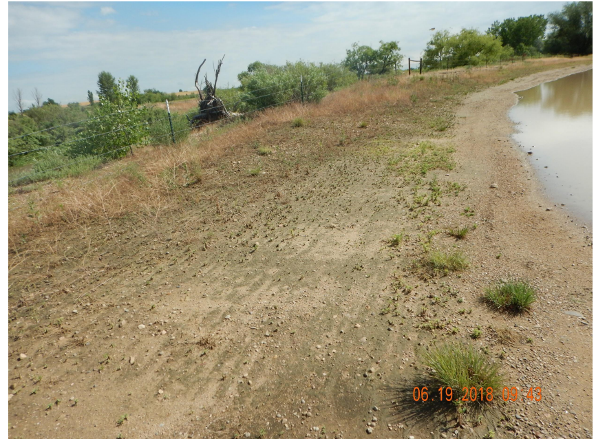
Photo 2. Photo taken from a portion of the northern access road, facing East. Appears a seeding attempt was performed by the evidence of drill rows. Operator may need to perform additional reclamation work as there did not appear to be uniform germination. Operator shall comply with Rule 1004 standards throughout all disturbance areas.