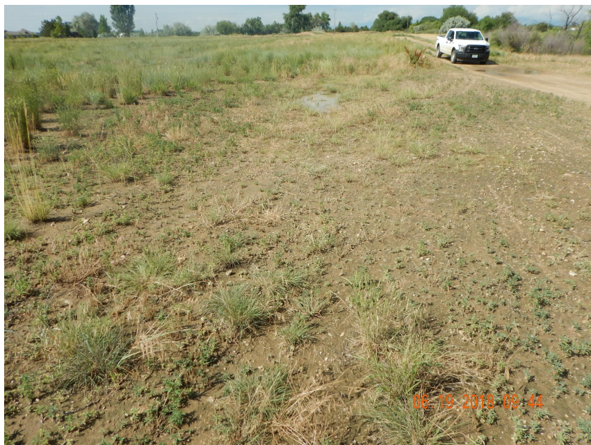
Photo 3. Photo taken from a portion of the southern access road, facing West. See comments under Photo 2. Also, Kochia weeds were observed throughout portions of the disturbance area. Operator shall control and manage Kochia until the location meets Rule 1004 standards.