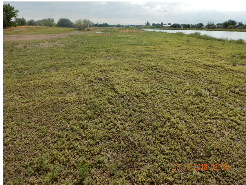
Photo 6. Photo taken just west of the well location, facing East. Photo illustrates Kochia rosette weeds (lower growing vegetation). See comments under Photo 3.