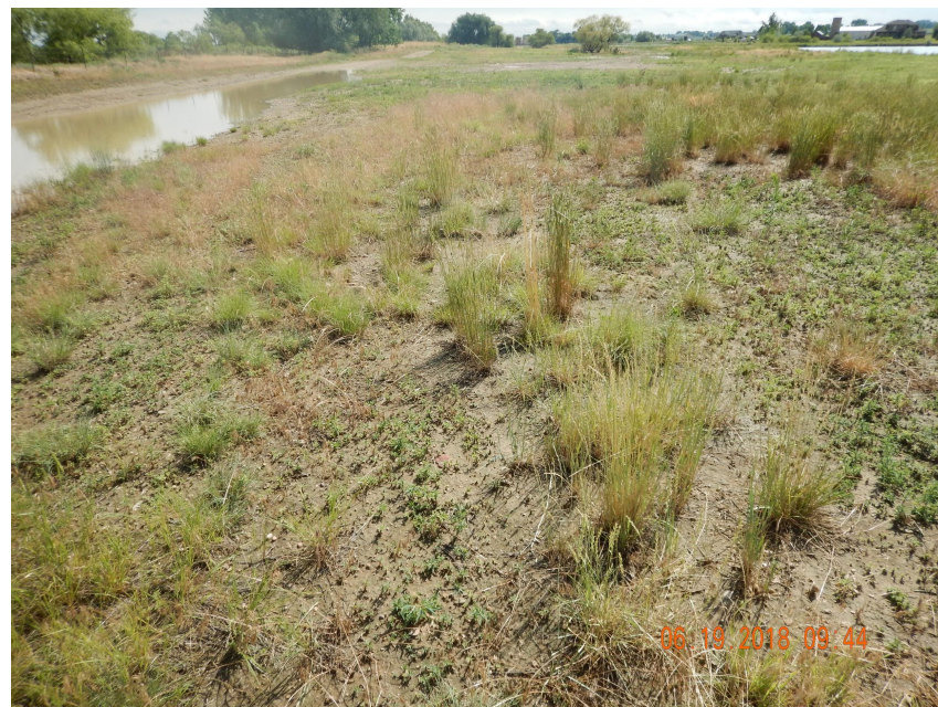
Photo 4. Photo taken from a portion of the southern access road, facing East. See comments under Photo 3.