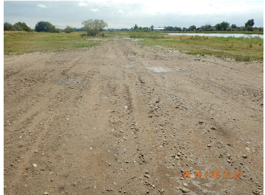
Photo 8. Photo taken from the well location, facing East. Photo illustrate a disturbance area from the well location and the removal of a flowline. Operator shall comply with Rule 1004 standards throughout all disturbance areas. No surface equipment was observed at the well location.