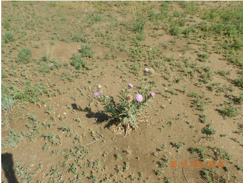
Photo 7. Photo taken near the well location. Photo illustrates Musk thistle, a List B Colorado noxious weed. Operator shall control and manage all List B Colorado noxious weeds. Staff only observed a few Musk and Scotch thistle plants. Scotch thistle is also a List B Colorado noxious weed.