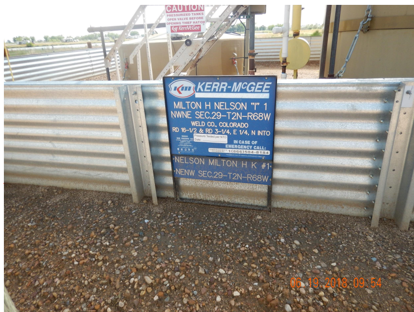
Photo 11. Photo taken from the battery location. Battery location is still active a services another nearby well.