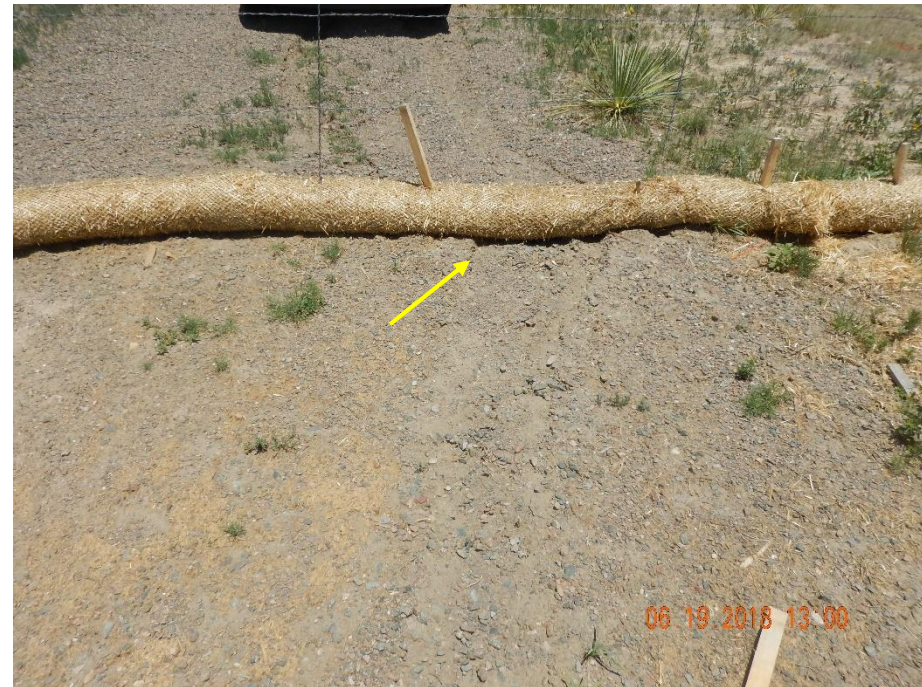
Photo 4: Photo taken from the northwest end of the location, facing north. Photo shows straw wattles have been installed on location. Photo shows wattles do not appear to have been installed in accordance to good engineering practices, and have not been entrenched and backfilled; wattles have been placed directly upon the soil surface. As a result, stormwater erosion and degradation has continued on the location, and is cutting beneath the new wattles (yellow arrow). Photo also shows gravel has not been removed from the western end of the pad as indicated by the FIRR.