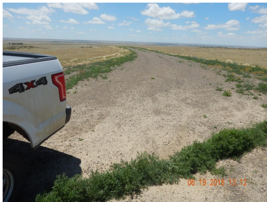
Photo 20: Photo taken from the access road entrance, facing south. Photo shows access road has not been reclaimed.