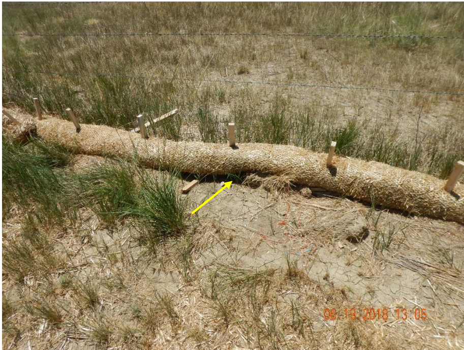
Photo 13: Photo taken from the southern perimeter of the location. See comments under photo 10.