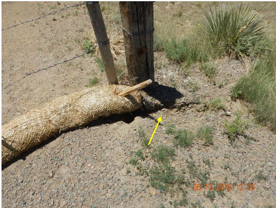
Photo 3: Photo taken from the entrance of the location. Photo shows stormwater erosion is now occurring at entrance.