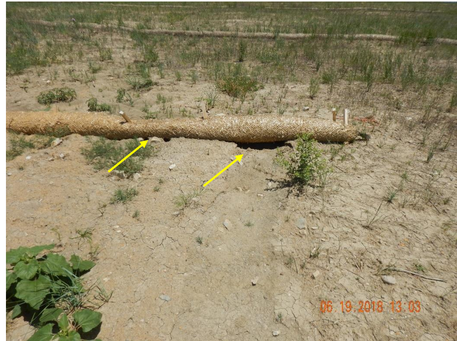
Photo 8: Photo taken from the south end of the location, facing north. See comments under photo 4.