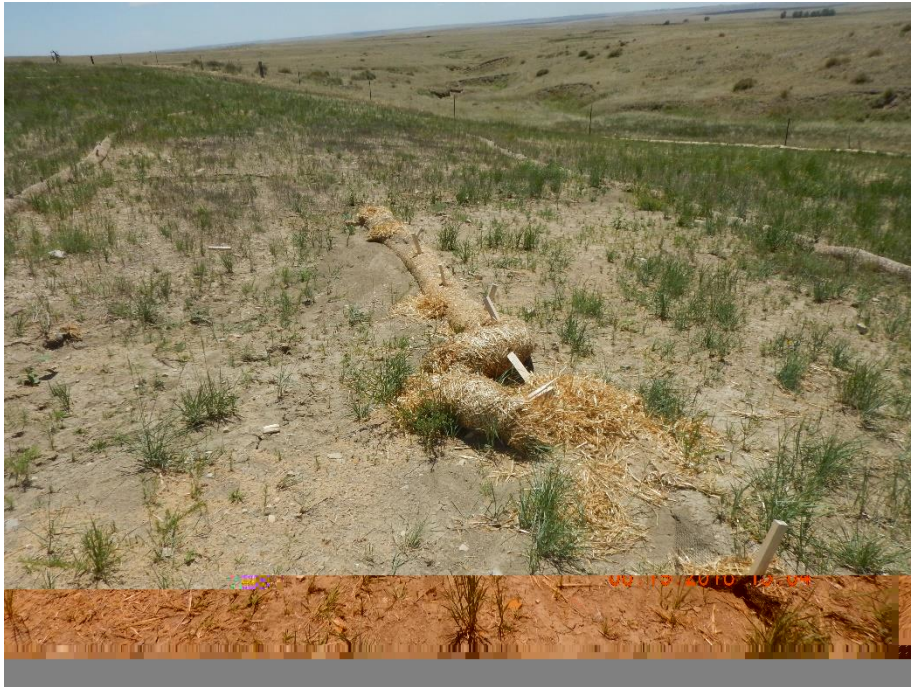
Photo 11: Photo taken from the south end of the location, facing southeast. Photo of straw wattle in disrepair.