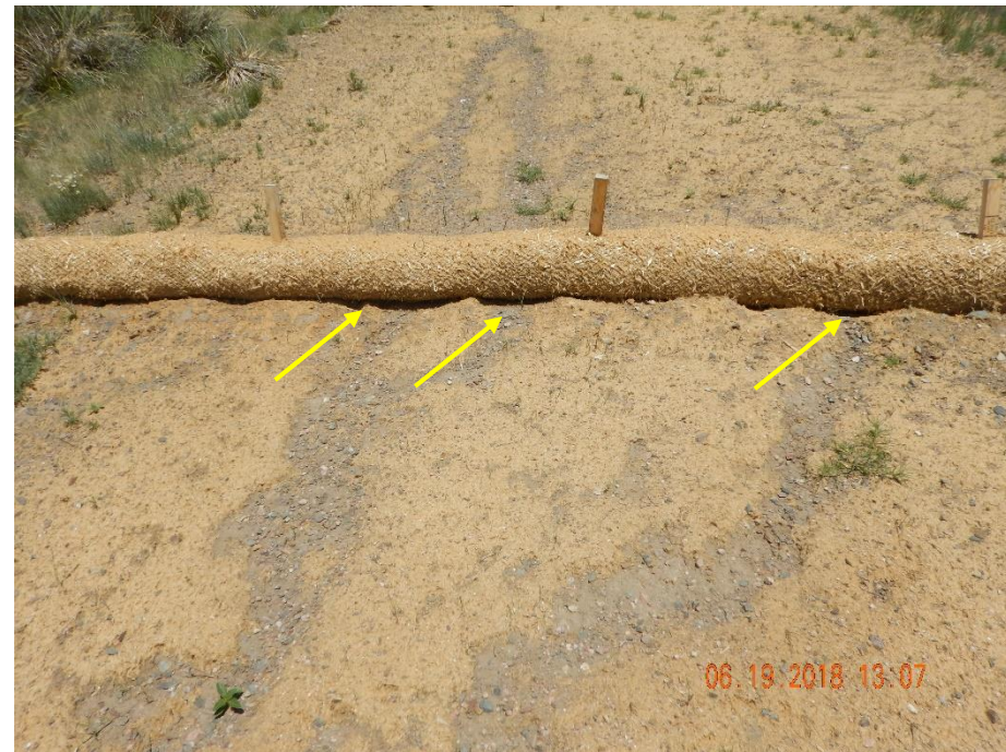
Photo 14: Photo taken from the west end of the location, facing north. See comments under photo 10.