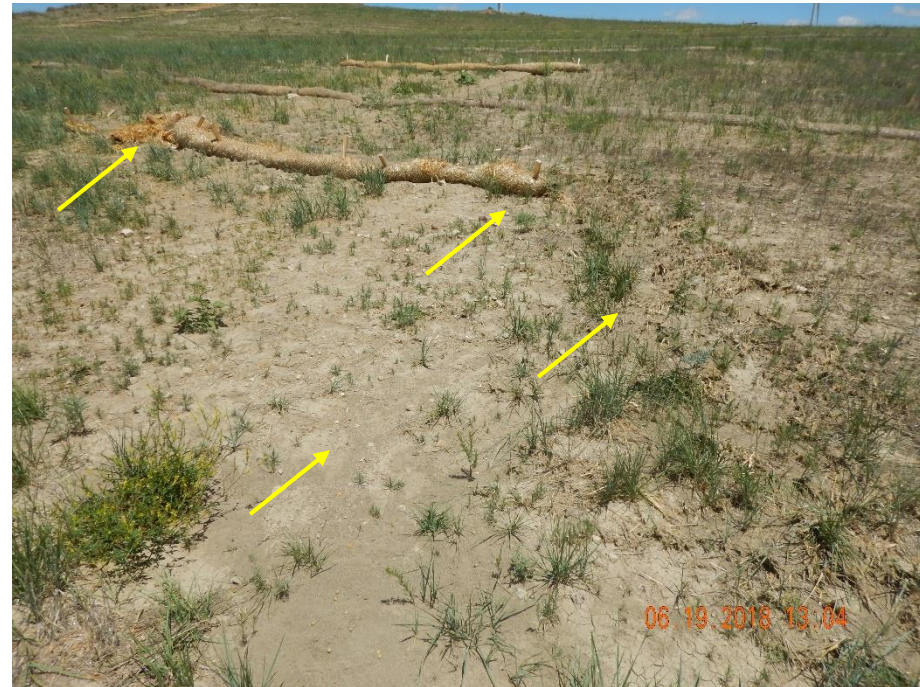
Photo 12: Photo taken from the south end of the location, facing north. Photo shows straw wattle BMP in disrepair, and stormwater erosion degradation.