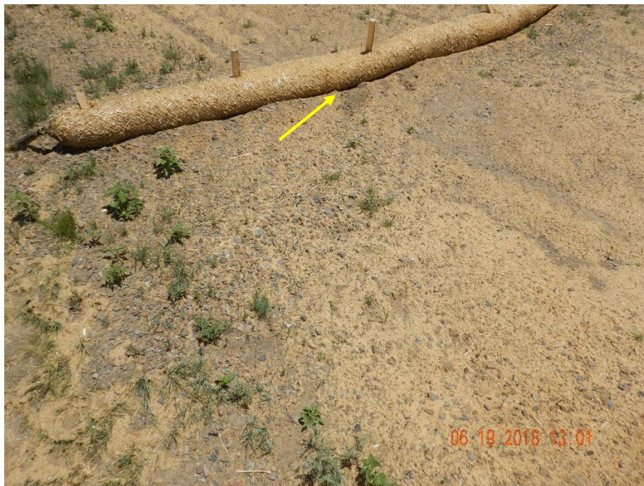
Photo 5: Photo taken from the northwest end of the location. See comments under photo 4.