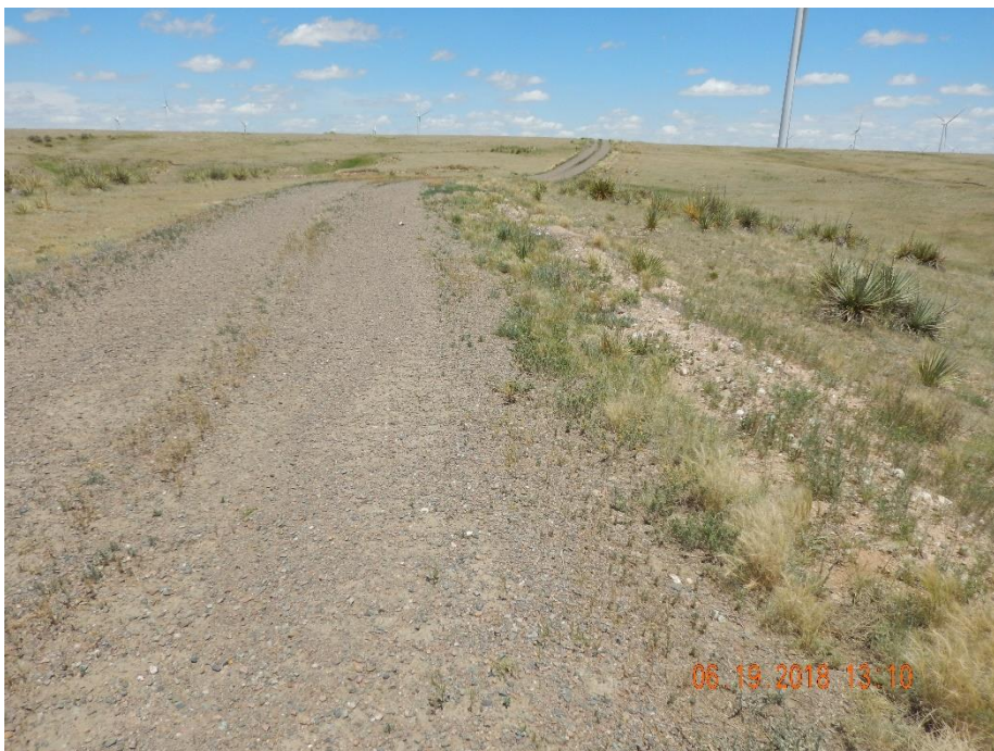
Photo 19: Photo taken from the access road, facing north. Photo shows access road has not been reclaimed.