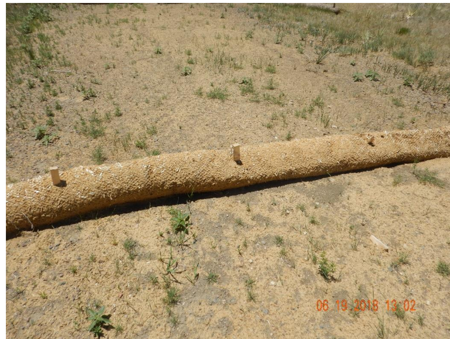
Photo 6: Photo taken from the northwest end of the location. See comments under photo 4.