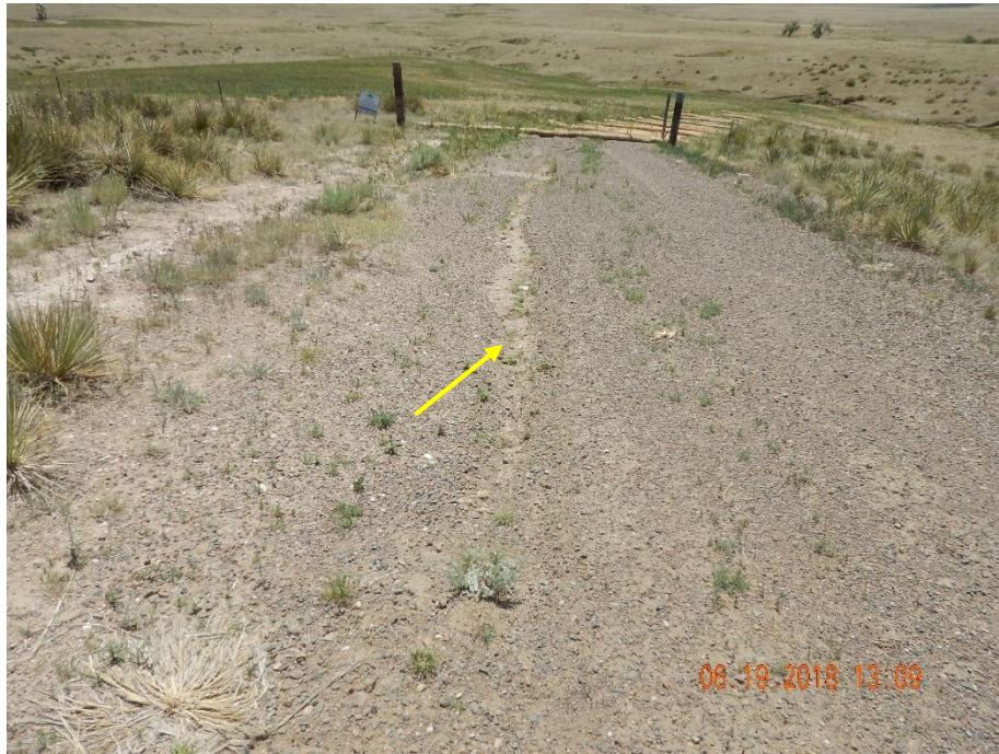
Photo 17: Photo taken from the access road, north of the location, facing south. Photo shows erosion degradation along access road, and that access road has not been reclaimed.