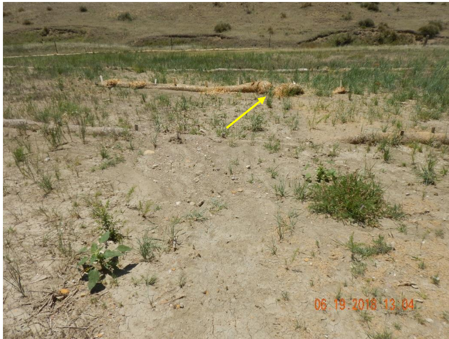
Photo 9: Photo taken from the south end of the location facing south. Photo of stormwater sediment deposition. Photo also shows newer straw wattle in disrepair.