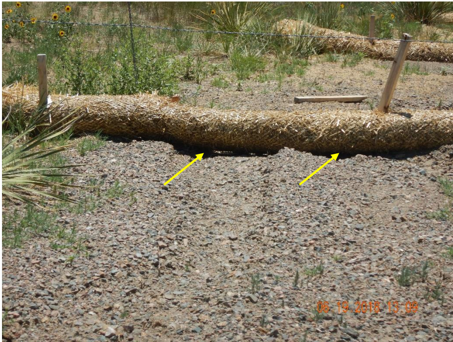
Photo 15: Photo taken from the northwest end of the location, facing south. See comments under photo 10.