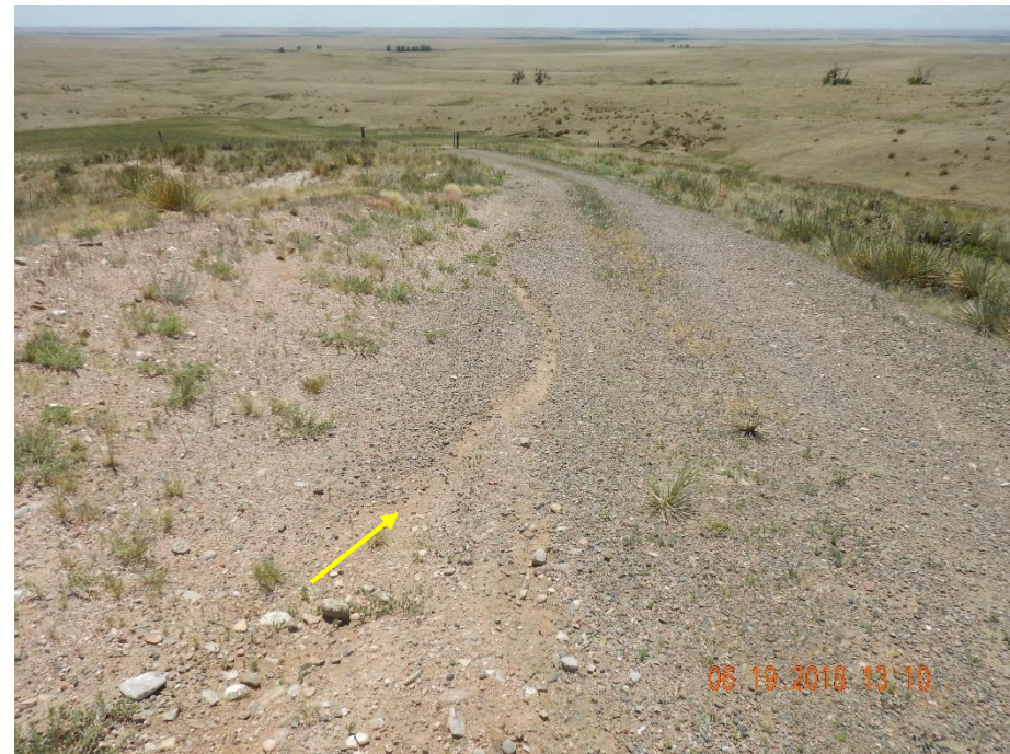
Photo 18: Photo taken from the access road, north of the location, facing south. Photo shows erosion degradation along access road, and that access road has not been reclaimed.