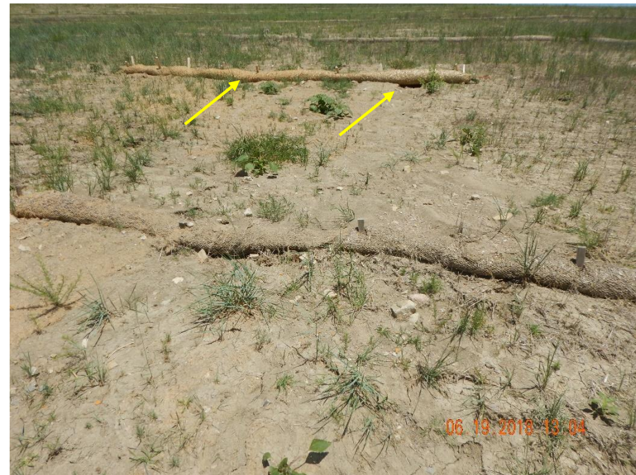
Photo 10: Photo taken from the south end of the location facing south. Photo shows straw wattles have been installed on location. Photo shows wattles do not appear to have been installed in accordance to good engineering practices, and have not been entrenched and backfilled; wattles have been placed directly upon the soil surface. As a result, stormwater erosion and degradation has continued on the location, and is cutting beneath the new wattles (yellow arrow).