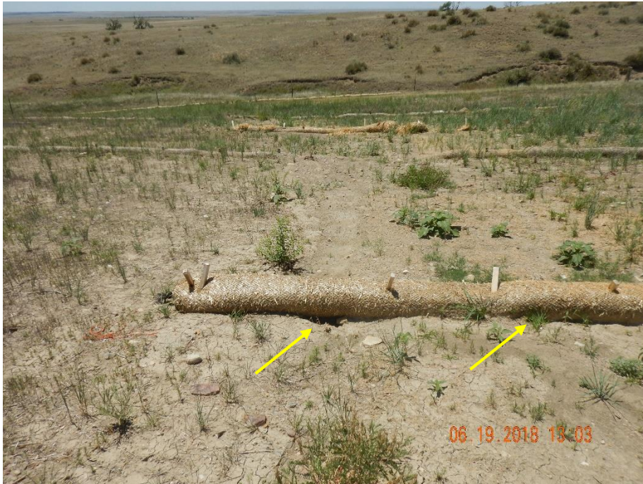
Photo 7: Photo taken from the south end of the location, facing south. See comments under photo 4.