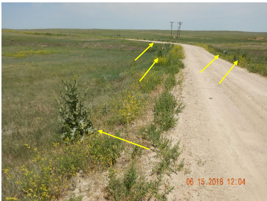
Photo 1: Photo taken from the access road, east of the location, facing north. Photo of Scotch Thistle along road.