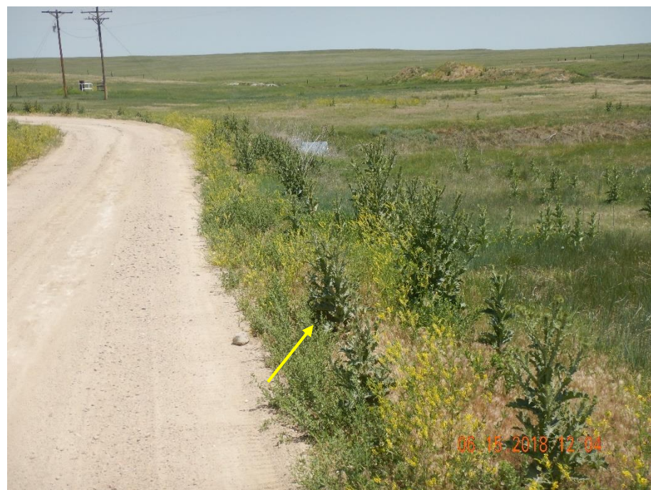
Photo 2: Photo taken from the access road, east of the location, facing north. Photo of Scotch Thistle along road.