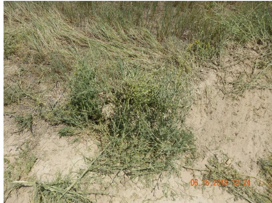
Photo 6: Continued from photo 5. Photo of Diffuse Knapweed that remains intact/uncut after mowing operations.