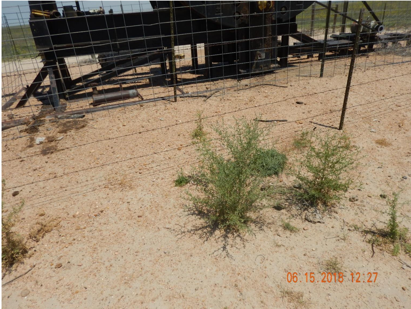
Photo 9: Photo taken from the west end of the well. Photo shows Diffuse Knapweed on location.