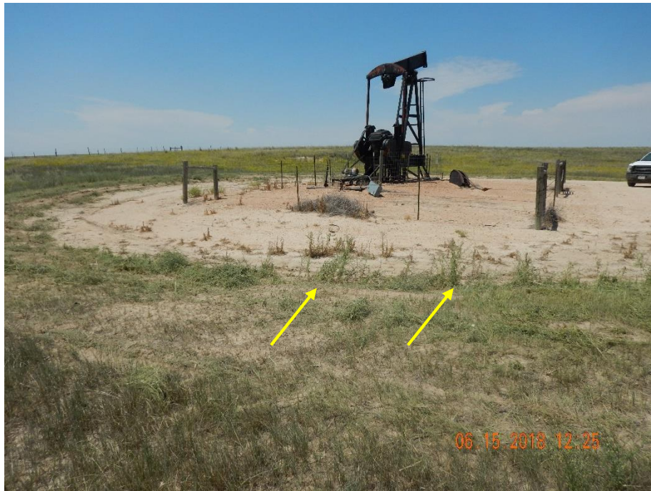
Photo 7: Photo taken from the east end of the well location, facing southwest. Mowing operations appear to have been conducted, however, there are areas where noxious weeds (Diffuse Knapweed) remain intact/uncut. In addition, Knapweed was observed on areas of the access road and location beyond where mowing operations were conducted.