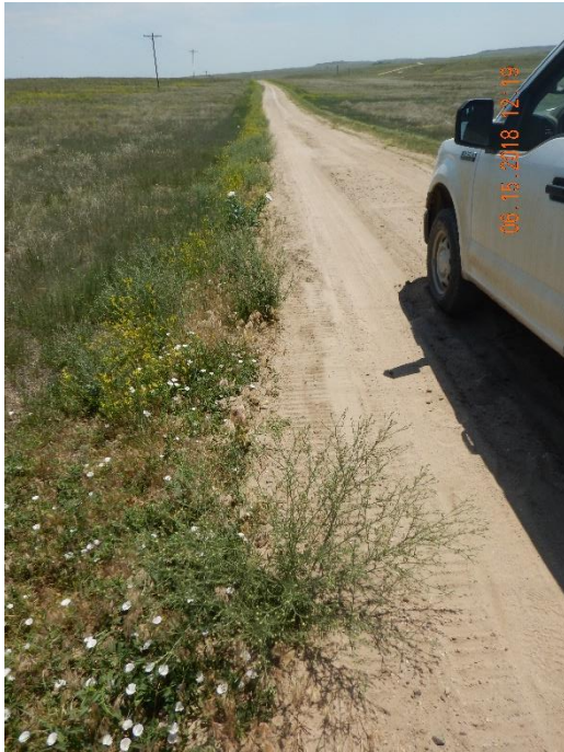
Photo 3: Photo taken from the access road, east of the location, facing west. Photo of Diffuse Knapweed observed along access road.