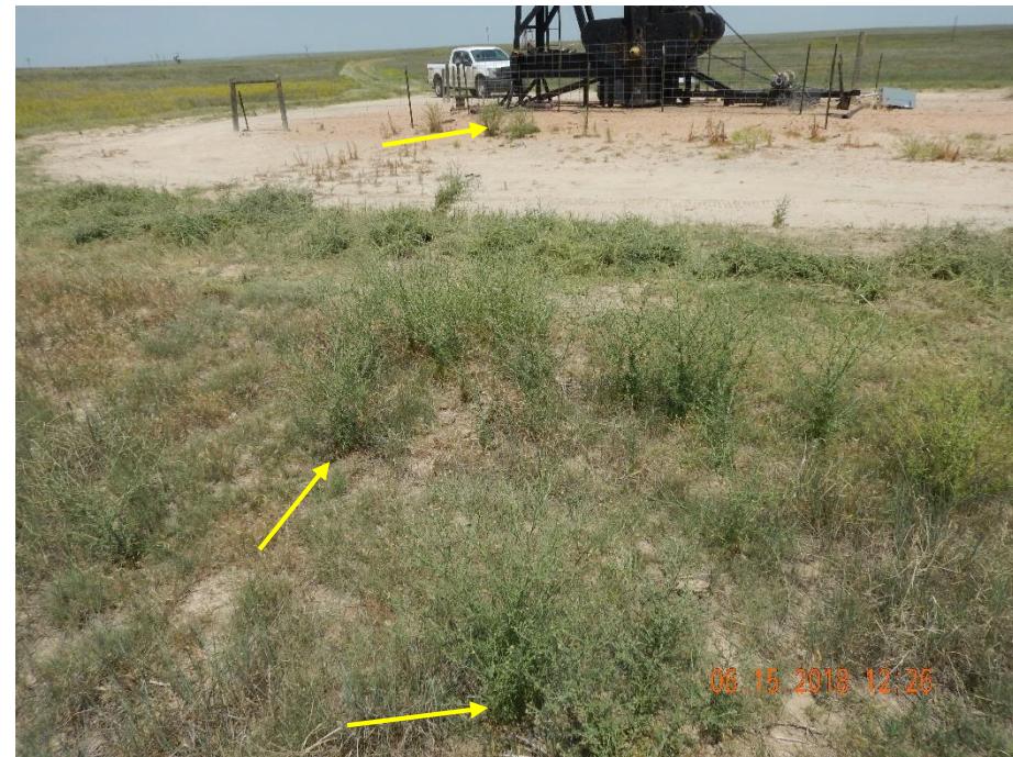
Photo 8: Photo taken from the south end of the well location, facing north. Photo shows a narrow strip along the location where mowing operations appear to have been conducted, however, there are areas where noxious weeds (Diffuse Knapweed) remain intact/uncut. In addition, Knapweed was observed on areas of the access road and location beyond where mowing operations were conducted.