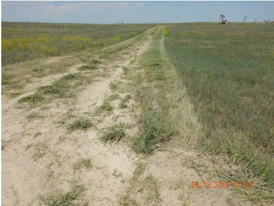
Photo 5: Photo taken from the south end of the location, facing south. Photo shows a narrow strip along the access road where mowing operations appear to have been conducted, however, there are areas where noxious weeds remain intact/uncut. Noxious weeds were also observed beyond areas of the access road and location where mowing operations were conducted.