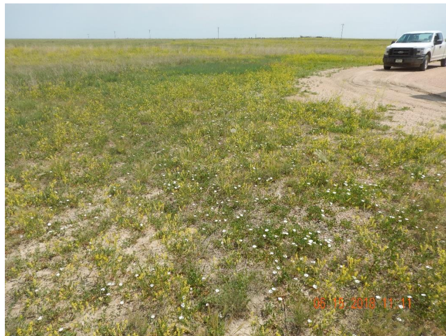
Photo 2: Photo taken from the west end of the location, facing northeast. Photo shows overview of well location.