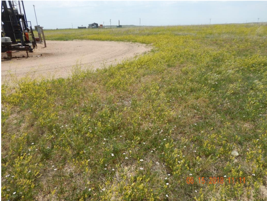
Photo 3: Photo taken from the west end of the location, facing southeast. Photo shows overview of well location.