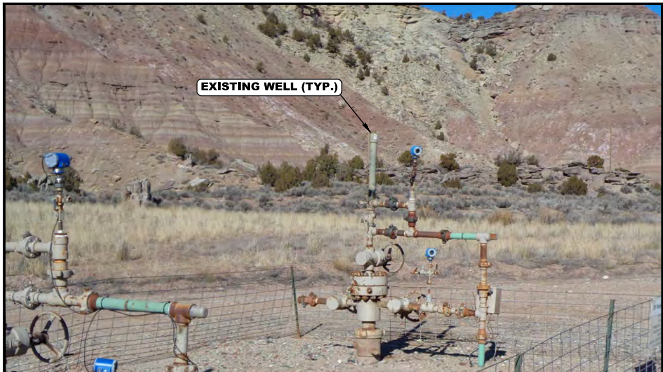
PHOTO: VIEW OF EXISTING WELLS