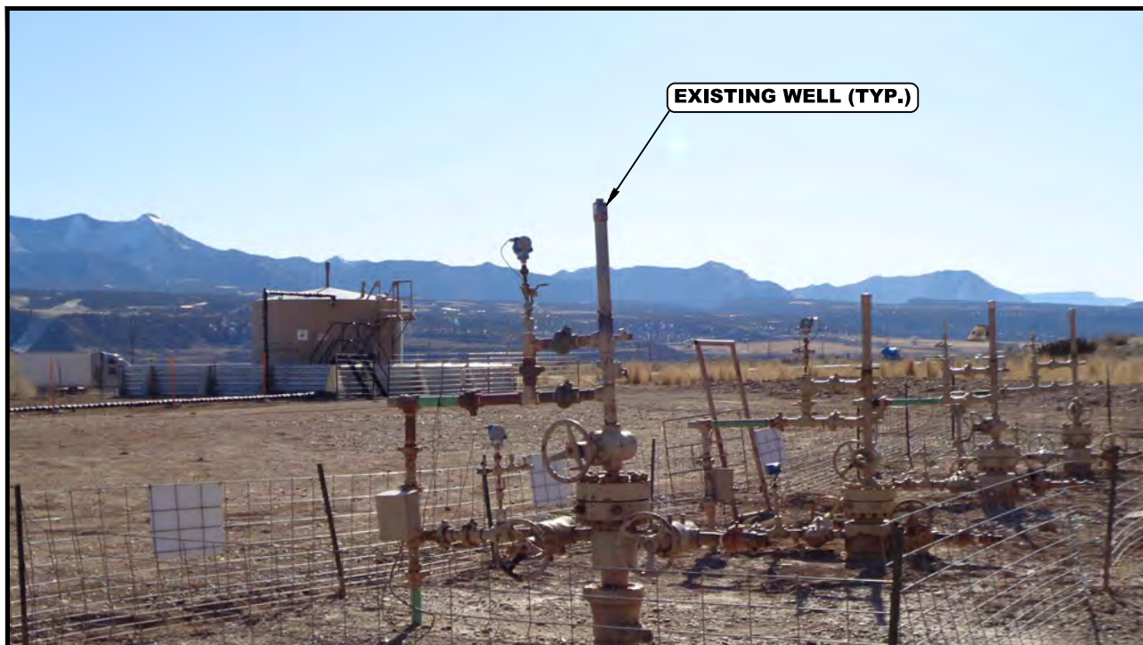
PHOTO: VIEW OF EXISTING WELLS