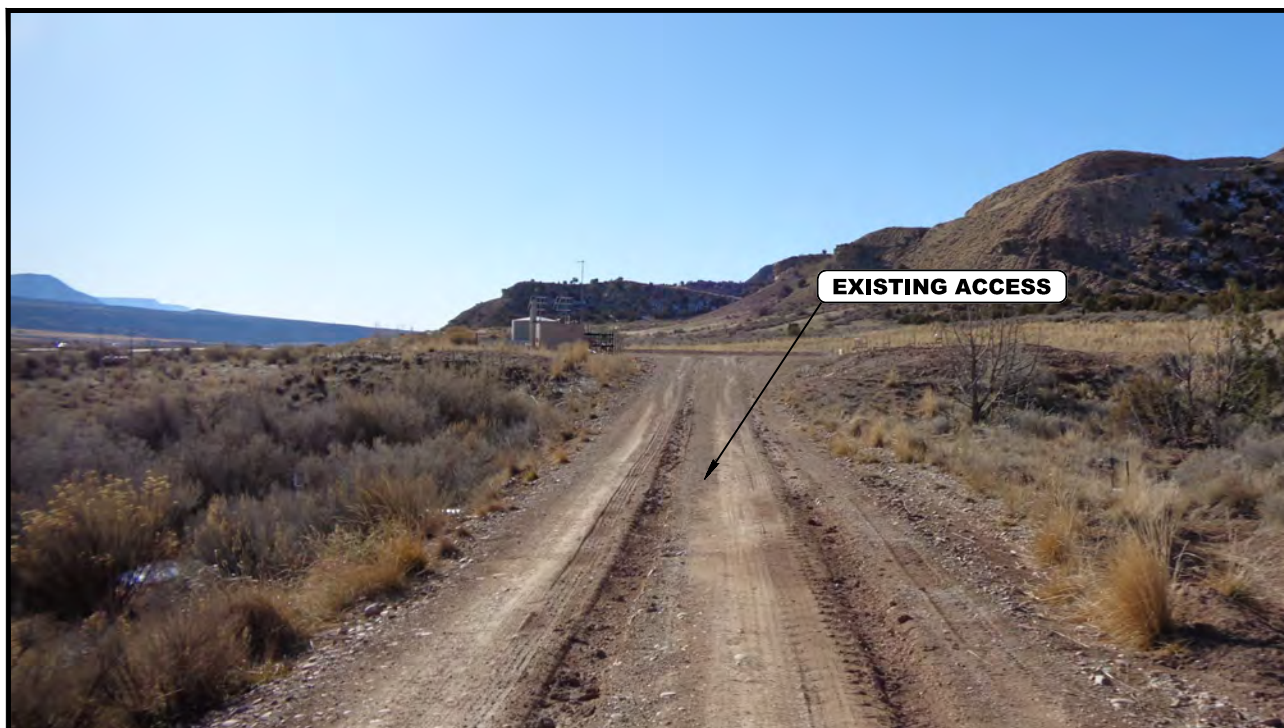
PHOTO: VIEW FROM BEGINNING OF EXISTING ACCESS