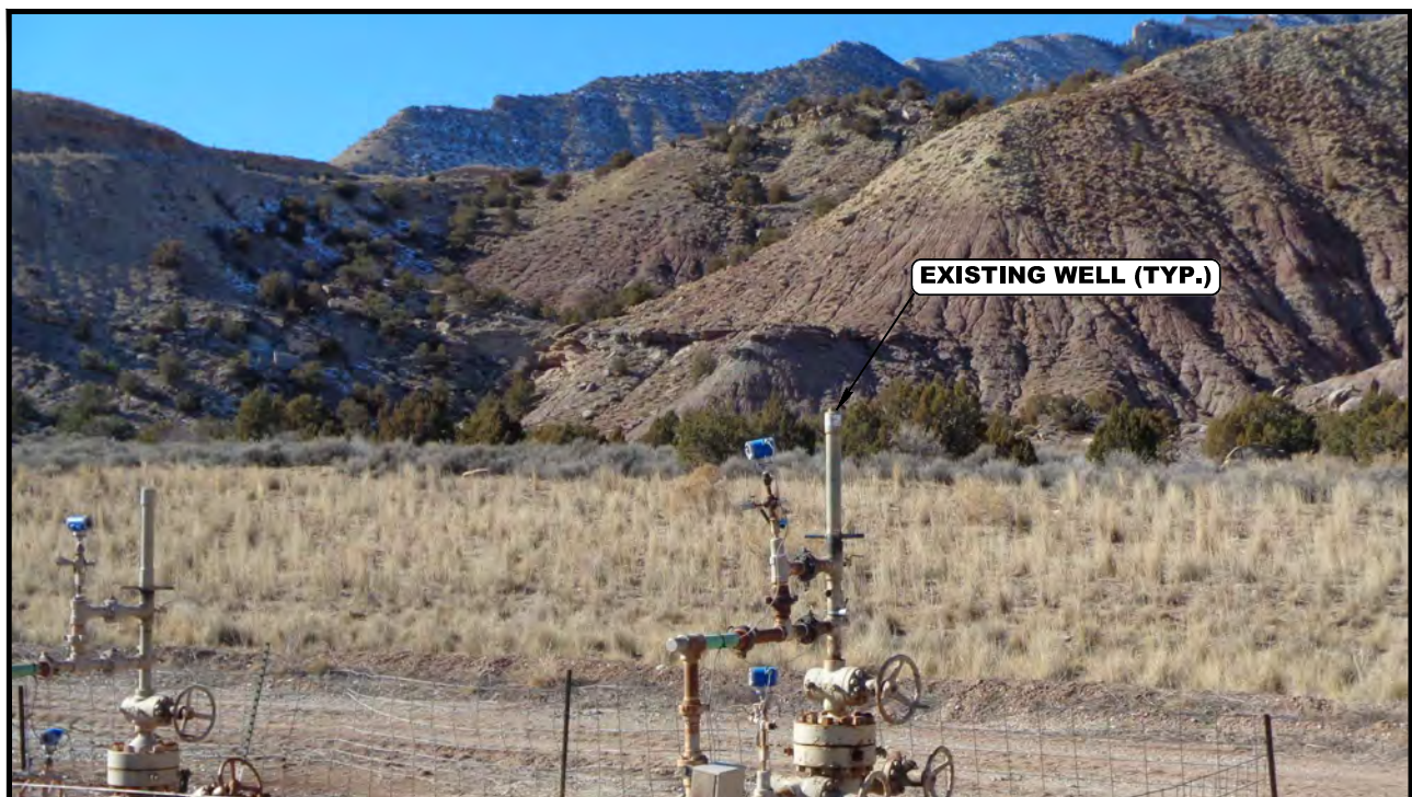
PHOTO: VIEW OF EXISTING WELLS