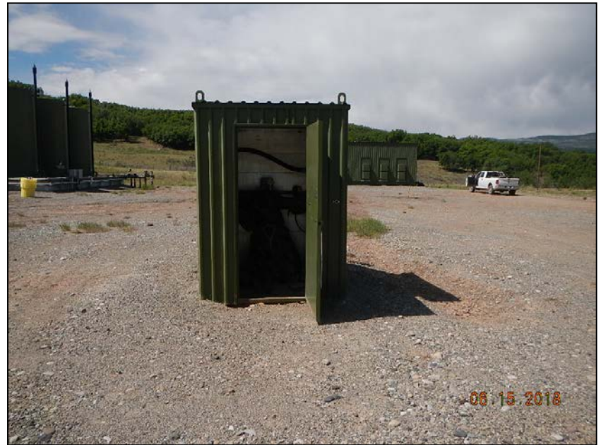
Photo 2. Wellhead in shelter.