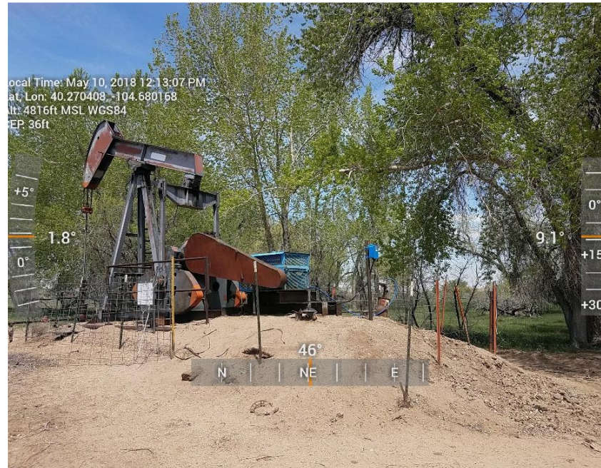
Fence before CA